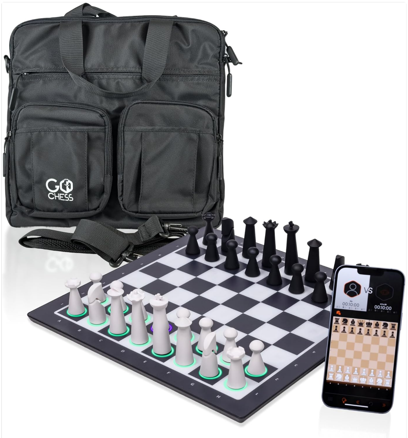
Image: The GoChess Mini AI Chess Board, chess pieces, a smartphone displaying the GoChess app, and the Deluxe Carry Bag. This image showcases the complete bundle.