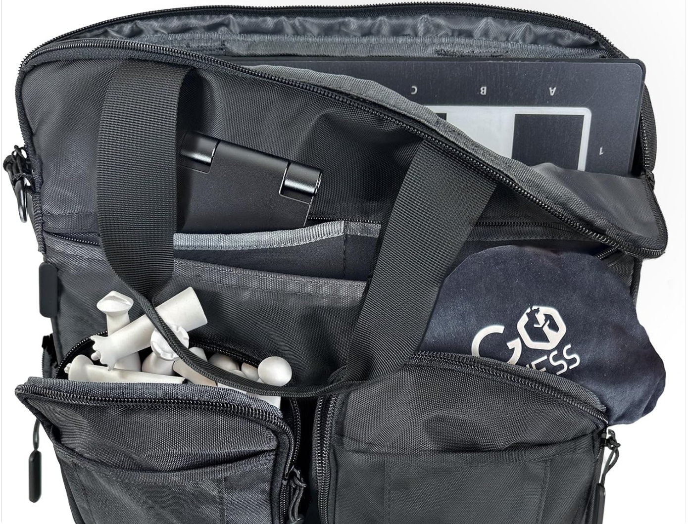
Image: A visual representation of the GoChess Mini package contents, including the GoChess Mini Board, a full set of chess pieces, a USB charging cable, a mobile stand, two storage pouches for pieces, and an indication of the free companion app.