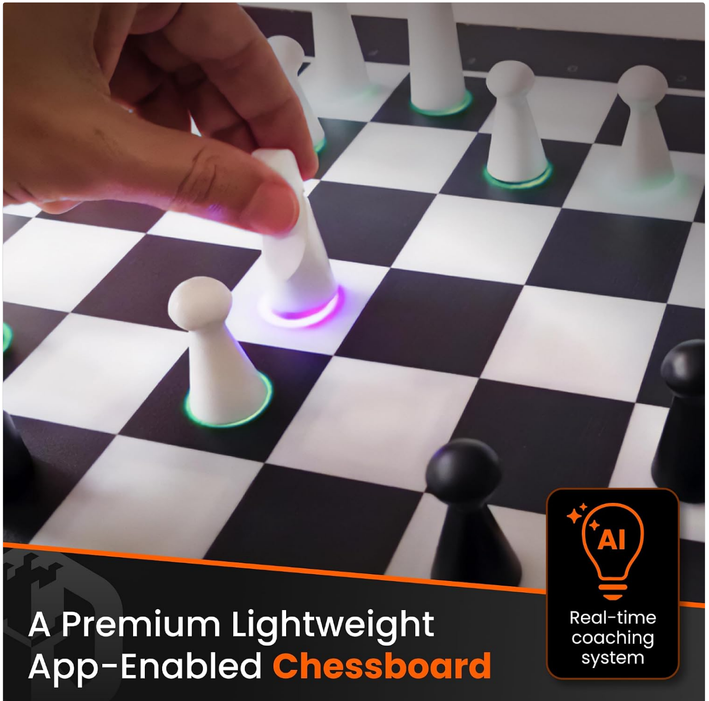
Image: A close-up of a hand moving a white pawn on the GoChess Mini board, with the square beneath the pawn illuminated by a purple light, indicating the AI coaching system in action.

The GoChess Mini offers an intelligent AI coaching system to help you improve your game. The board's advanced light system provides real-time guidance.