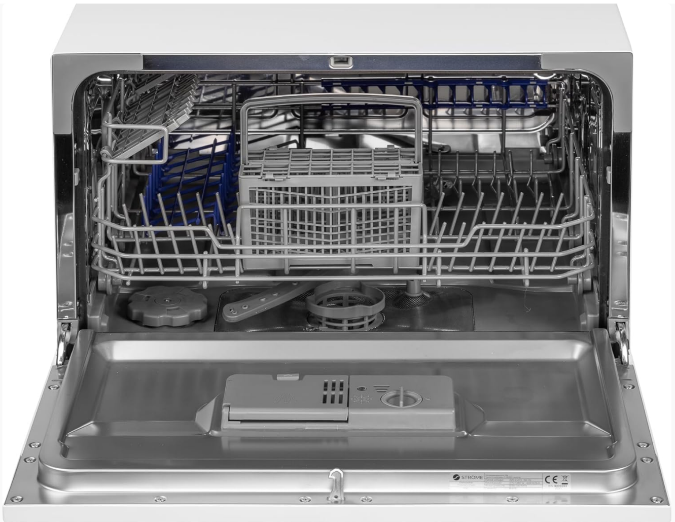
Image: The interior of the dishwasher, showing the arrangement of racks and the cutlery basket.