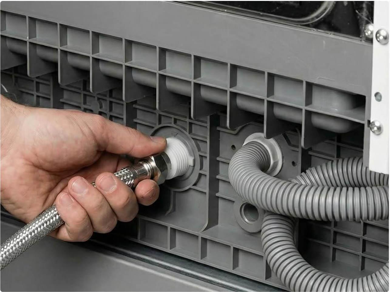
Image: A hand securing the water inlet hose connection at the rear of the dishwasher.