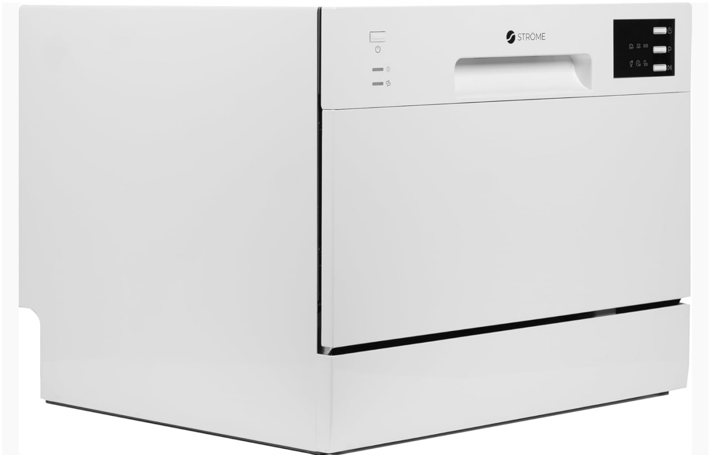
Image: Side view of the dishwasher, illustrating the hose connections at the rear.