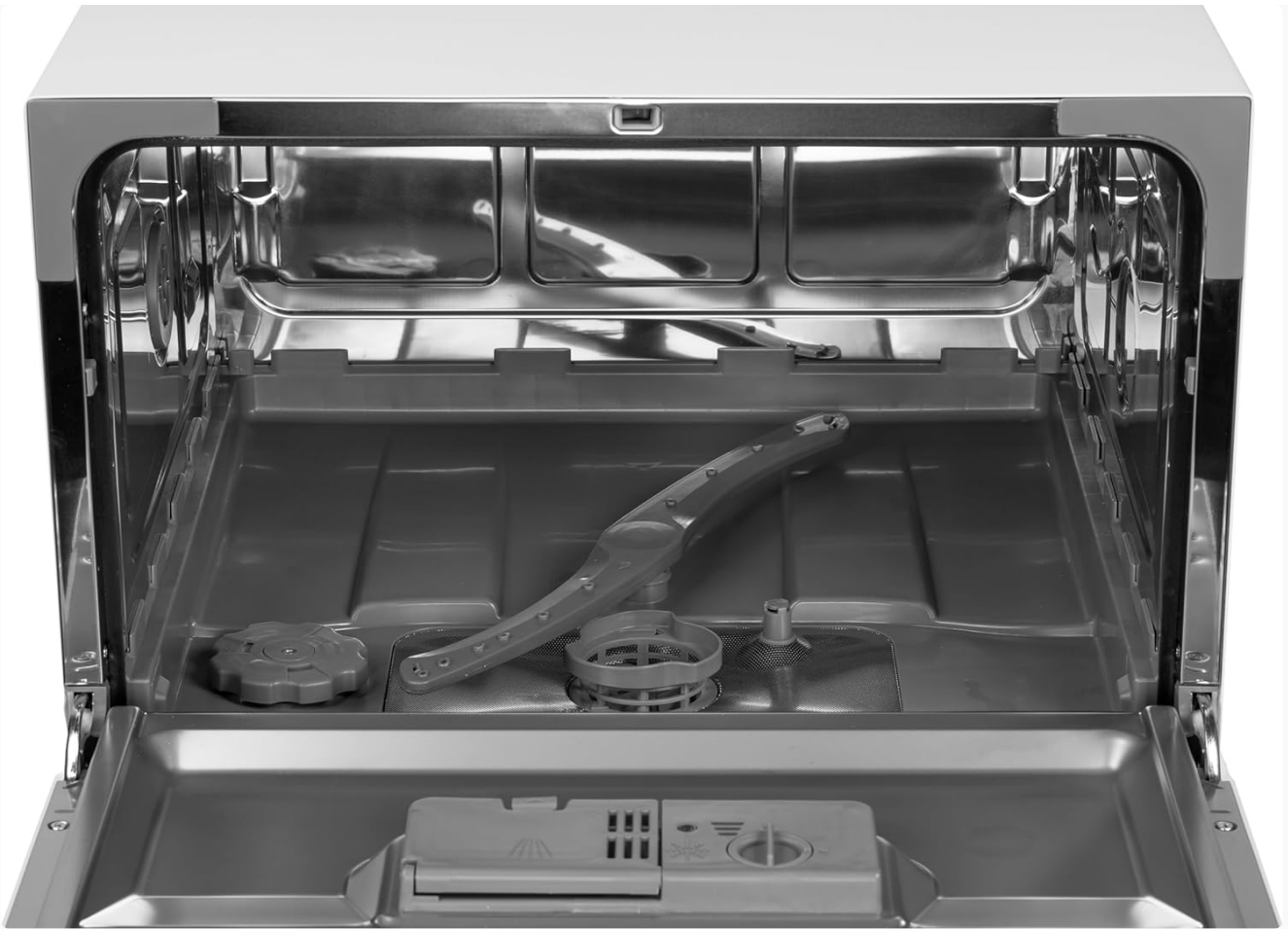
Image: The empty interior of the dishwasher, highlighting the filter system at the bottom.