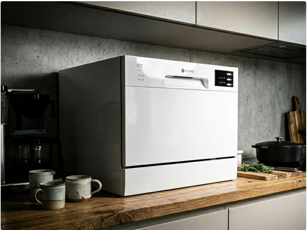
Image: The Ströme TDW55C01 compact dishwasher positioned on a kitchen countertop.