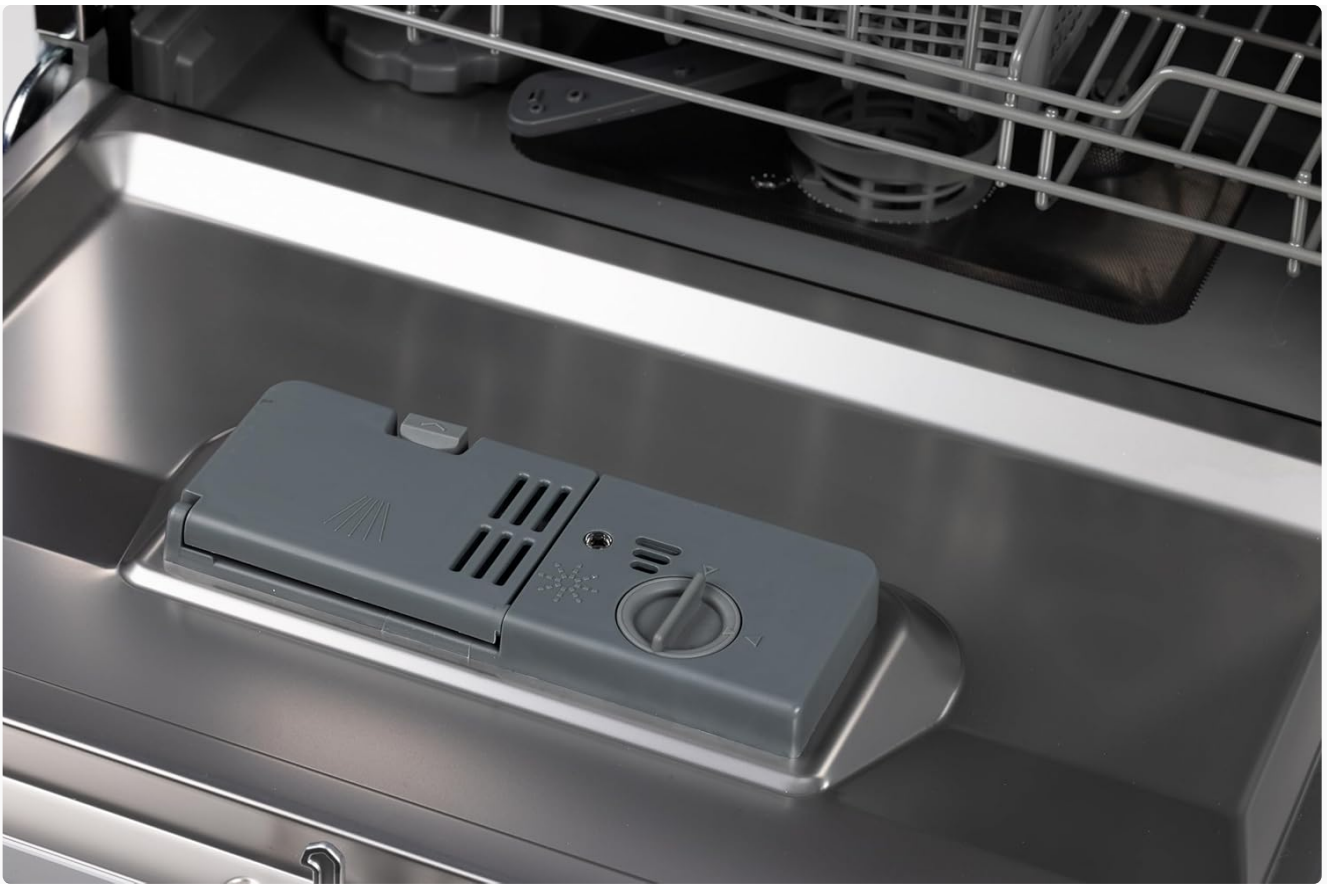
Image: A close-up of the detergent and rinse aid dispenser inside the dishwasher door.