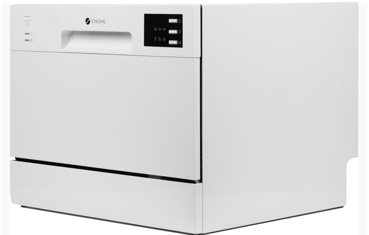
Image: Detailed view of the dishwasher's control panel, showing the LED display and program selection buttons.