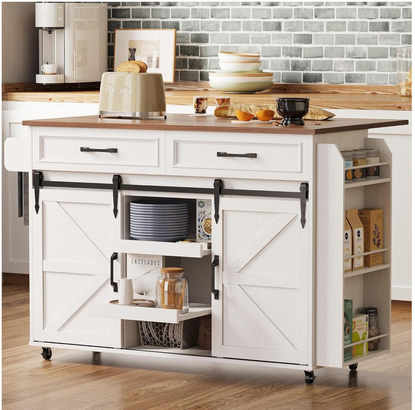
Image 1.1: Overview of the IRONCK Kitchen Island, showcasing its design and features in a kitchen setting.