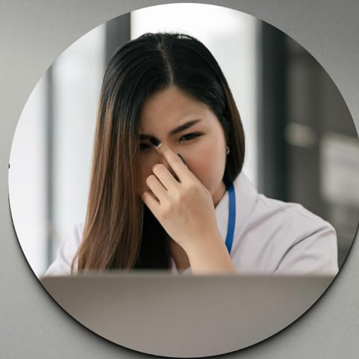
Weak Sight People