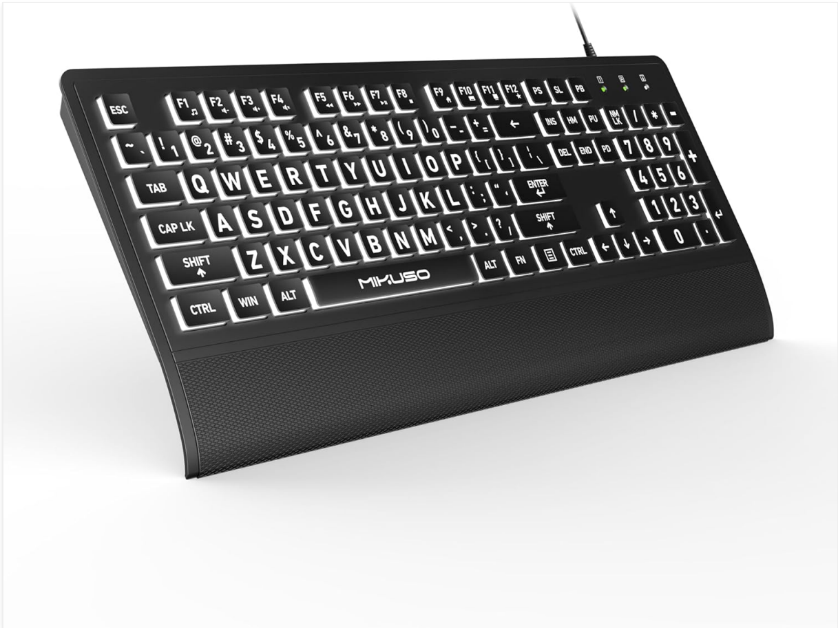
Figure 1: MIKUSO Large Print Backlit Wired Computer Keyboard.