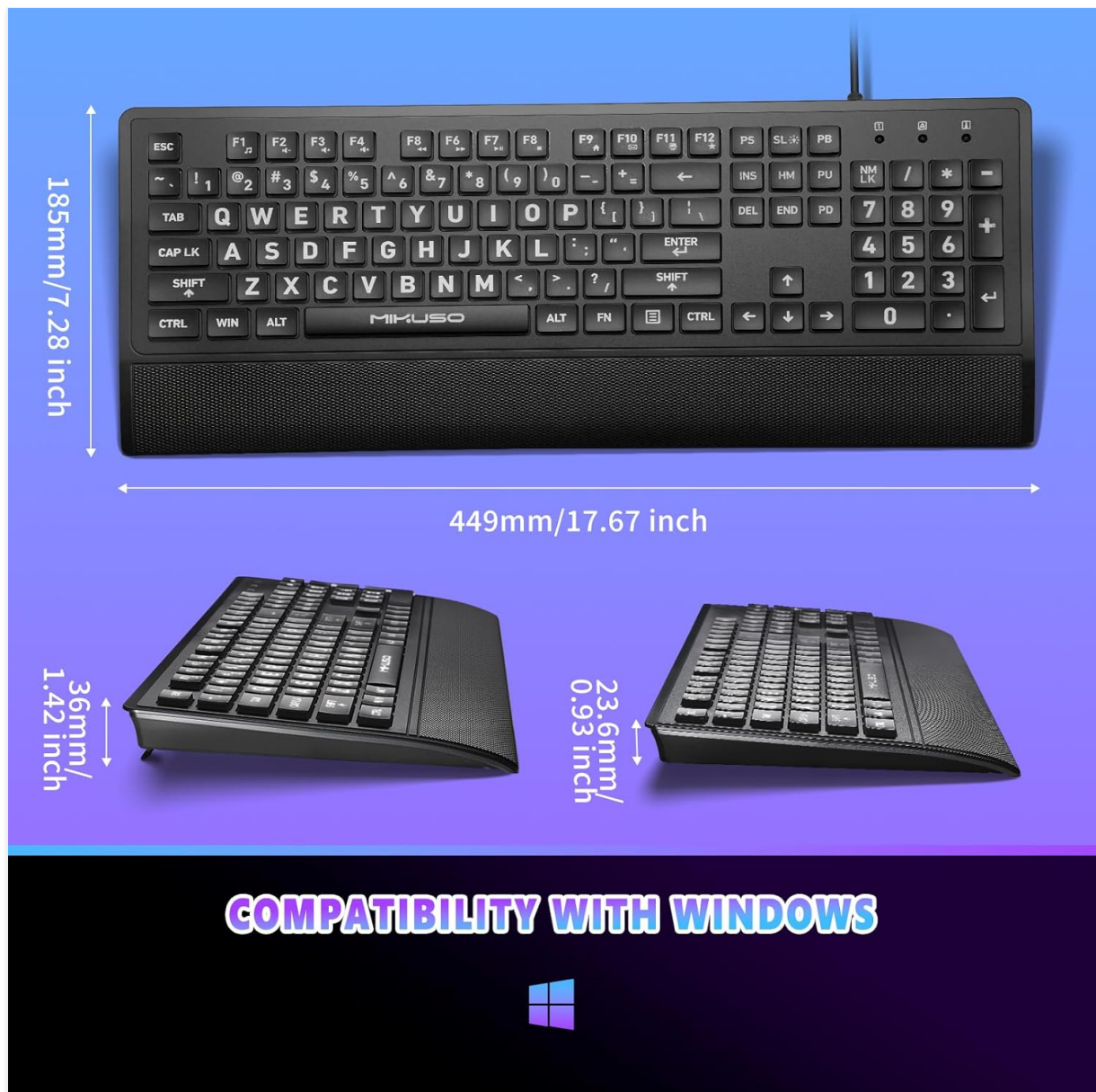
Figure 8: Diagram showing the physical dimensions of the MIKUSO keyboard.