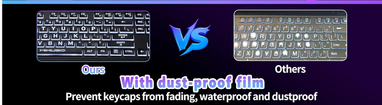
Figure 7: The keyboard with its transparent protective cover in place, demonstrating protection against liquid spills and dust.