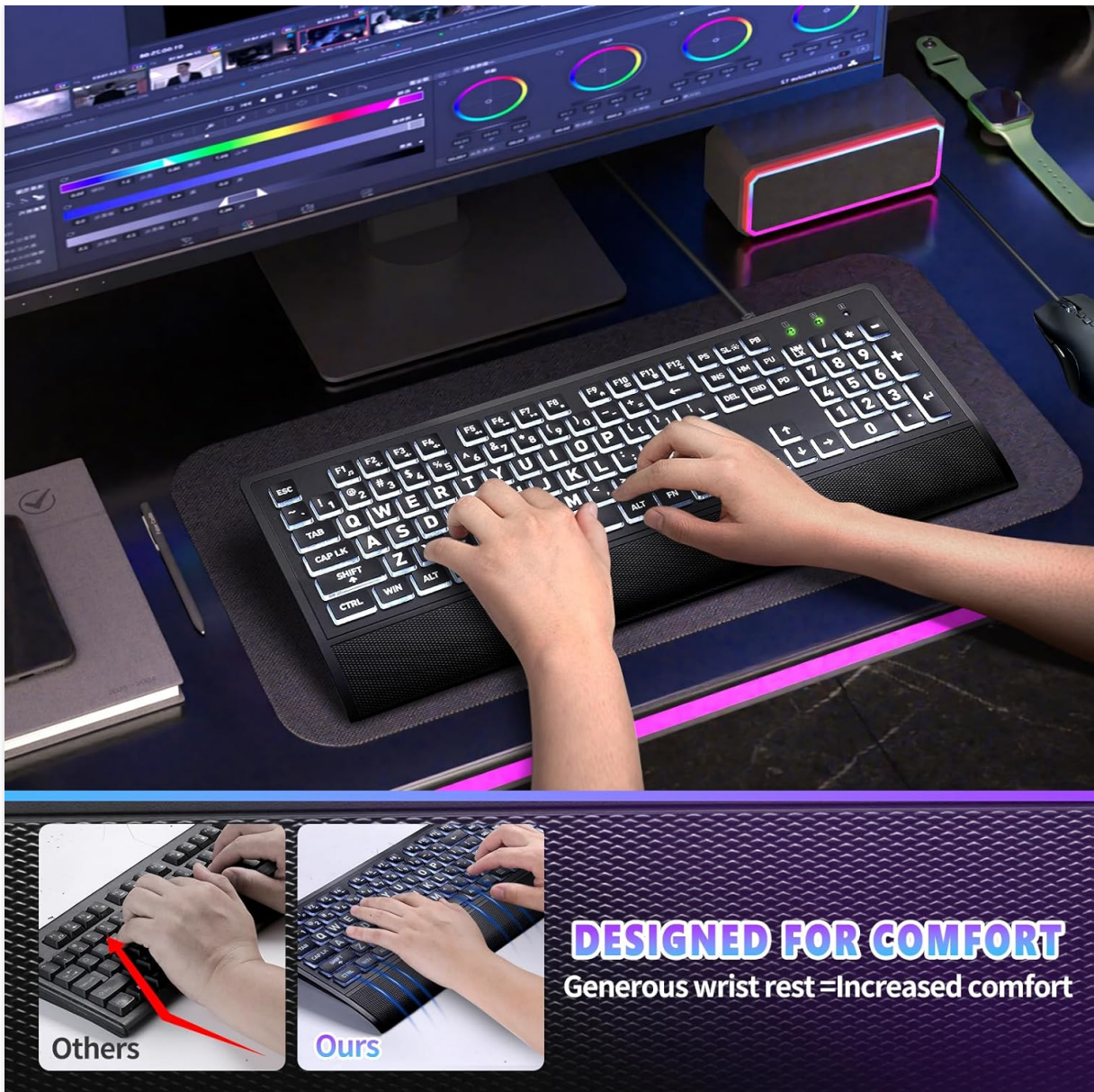
Figure 6: A user's hands positioned comfortably on the keyboard's integrated wrist rest, demonstrating ergonomic design.