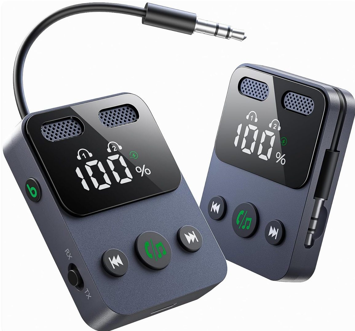
Image: The SUPERONE Bluetooth 5.3 Audio Adapter, shown with its integrated 3.5mm audio jack and USB-C charging port.