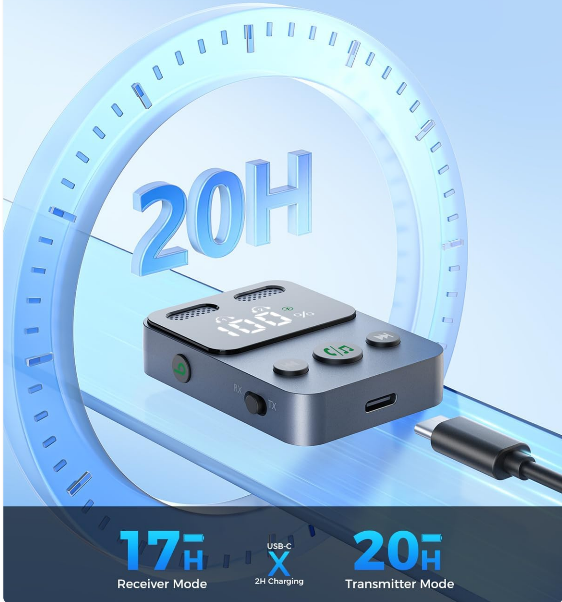
Image: The adapter connected to a USB-C charging cable, highlighting its long battery life and quick charging capability.