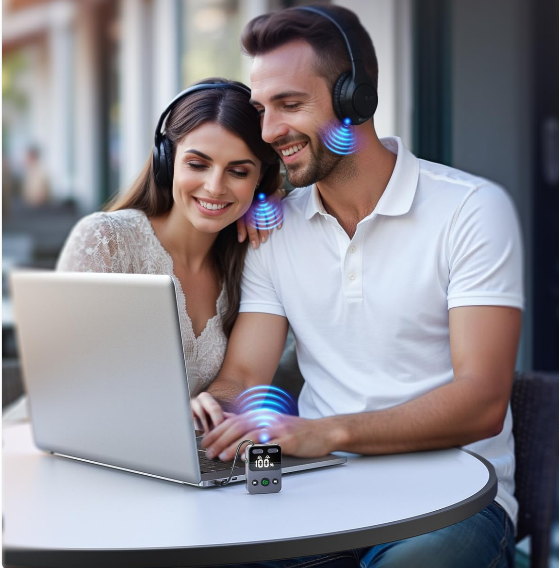
Image: Illustration of dual pairing, showing two individuals listening to audio from a laptop via the adapter and two separate Bluetooth headphones.

Easily pair with 2 bluetooth headphones simultaneously