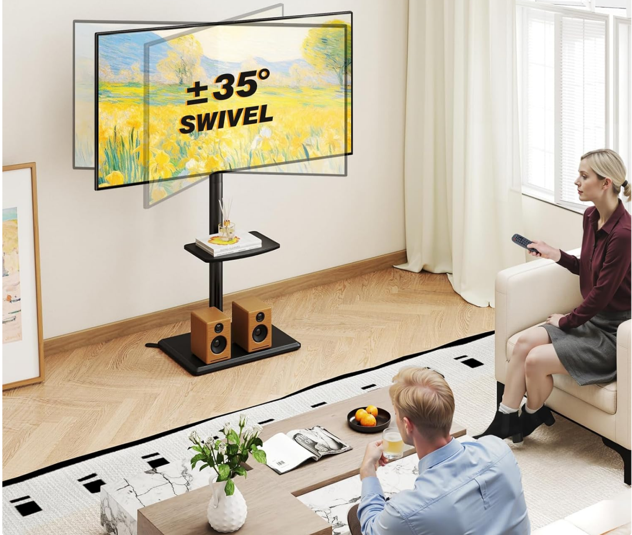
Illustration of the TV stand's swivel function, allowing for a 70-degree total rotation to achieve comfortable viewing angles.