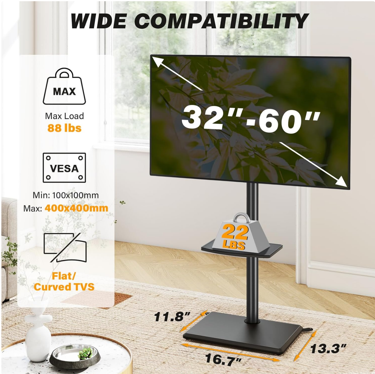
Diagram showing the compatibility range for TV sizes (32-60 inches), maximum load (88 lbs), and VESA patterns (100x100mm to 400x400mm).