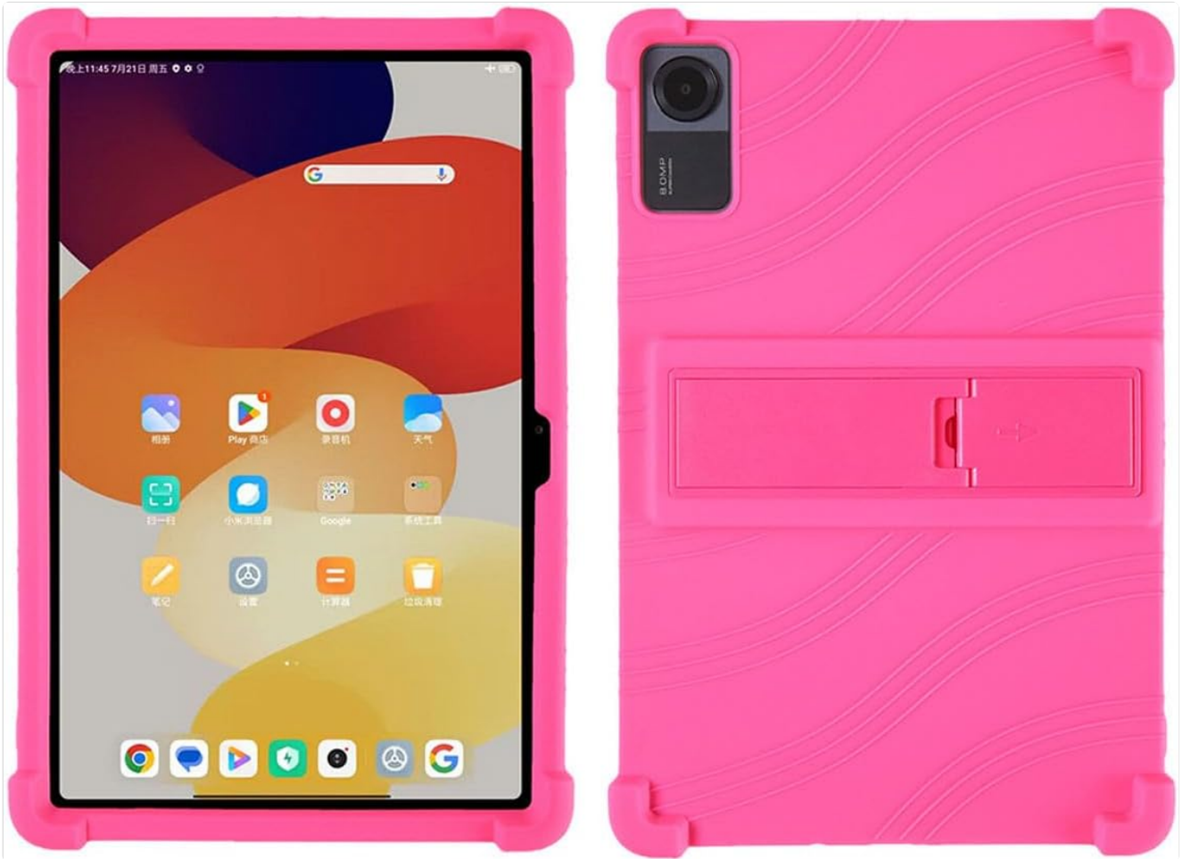
Figure 3.1: Tablet installed in the protective case, showcasing precise fit and design.