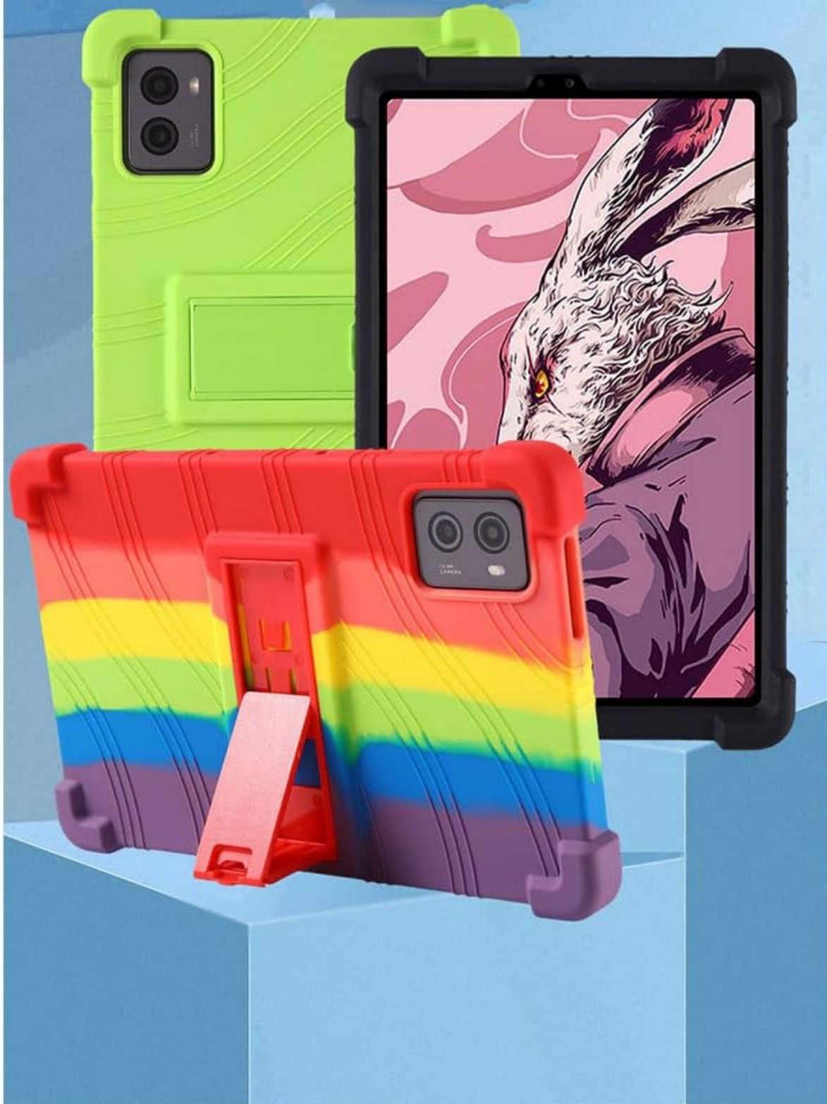
Figure 4.3: Anti-slip texture for a secure grip.

【 Full package - Thickening - Shock absorption - Anti drop 】