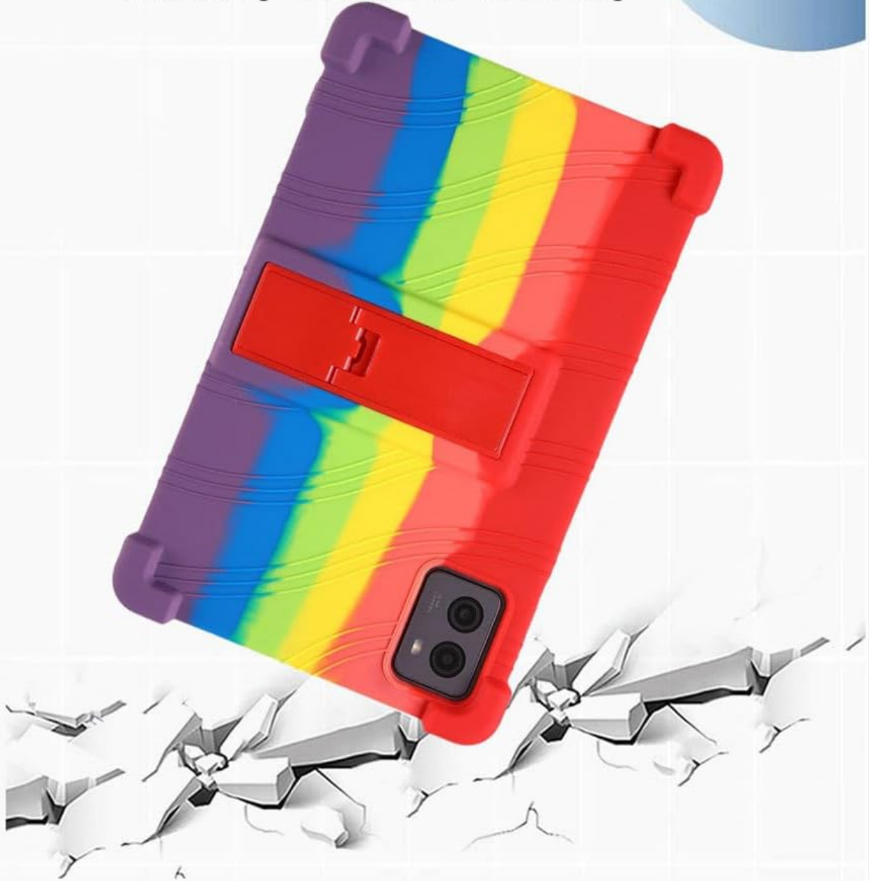
Figure 4.2: Thickened edges provide enhanced drop protection.

Thickened design at the edges and corners cushioning without fear of falling