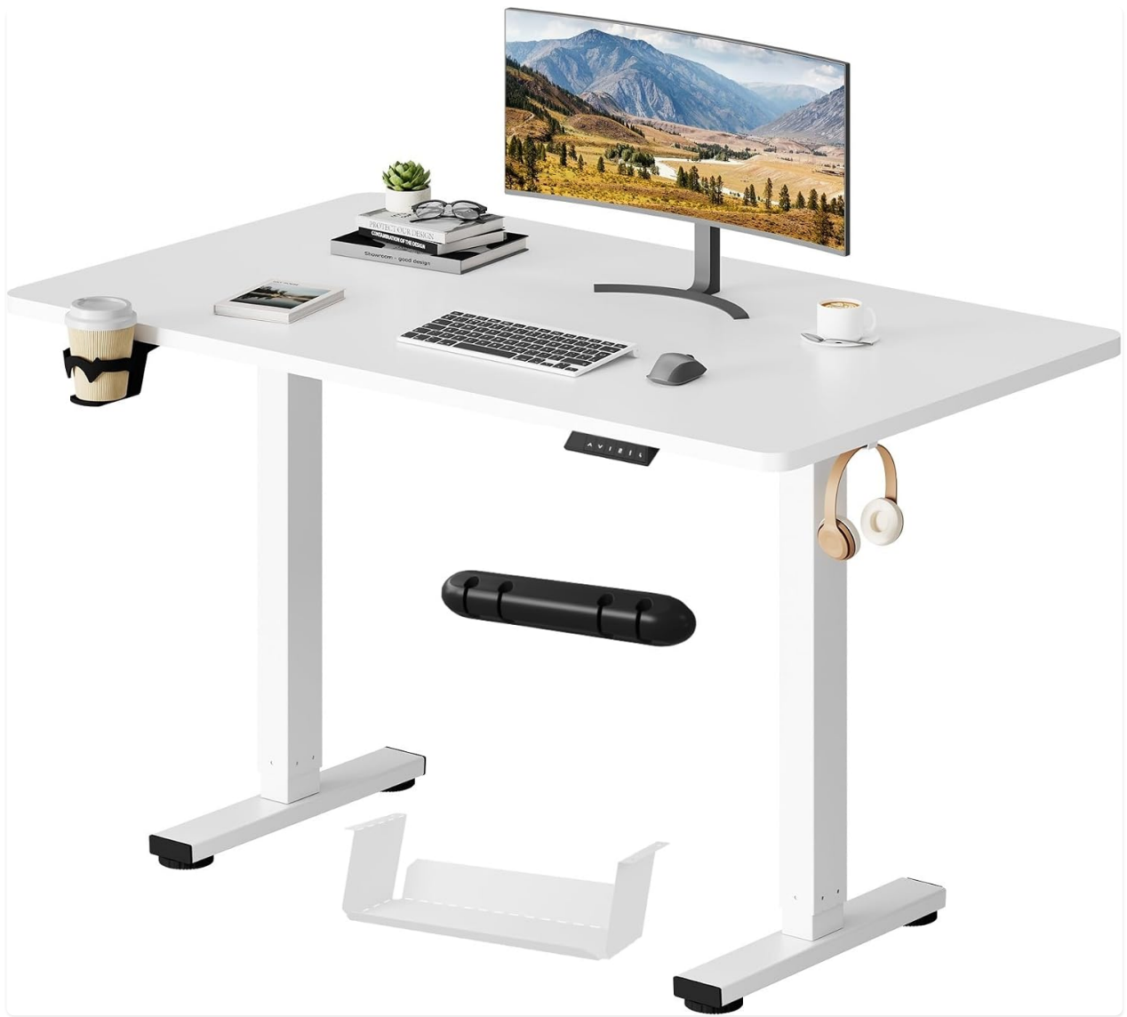
The SANODESK Q1 Electric Standing Desk, featuring a clean white finish and ergonomic design.