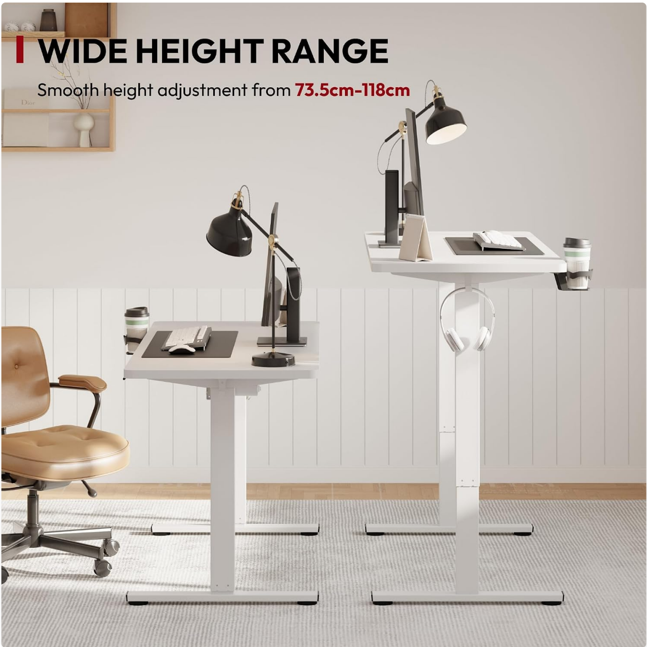
Illustration of the desk's wide height range, allowing smooth adjustment between 73.5 cm and 118 cm.

Smooth height adjustment from 73.5cm-118cm