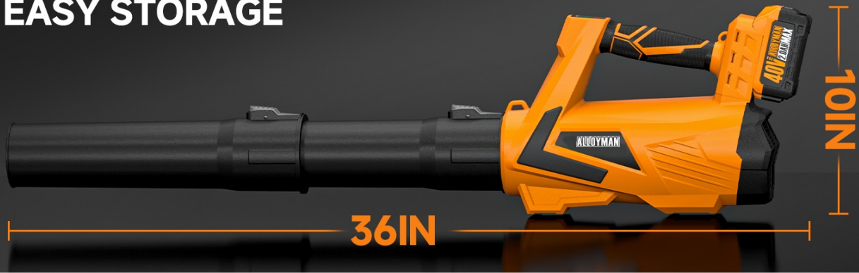
Image: Blower's compact design for easy storage.