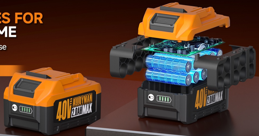
Image: Dual battery system for extended use.