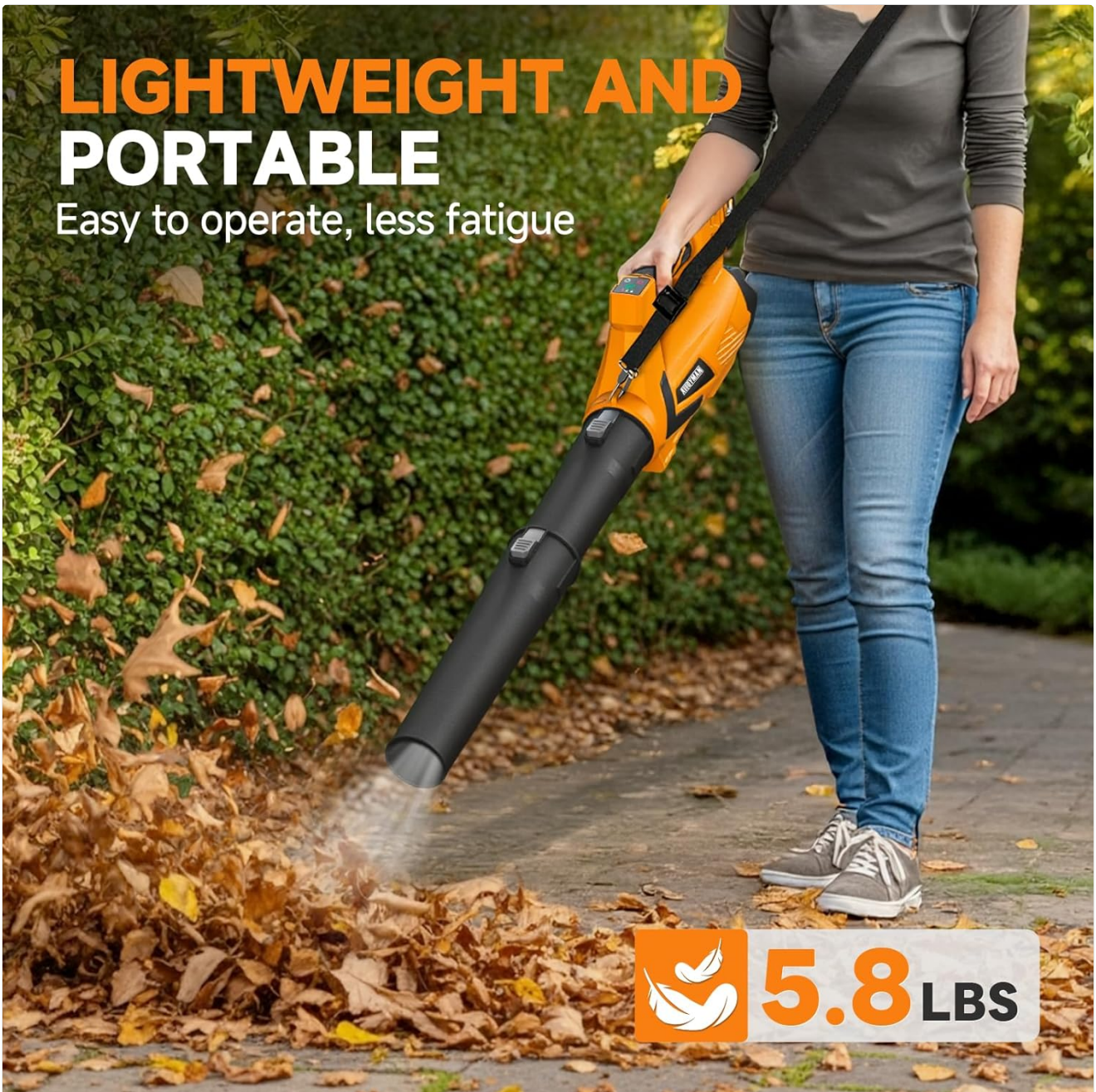
Image: Lightweight design of the blower.