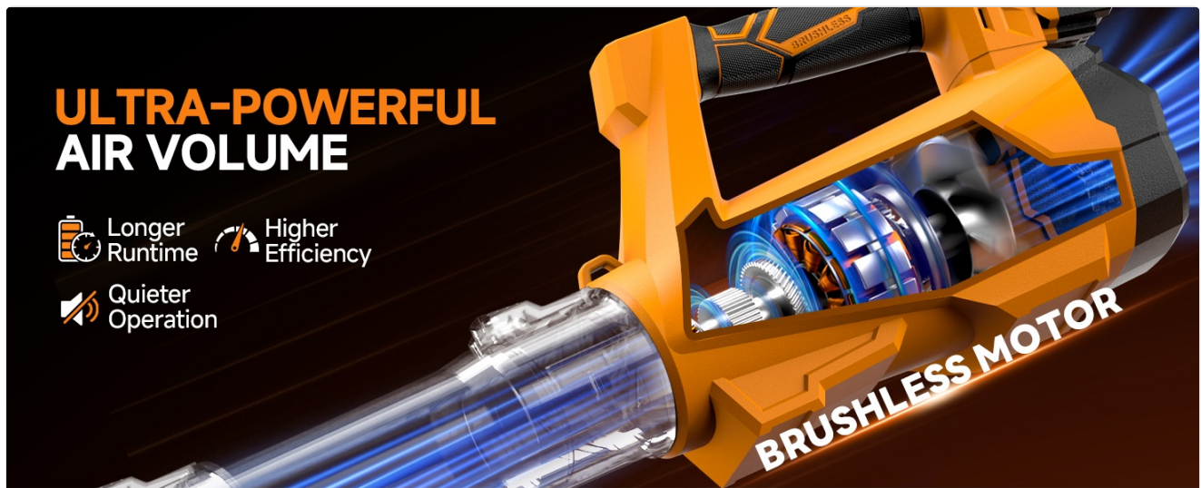
Image: Internal view of the brushless motor.