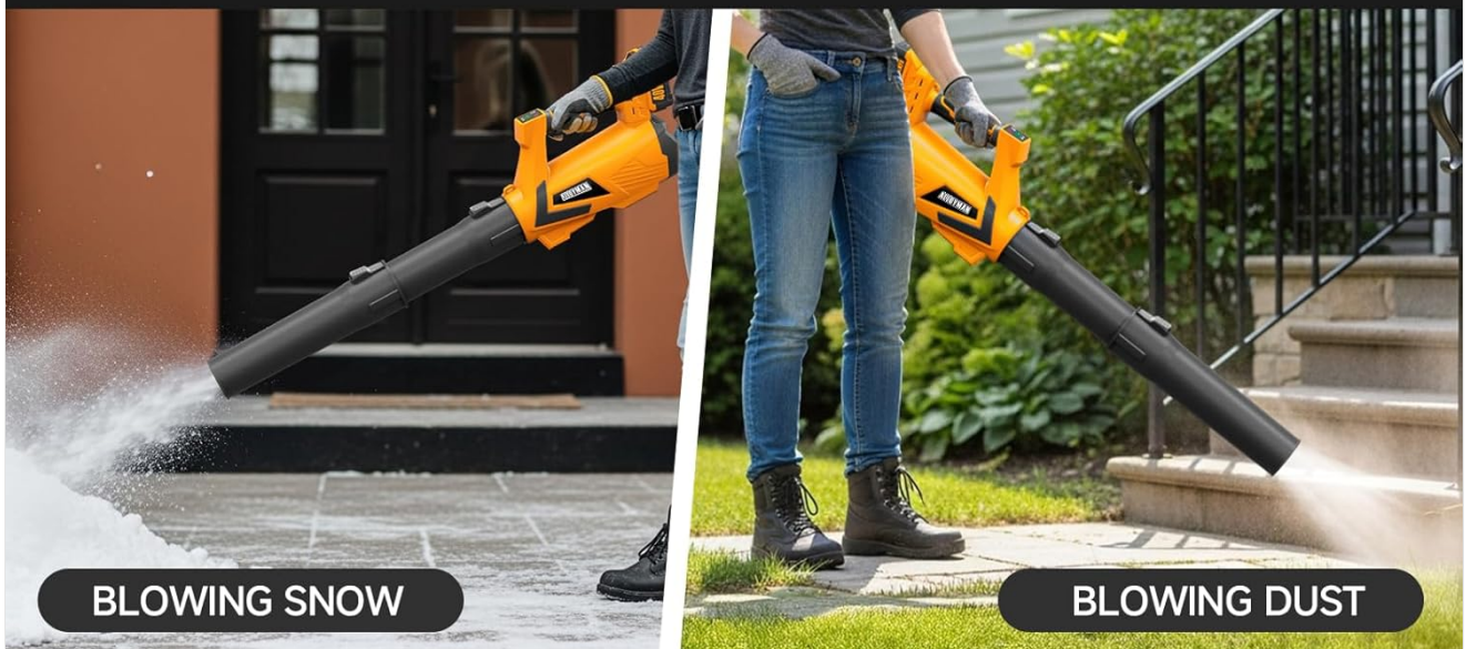
Image: Versatile applications of the leaf blower.