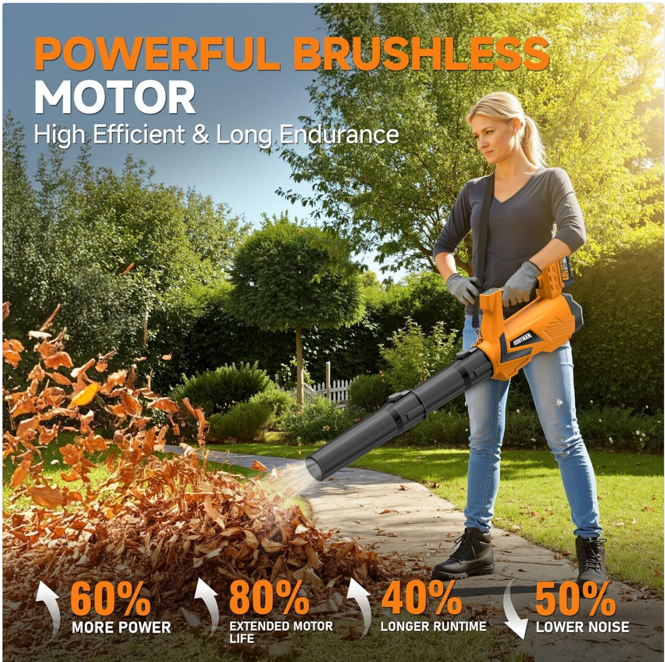
Image: Blower clearing leaves with powerful airflow.