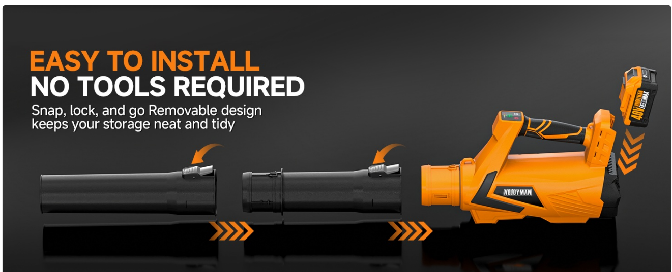
Image: Step-by-step illustration of nozzle attachment.