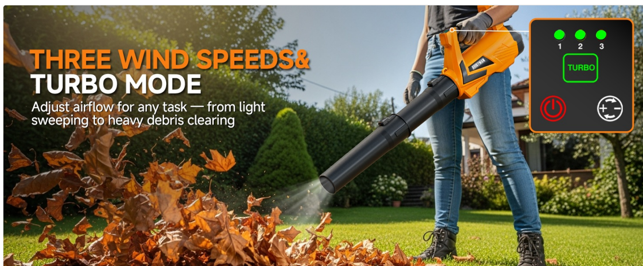
Image: Blower in use, highlighting speed control.