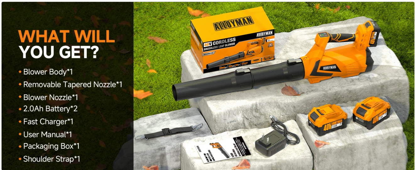
Image: Contents of the Alloyman 40V Cordless Leaf Blower package.