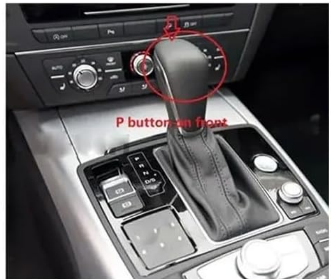
For 2017-2018 years car

Image: Compatibility Check. This image illustrates how to identify your car's MMI software version (RMC 2012-2018, HN+R 2012-2015, MHI2 2016-2018) and gear shift knob type (left for 2012-2016, front for 2017-2018) to ensure proper fitment.