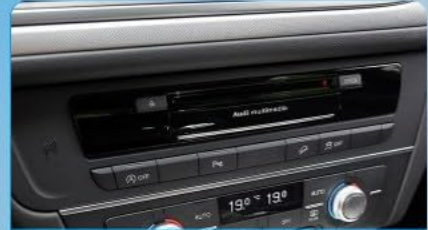
Original CD Player