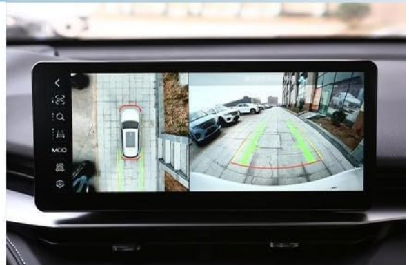
Image: 360 Rear View Camera (Optional). This diagram illustrates the concept of a 360-degree camera system, showing views from the front, rear, left, and right cameras, and how they combine to provide a comprehensive view on the display.