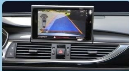
Backup Camera Display