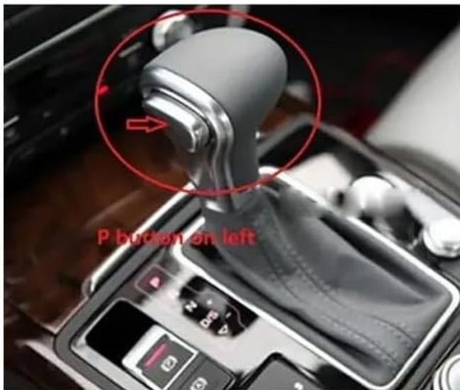
For 2012-2016 years car