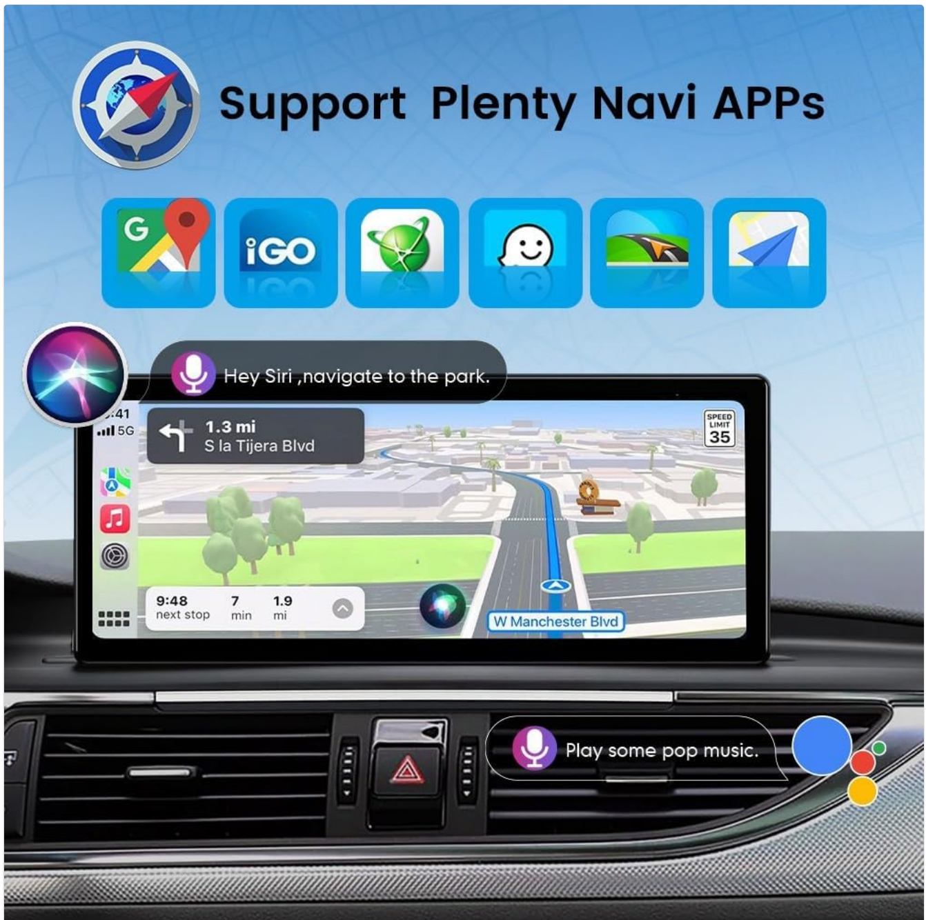
Image: Support Plenty Navi APPs. This image displays the navigation interface with icons for popular navigation apps like Google Maps and iGO, demonstrating voice command integration for directions and music playback.

be used for navigation and other functions.