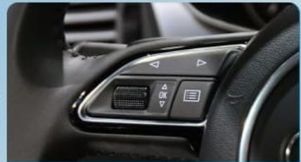
Steering Wheel Control Function

Image: Support Original Car Settings. This image shows how the new head unit supports and integrates with the car's original amplifier system, radio, CD player, Bluetooth, backup camera display, and steering wheel control functions.