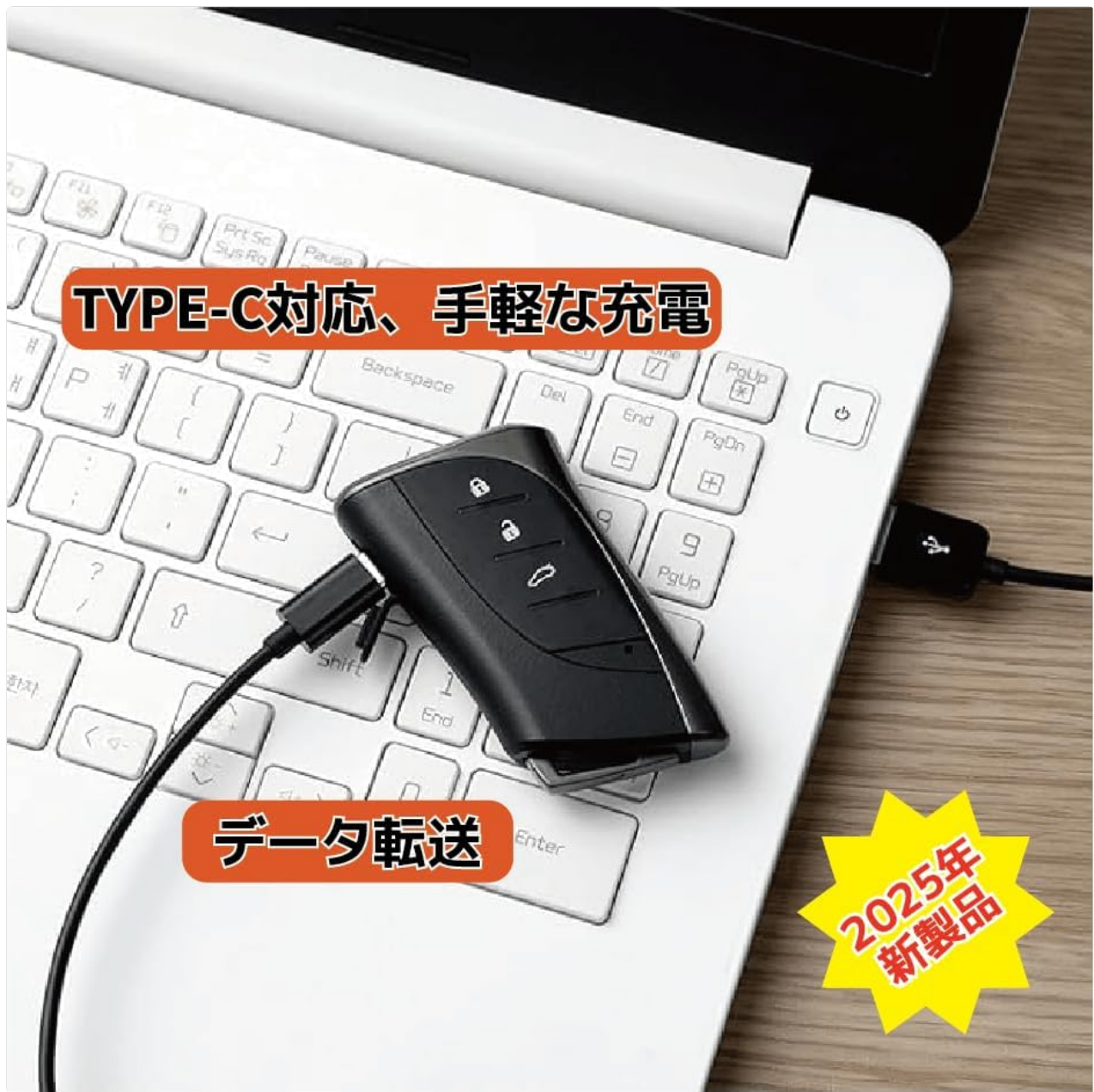
Figure 4.1: Charging and data transfer via USB Type-C.