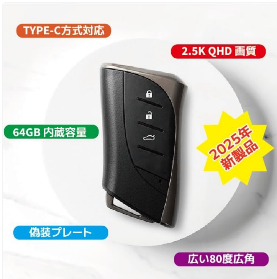
Figure 2.1: Key features of the DAMOACAM CK400FQHD.