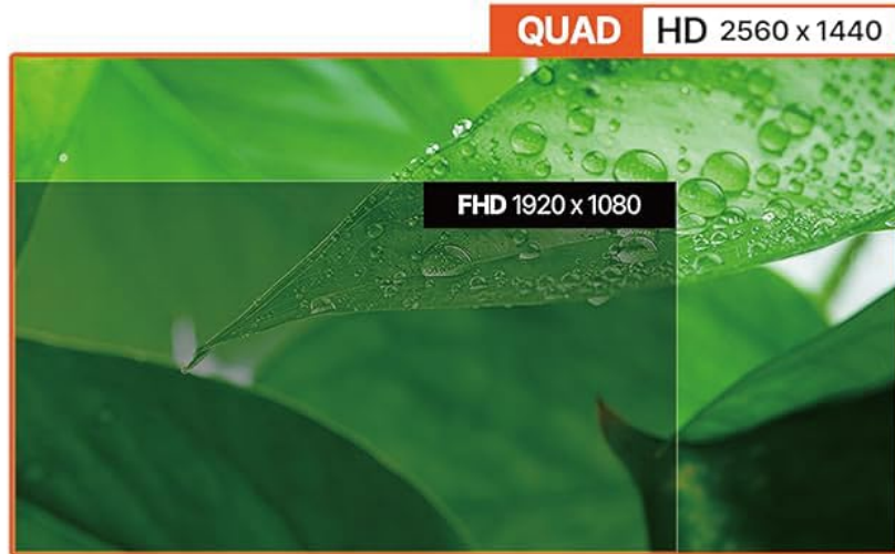
Figure 2.2: Visual comparison of QHD (2560x1440p) and FHD (1920x1080p) video quality.

超小型カメラでありながら、2560x1440 QHD高解像度記録に対応し、HD 1080Pに比べて鮮明で鮮やかな画質を提供します。