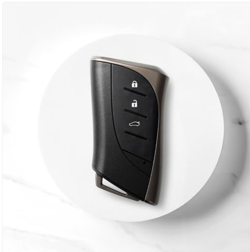
Figure 1.1: The DAMOACAM CK400FQHD Keyless Spy Camera, designed for discreet recording.

Thank you for purchasing the DAMOACAM 2.5K Keyless Spy Camera (Model: CK400FQHD). This ultra-compact, covert camera is designed for discreet video recording, surveillance, and evidence collection. Its keyless fob design ensures complete stealth, making it ideal for various scenarios including personal safety, home/office monitoring, and meeting recording. This manual provides detailed instructions to help you set up, operate, and maintain your device.