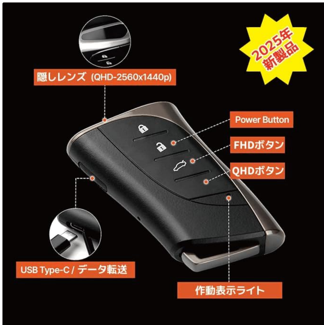
Figure 5.1: Key components and controls of the camera.

The device features a hidden lens, a Power Button, an FHD Button, a QHD Button, a USB Type-C port for charging and data transfer, and an operation indicator light.