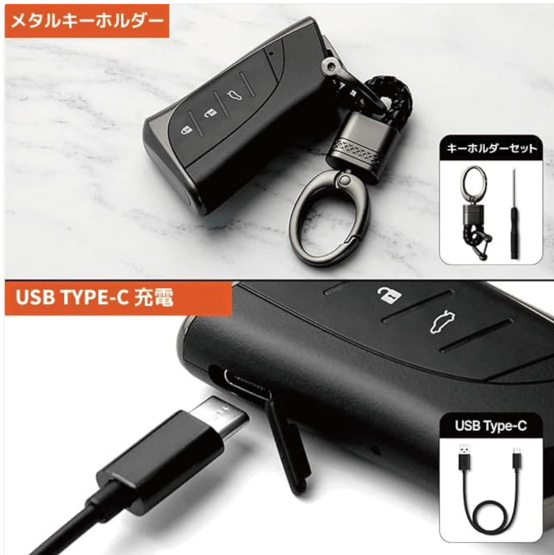
Figure 3.1: Included accessories: Key holder and USB Type-C cable.