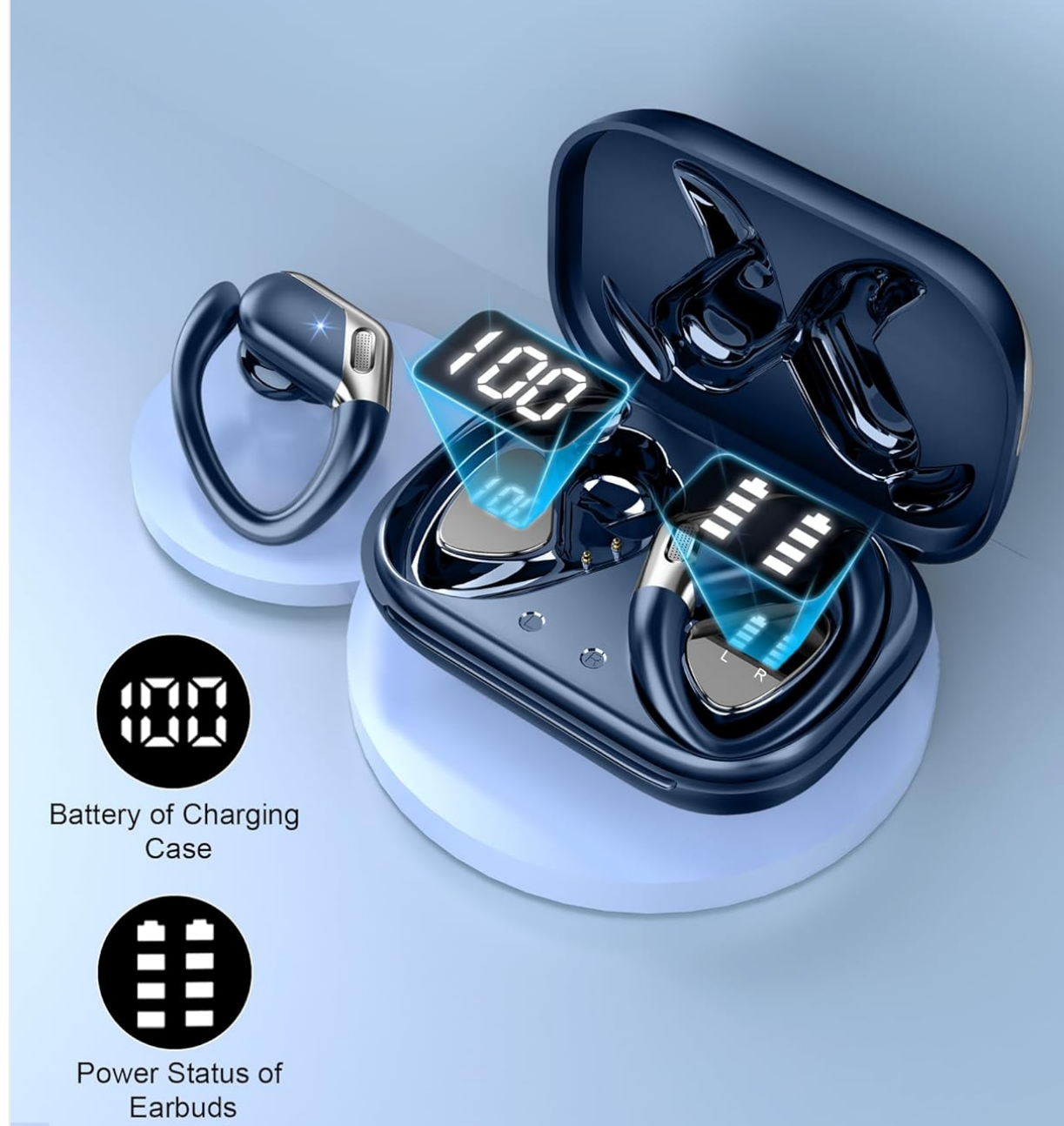
Image illustrating the LED digital power display on the charging case, showing the battery percentage of the case and individual earbud charging status.