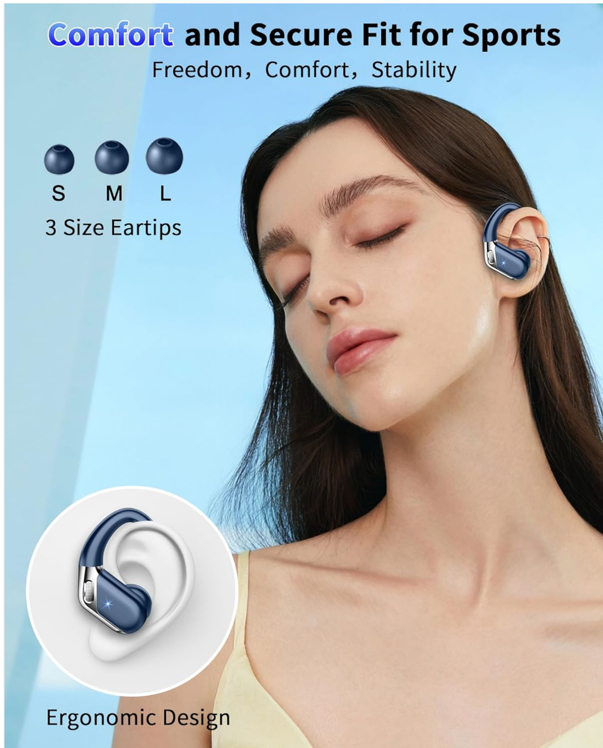
Image showing the ergonomic design of the Matast B02 earbuds with ear hooks and different eartip sizes (S, M, L) for a comfortable and secure fit during sports.