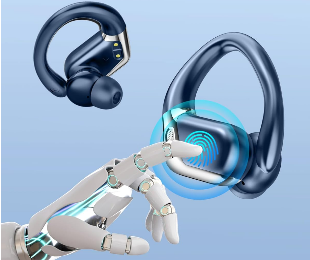
Diagram illustrating the touch control functions on the Matast B02 earbuds, including play/pause, volume adjustment, call management, and voice assistant activation.