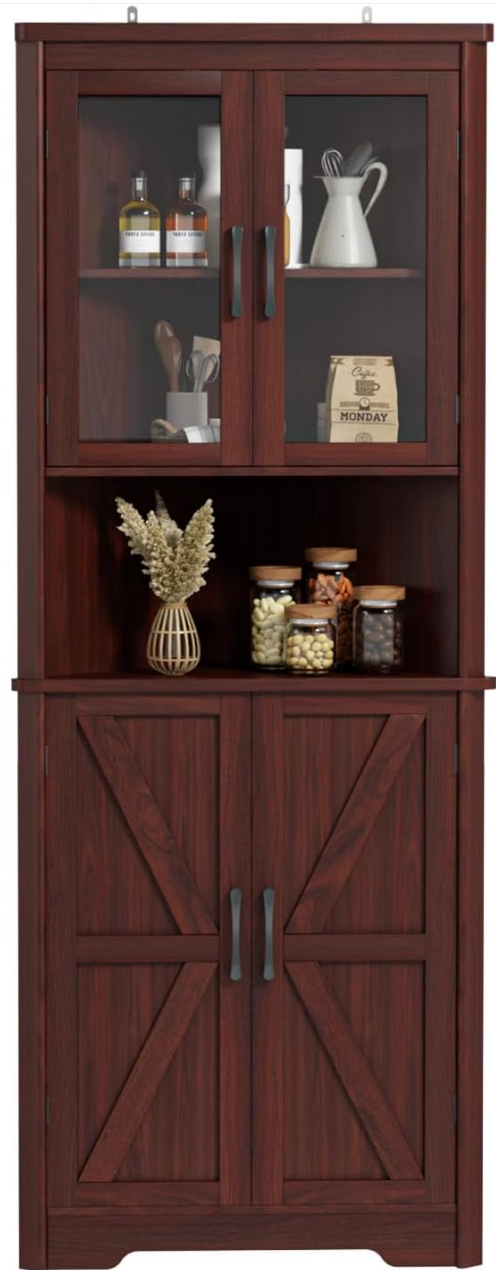
Figure 5: Barn Door Design. This image focuses on the lower section of the cabinet, highlighting the decorative barn doors that provide discreet storage.