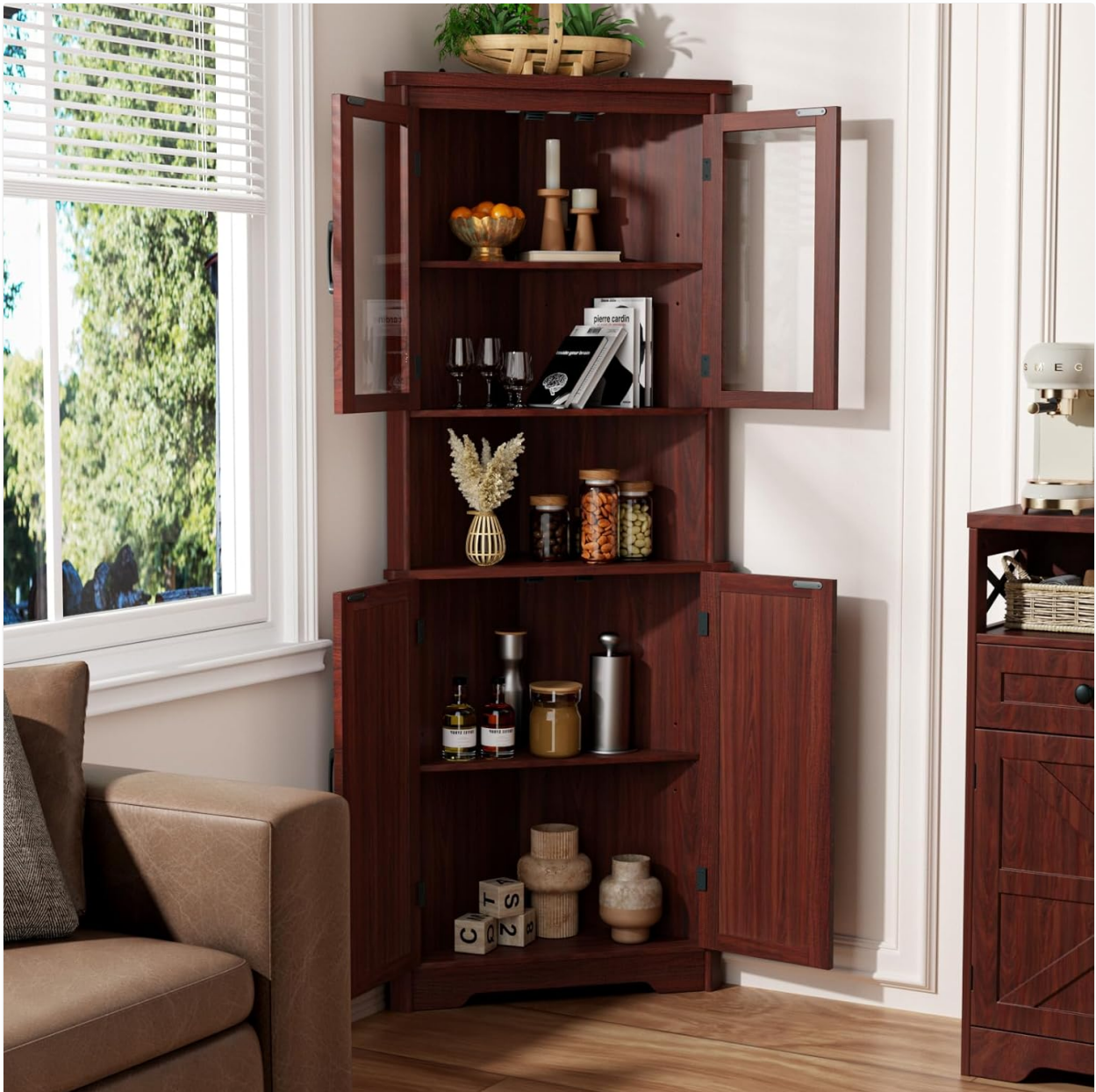
Figure 3: Open Cabinet View. This image shows the interior of the cabinet with all doors open, demonstrating the adjustable shelves and potential storage configurations.