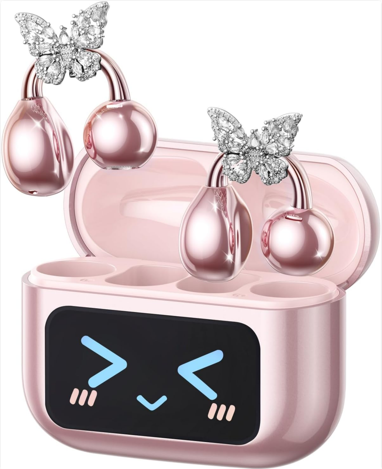
Image Description: The PAXA M100 Open Ear Clip-On Earbuds, presented in a rose gold finish, are shown within their charging case. The case features an LCD touch screen. Each earbud is adorned with a removable butterfly-shaped earring, highlighting the product's unique design.