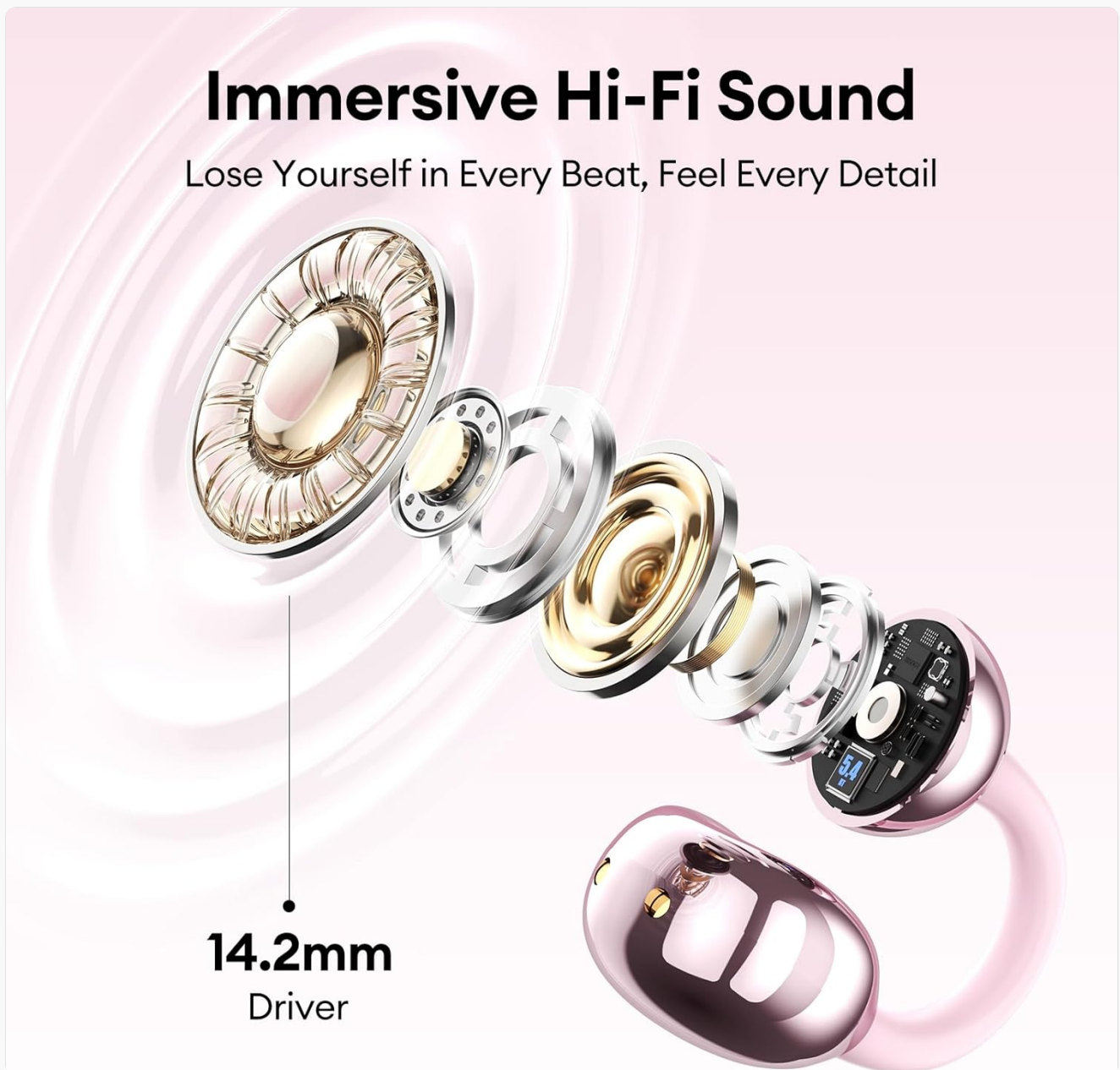
Image Description: This image provides an exploded view of the 14.2mm dynamic driver found in the PAXA M100 earbuds. It visually represents the internal components responsible for delivering high-fidelity audio, emphasizing sound clarity and depth.