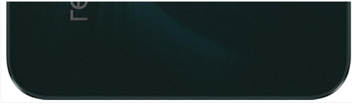
Image: Rear view of the realme C75, highlighting the triple camera setup with the 50MP AI Camera.