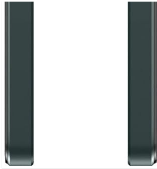
Image: Side view of the realme C75, highlighting the SIM card tray and physical buttons.