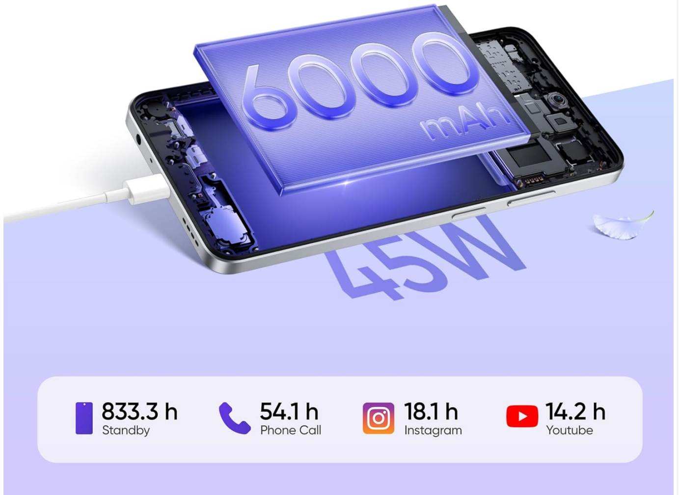
Image: Visual representation of the realme C75 charging, emphasizing its 6000mAh battery and 45W fast charging capability.