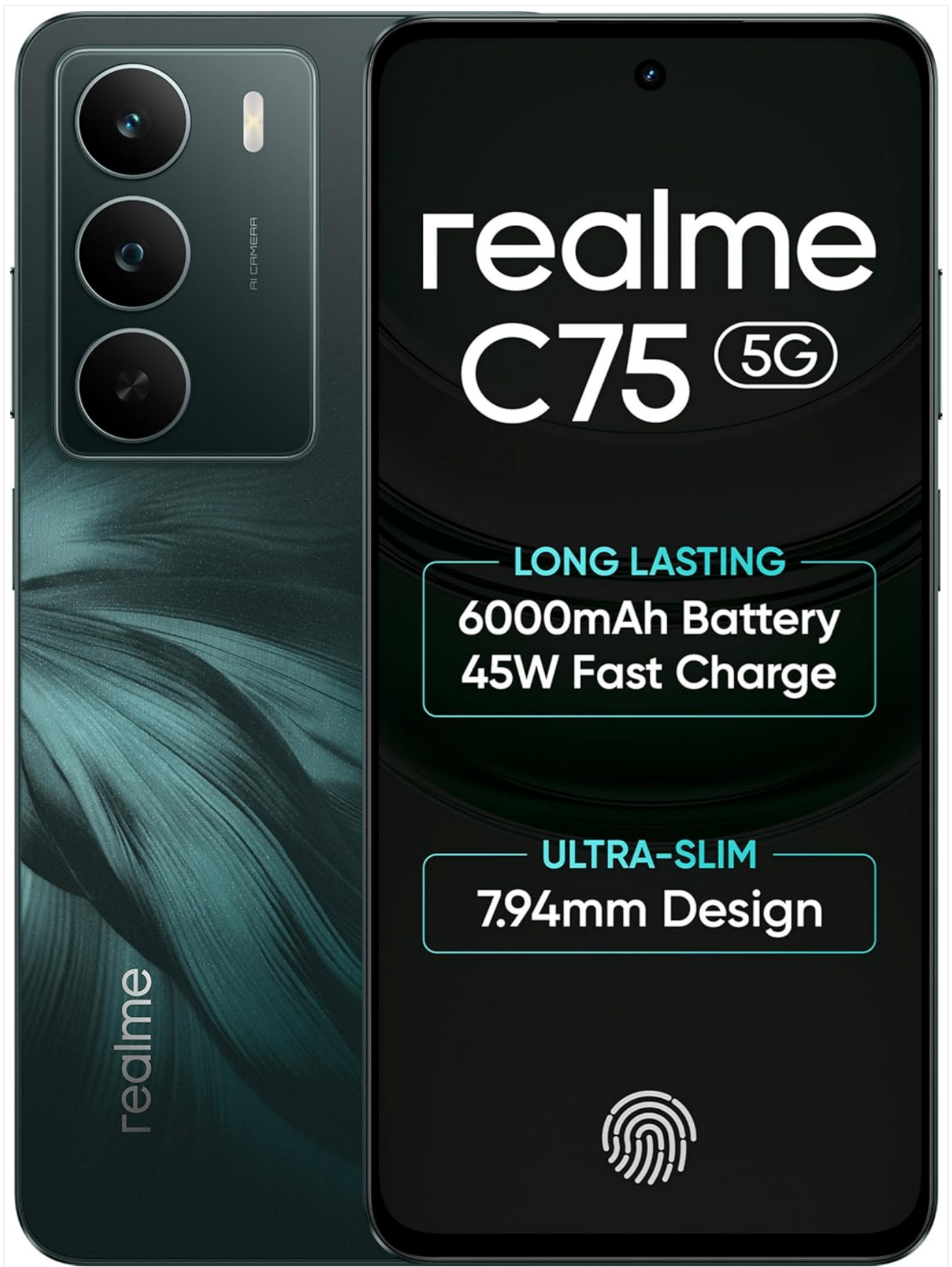
Image: Front view of the realme C75 smartphone, showcasing its display and sleek design.