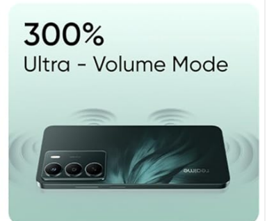
Image: Infographic summarizing key specifications and features of the realme C75, such as battery, design, RAM, and processor.