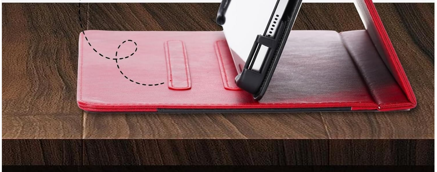
Figure 3: Detail of the anti-slip stripe, which helps secure the tablet in various viewing positions.