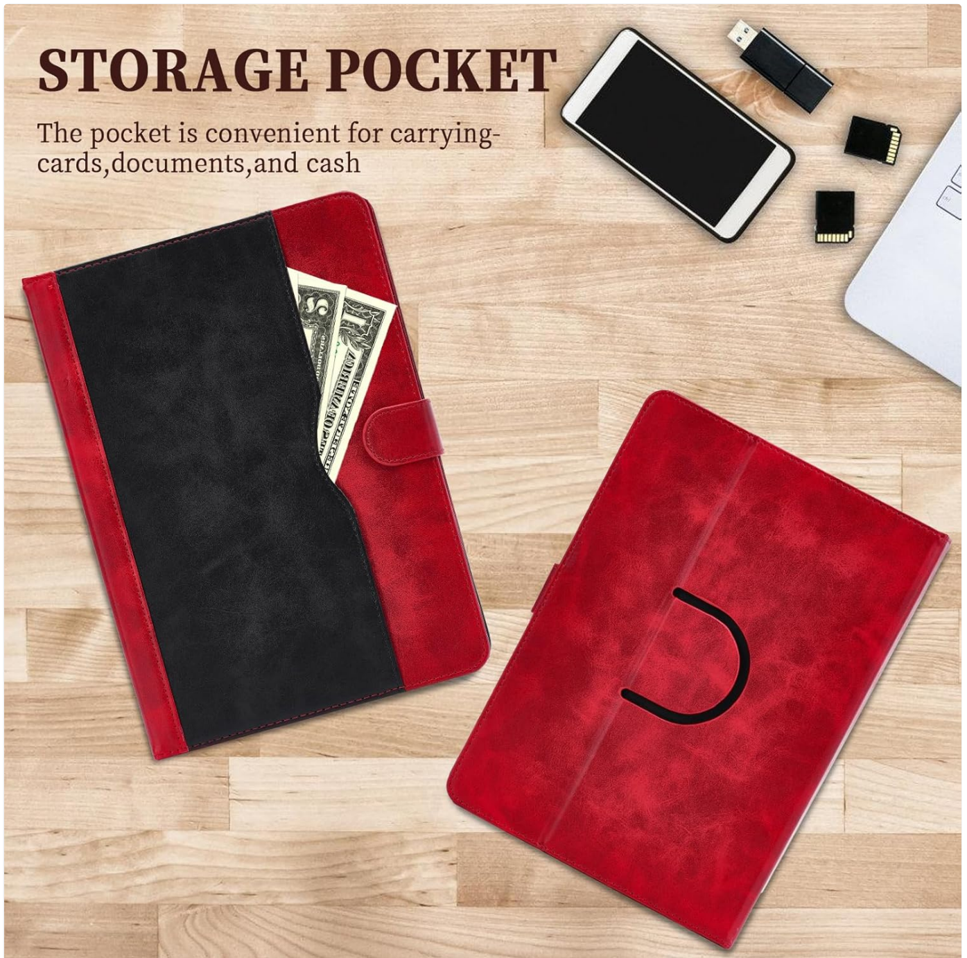
Figure 5: The integrated storage pocket, providing a convenient space for small documents or cards.

The pocket is convenient for carrying cards, documents, and cash