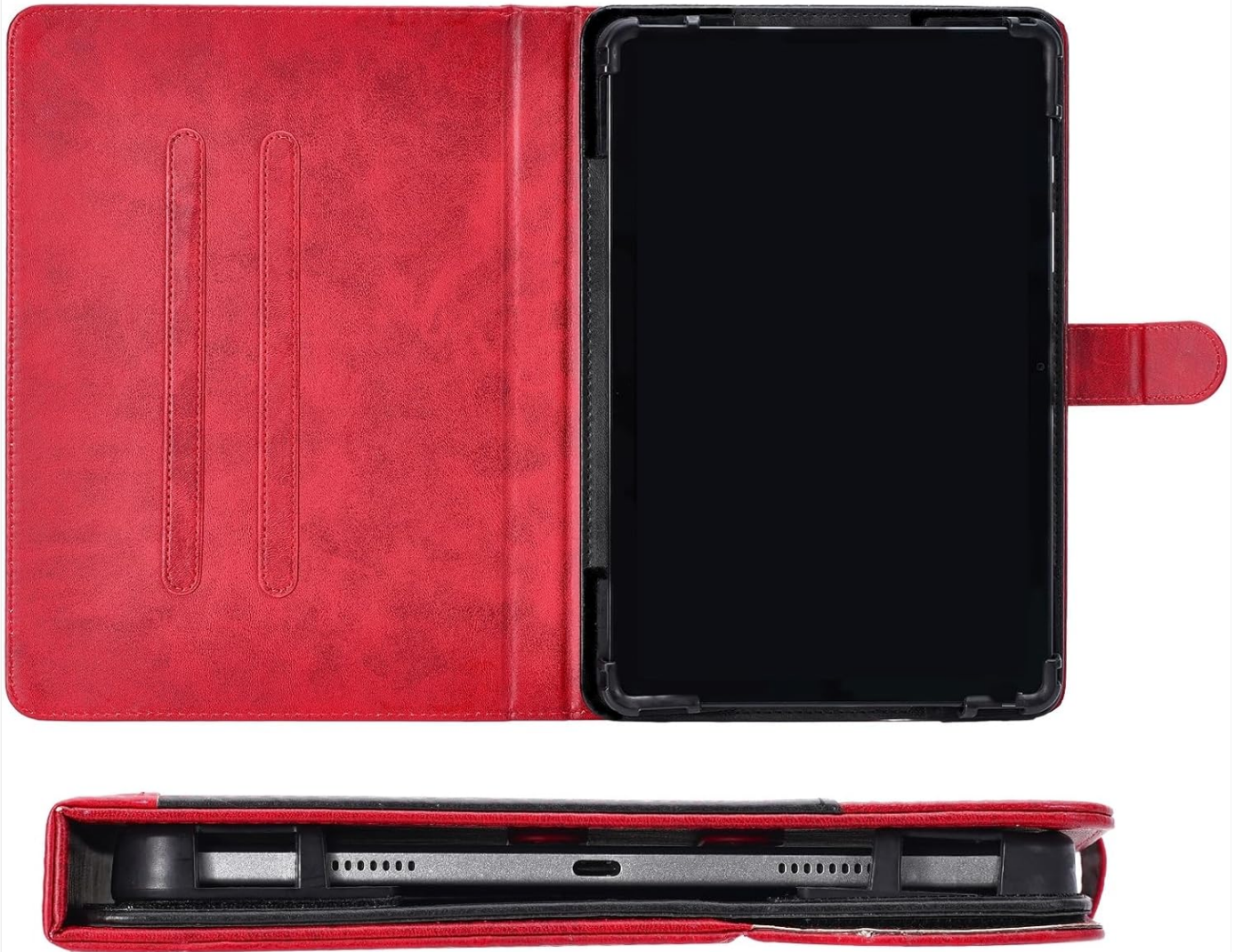
Figure 6: Demonstrates the proper way to insert the tablet into the case, ensuring a secure and compatible fit.

Please kindly check your tablet size before purchase as shown