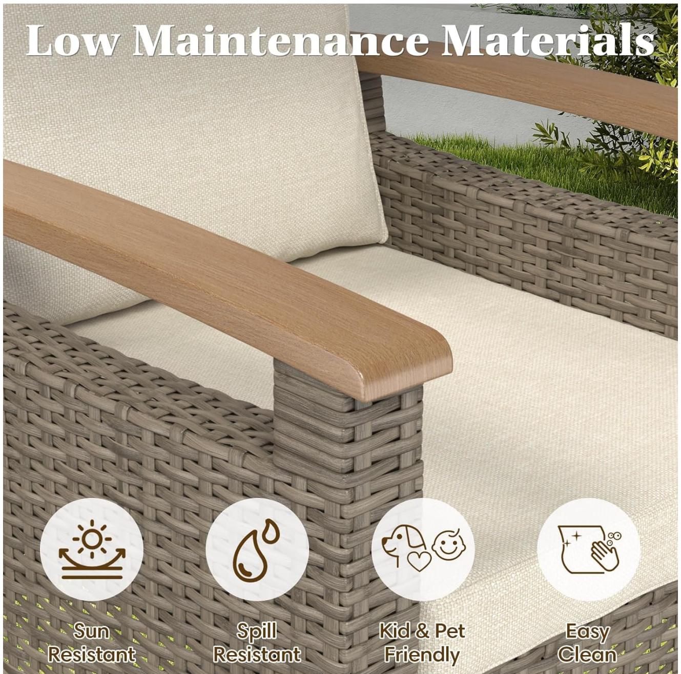
Image 4: Features of the low-maintenance materials, including sun and spill resistance.