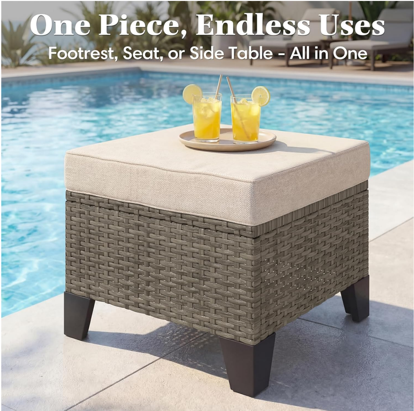
Image 3: The versatile ottoman, usable as a footrest, seat, or side table.