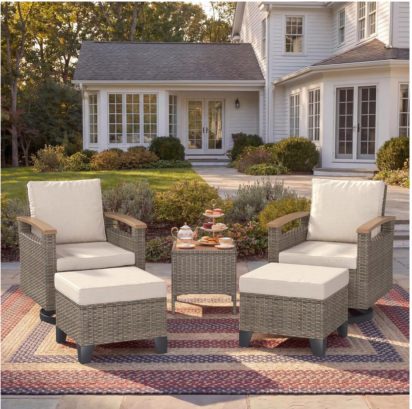
Image 1: The complete MELLCOM 5-Piece Outdoor Patio Furniture Set.