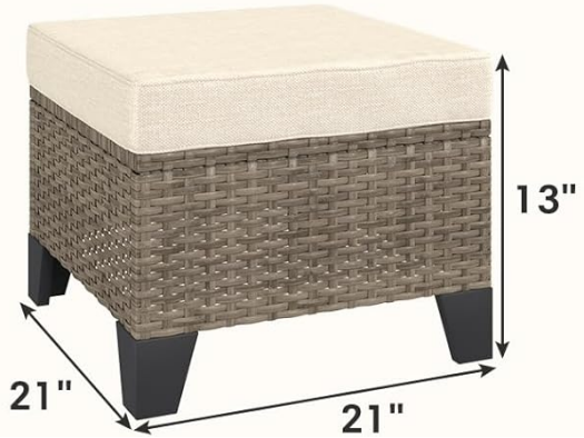
Image 5: Detailed dimensions for the chair, side table, and ottoman.