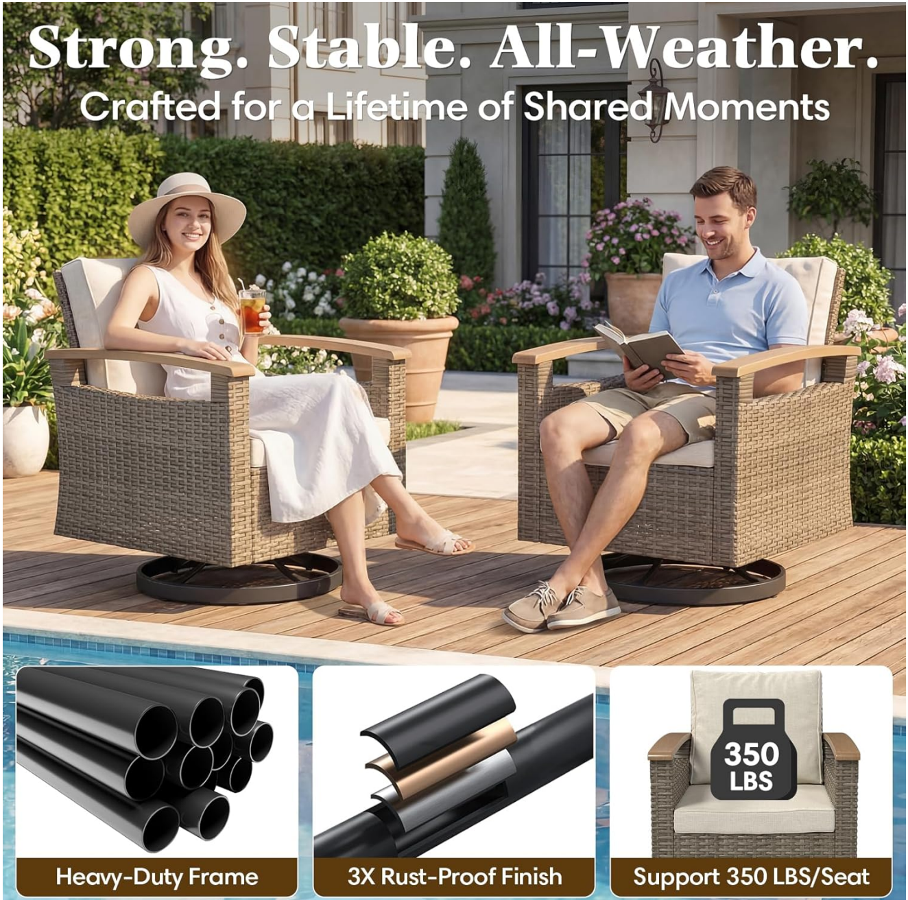
Image 2: Illustration of the chair's robust frame and weight capacity.