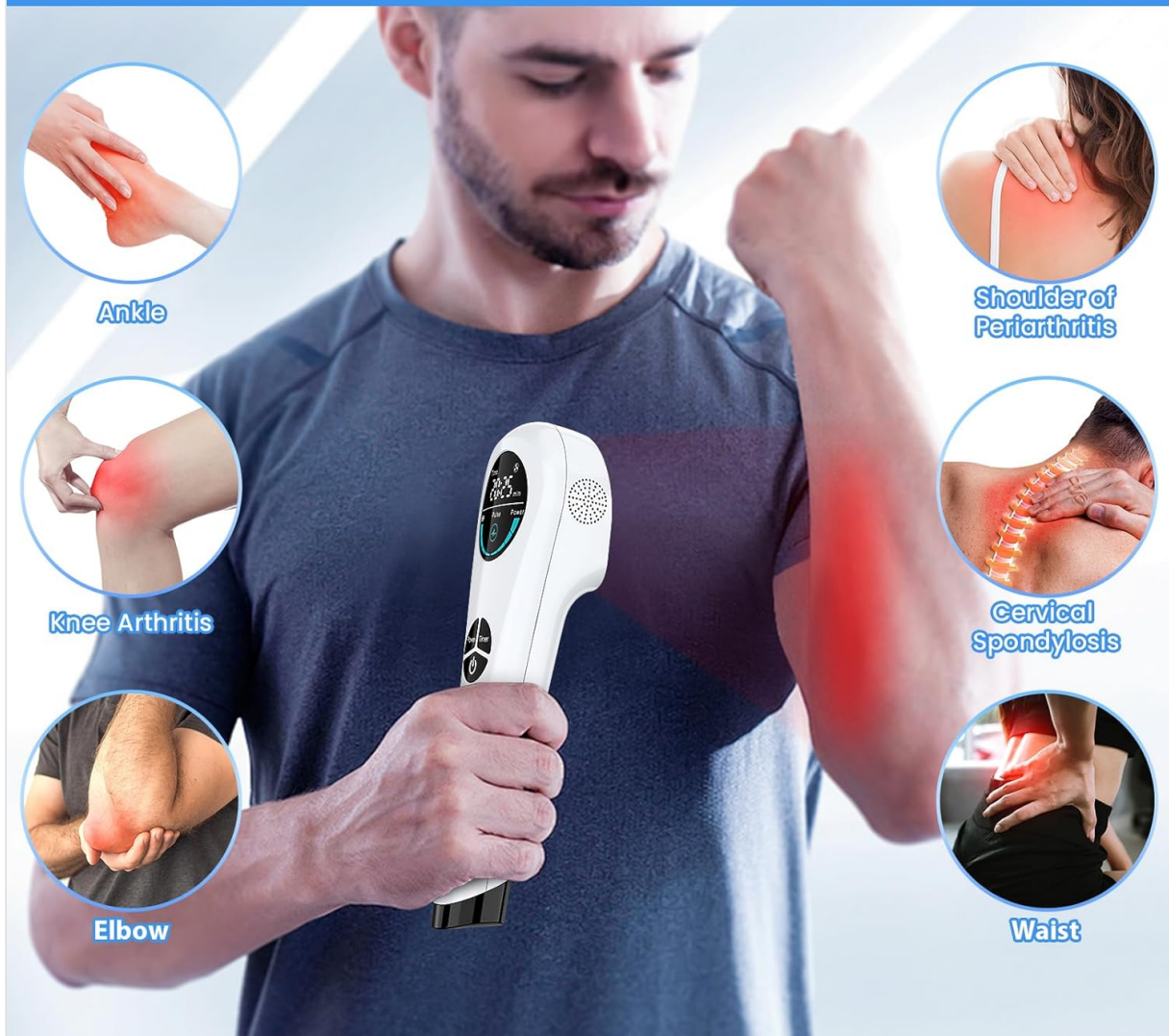
Image 6.2.1: Examples of human application areas for pain relief, including ankle, knee, elbow, shoulder, neck, and waist.

Natural Healing & Non-invasive Treatment & No Cross Infection