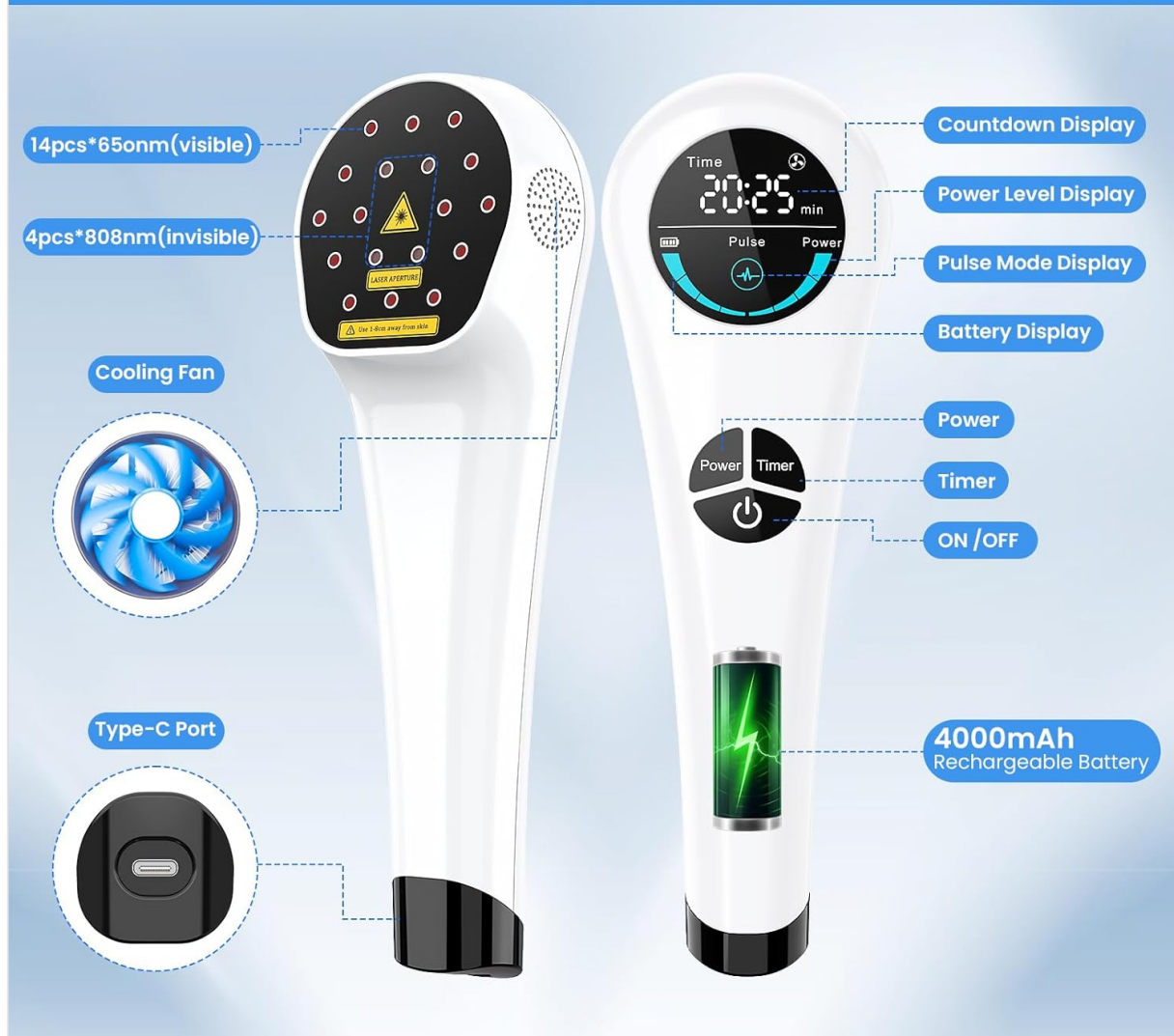
Image 3.3.1: Detailed view of the device's control panel and key components.

Improve Performance and Extend Service Life