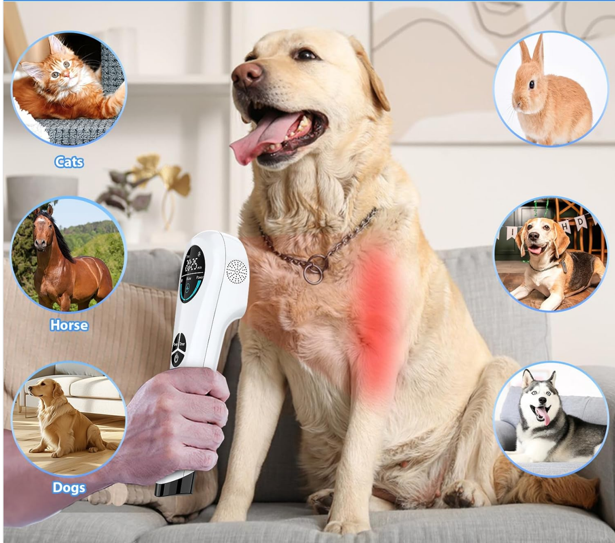
Image 6.3.1: The device being used on a dog, illustrating its application for pets.

No Adverse Effects, No Drug, Safe, Easy to Use