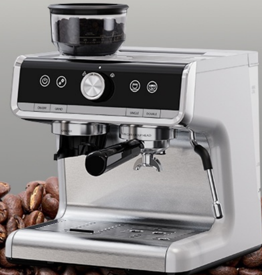
Image: The Vossfamul EM-200 Espresso Machine, showcasing its main components and functionality.