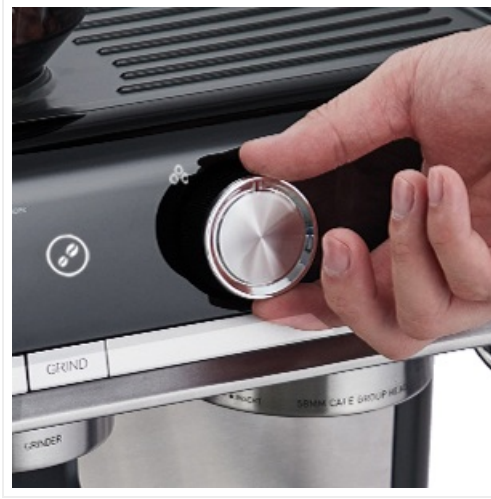
Image: Adjusting the grind size using the control knob.