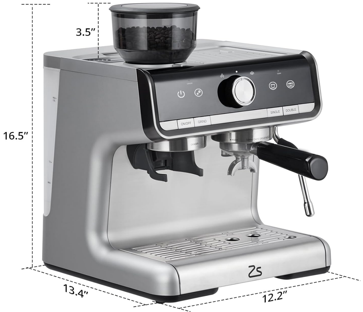
Image: Product dimensions for the Vossfamul Espresso Machine.