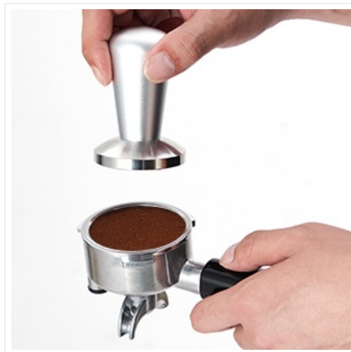
Image: Tamping coffee grounds in the portafilter.