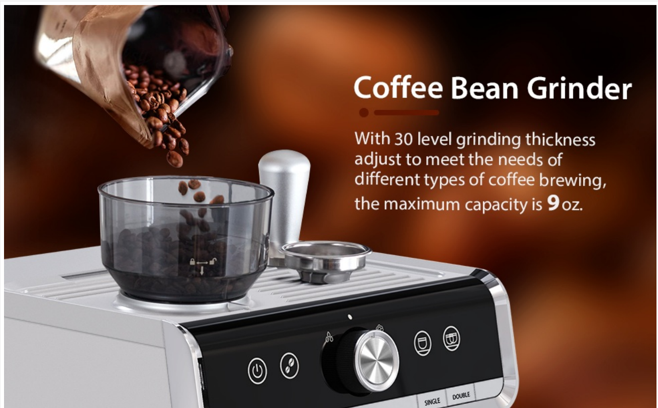
Image: The integrated conical burr grinder with 30 adjustable grind levels.