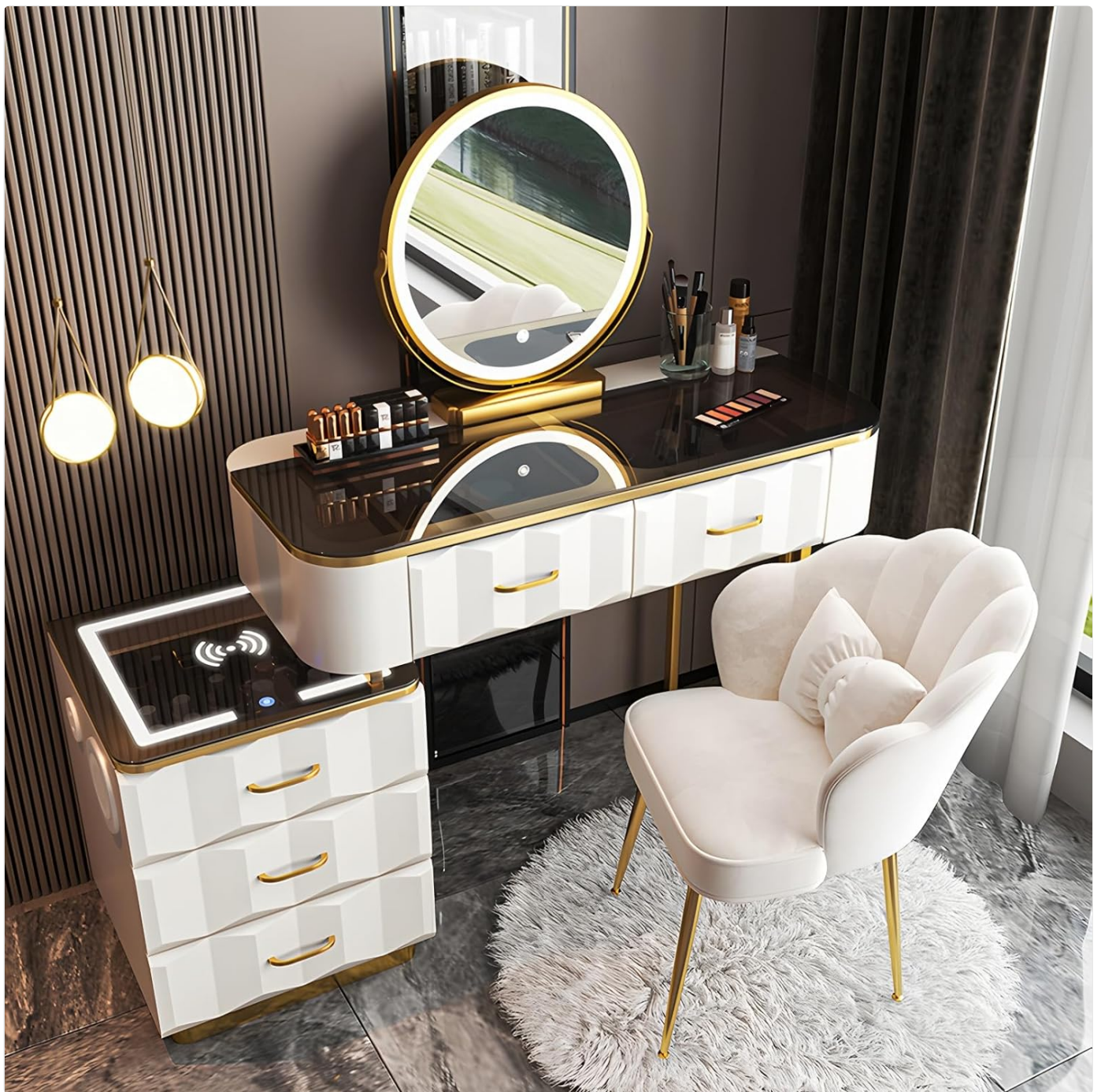
Figure 1: Complete LUTHXAY Luxury Makeup Vanity Desk setup.

This image shows the complete LUTHXAY Luxury Makeup Vanity Desk setup, featuring the main desk with a black glass countertop, a circular LED smart mirror, a side cabinet with drawers, and a matching makeup chair. The overall design is modern and luxurious, in white with gold accents.