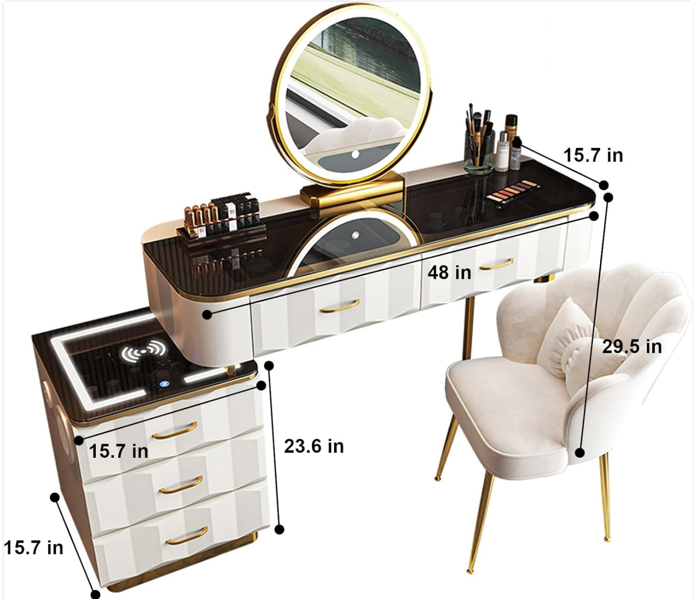
Figure 2: Product dimensions diagram.

This diagram illustrates the key dimensions of the vanity desk, side cabinet, and makeup chair, providing precise measurements for planning your space.