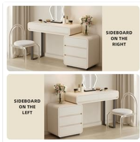
Figure 3: Side cabinet placement options.

This image illustrates the flexibility of the vanity desk's design, allowing the side cabinet to be positioned on either the left or right side of the main desk to best fit your space and needs.