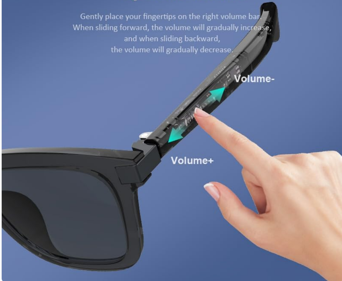
Image: Visual instruction for adjusting volume on the glasses.

Gently place your fingertips on the right volume bar. When sliding forward, the volume will gradually increase, and when sliding backward, the volume will gradually decrease.