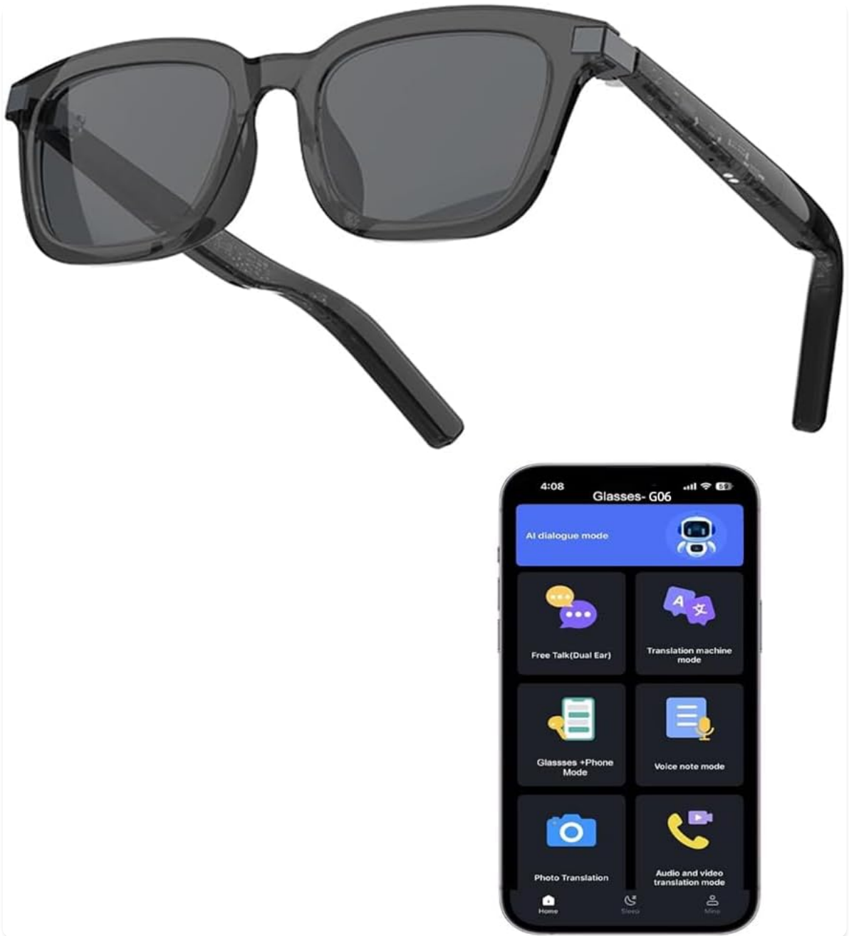
Image: VR SHINECON AI Translation Glasses alongside the Ear Dance app interface on a smartphone.