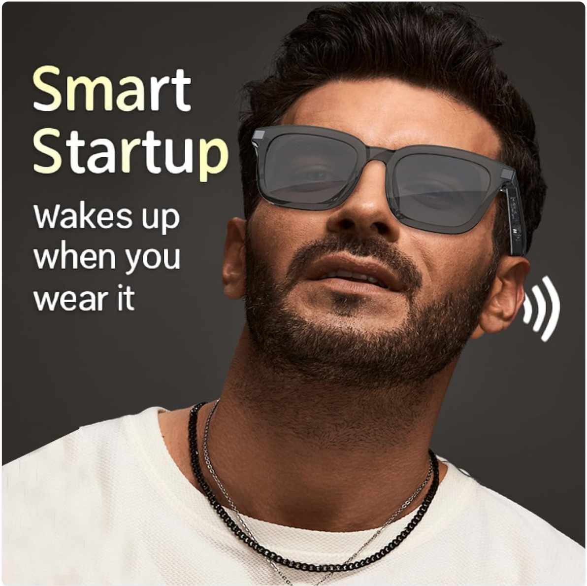
Image: Smart Startup feature, indicating automatic power-on when worn.