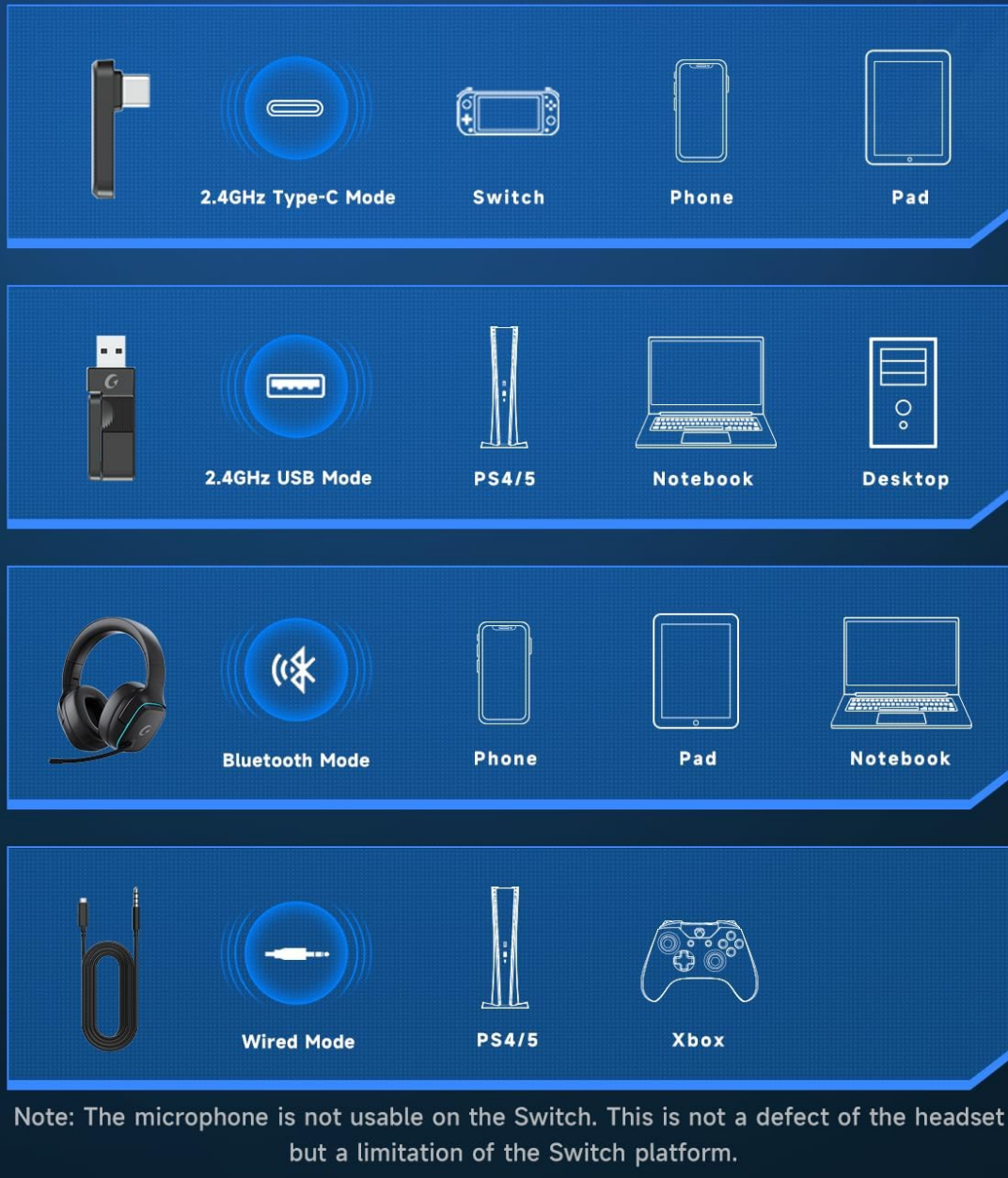
Figure 2: Headset and included accessories