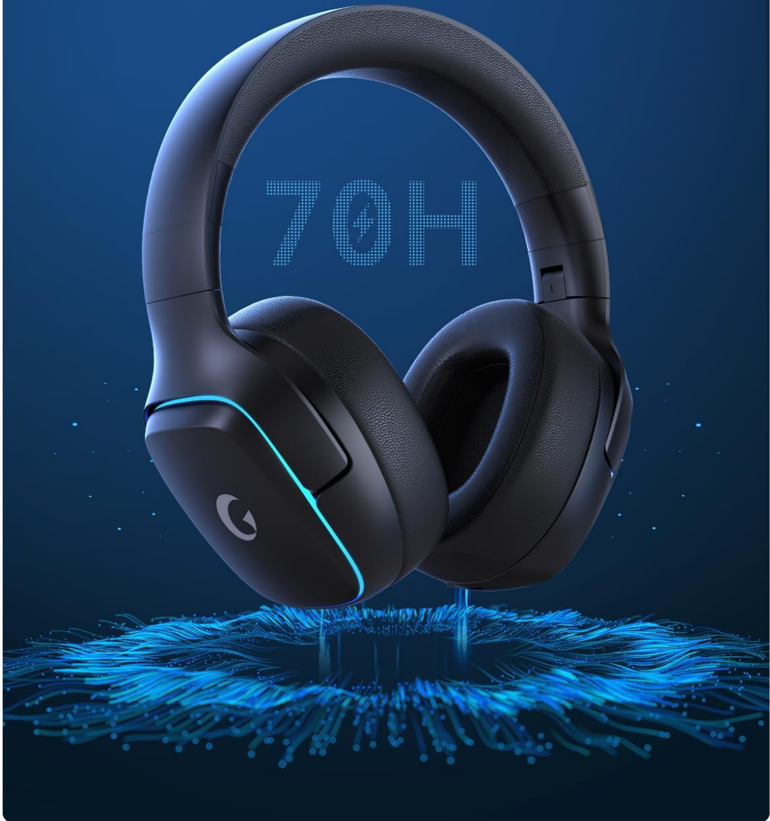
Figure 7: 70-Hour Battery Life

1200mAh Large Capacity Battery for Non-Stop Play