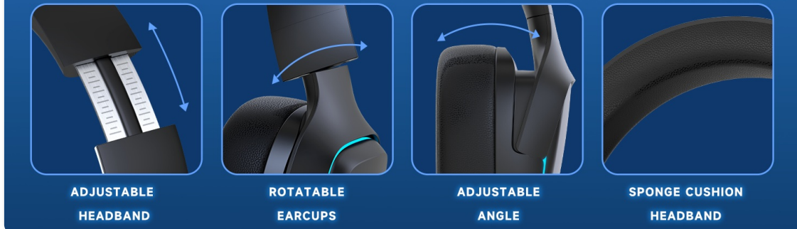
Figure 5: Headset Control Layout