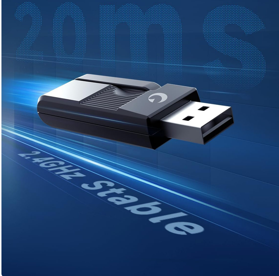
Figure 3: 2.4GHz USB Wireless Dongle