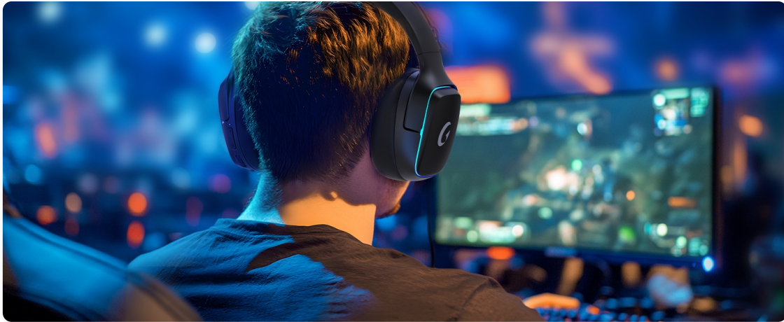
Figure 4: 4-in-1 Connection Compatibility