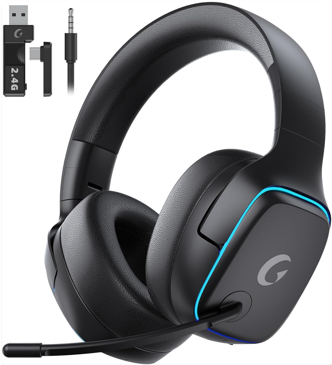
Figure 1: Gvyugke Captain 780 Wireless Gaming Headset