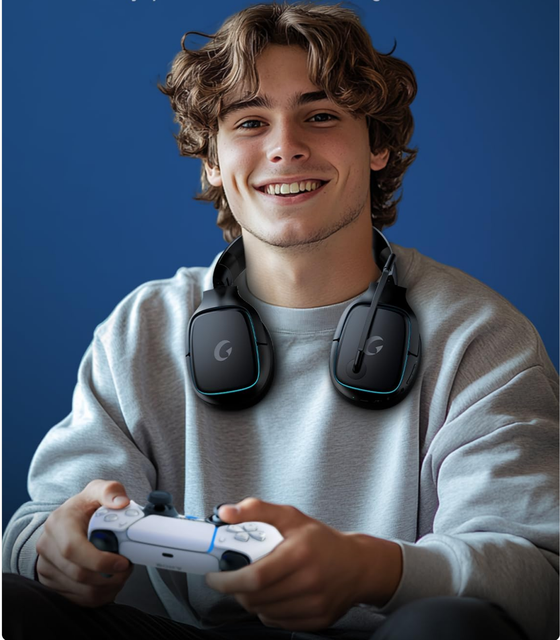
Figure 8: Foldable Design for Storage