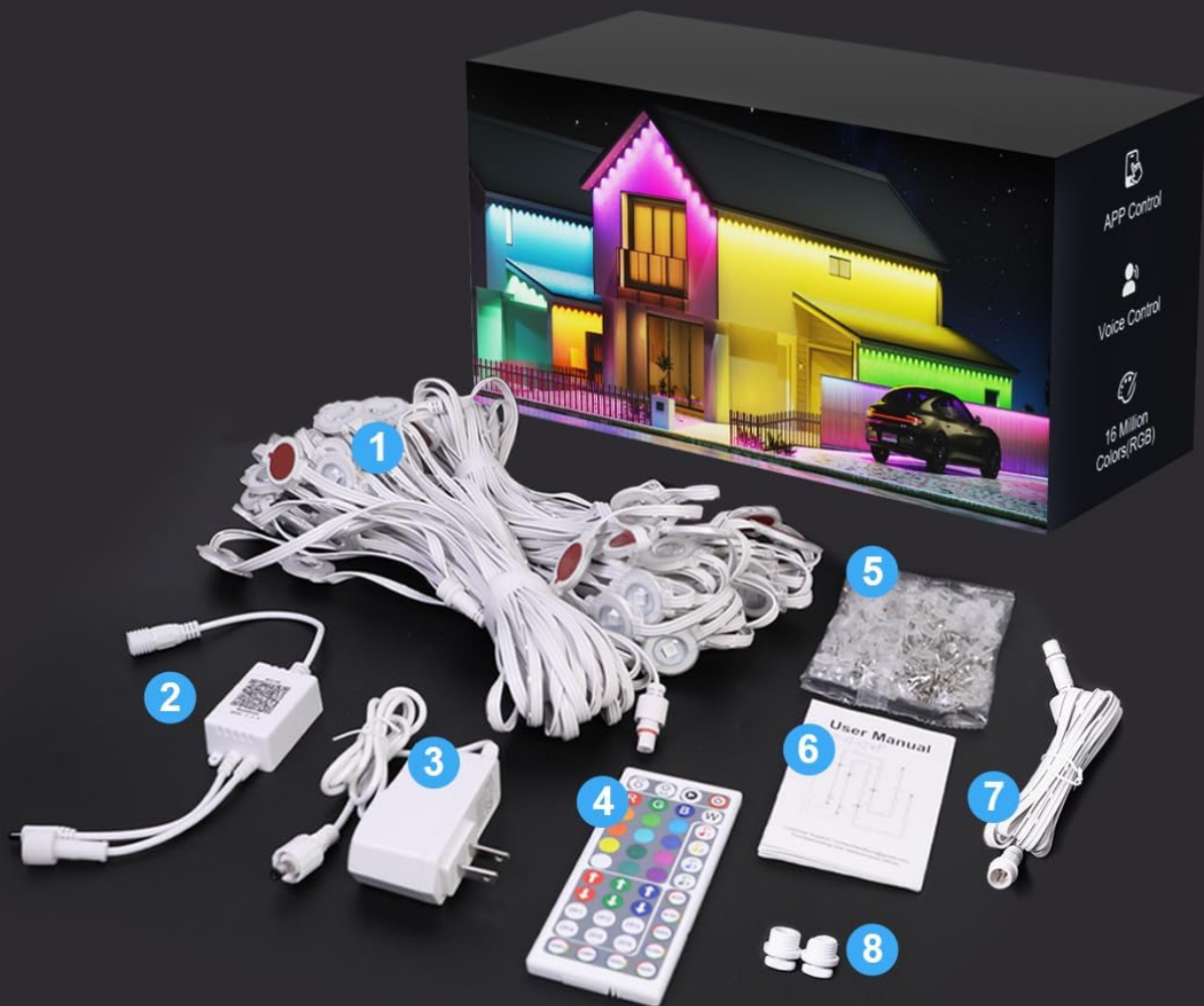
Image: An exploded view of the Nexillumi Permanent Outdoor Lights 100ft package contents, including two 50ft light strips, control box, power adapter, remote control, screw mounting kit, extension cable, and user manual.