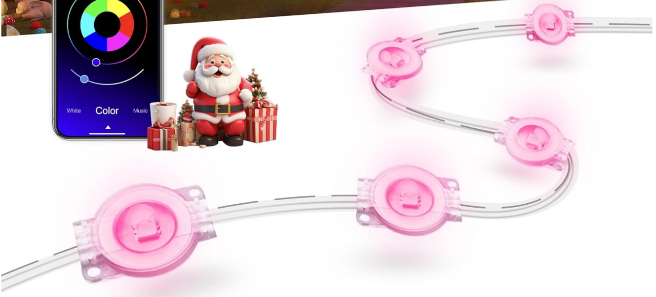
Image: Nexillumi Permanent Outdoor Lights installed on a house, displaying vibrant pink and yellow illumination, controlled via a smartphone app.