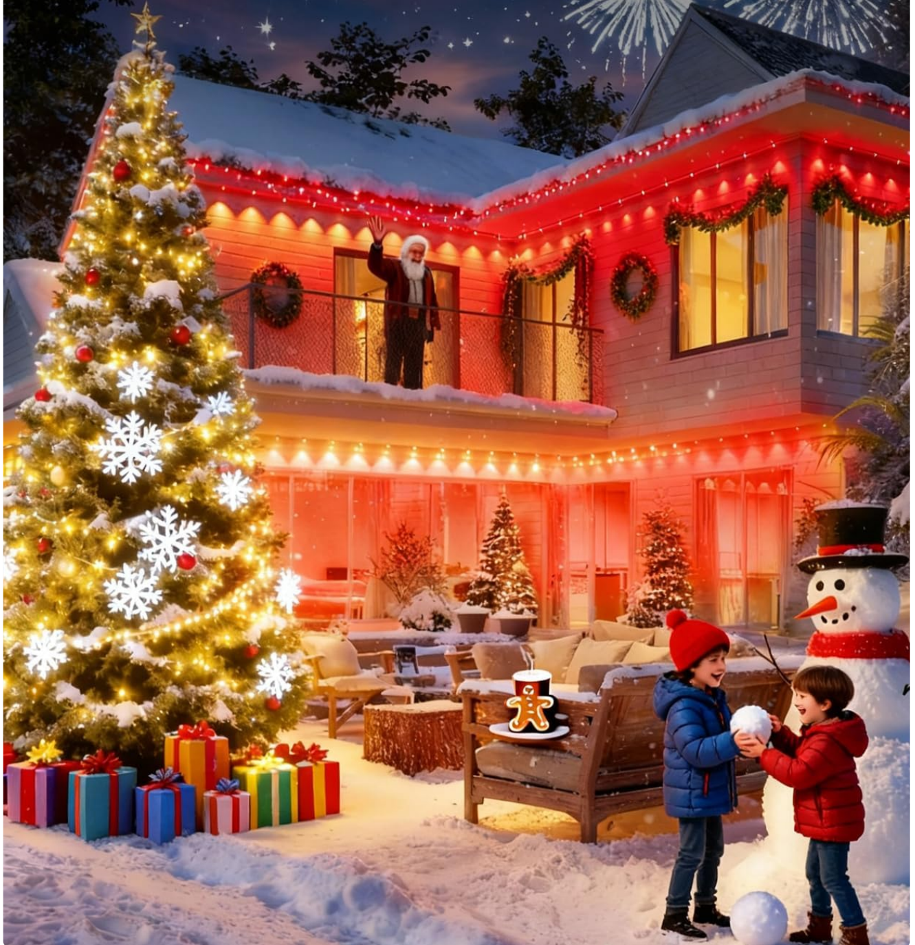
Image: A house adorned with red Nexillumi Permanent Outdoor Lights, creating a festive Christmas atmosphere with a decorated tree and snowman.

Make this Christmas absolutely spectacular!