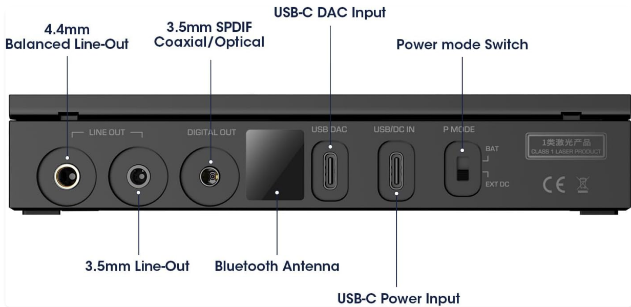
Image 3.4: Rear panel of the Shanling EC Zero T, showing various input and output ports.