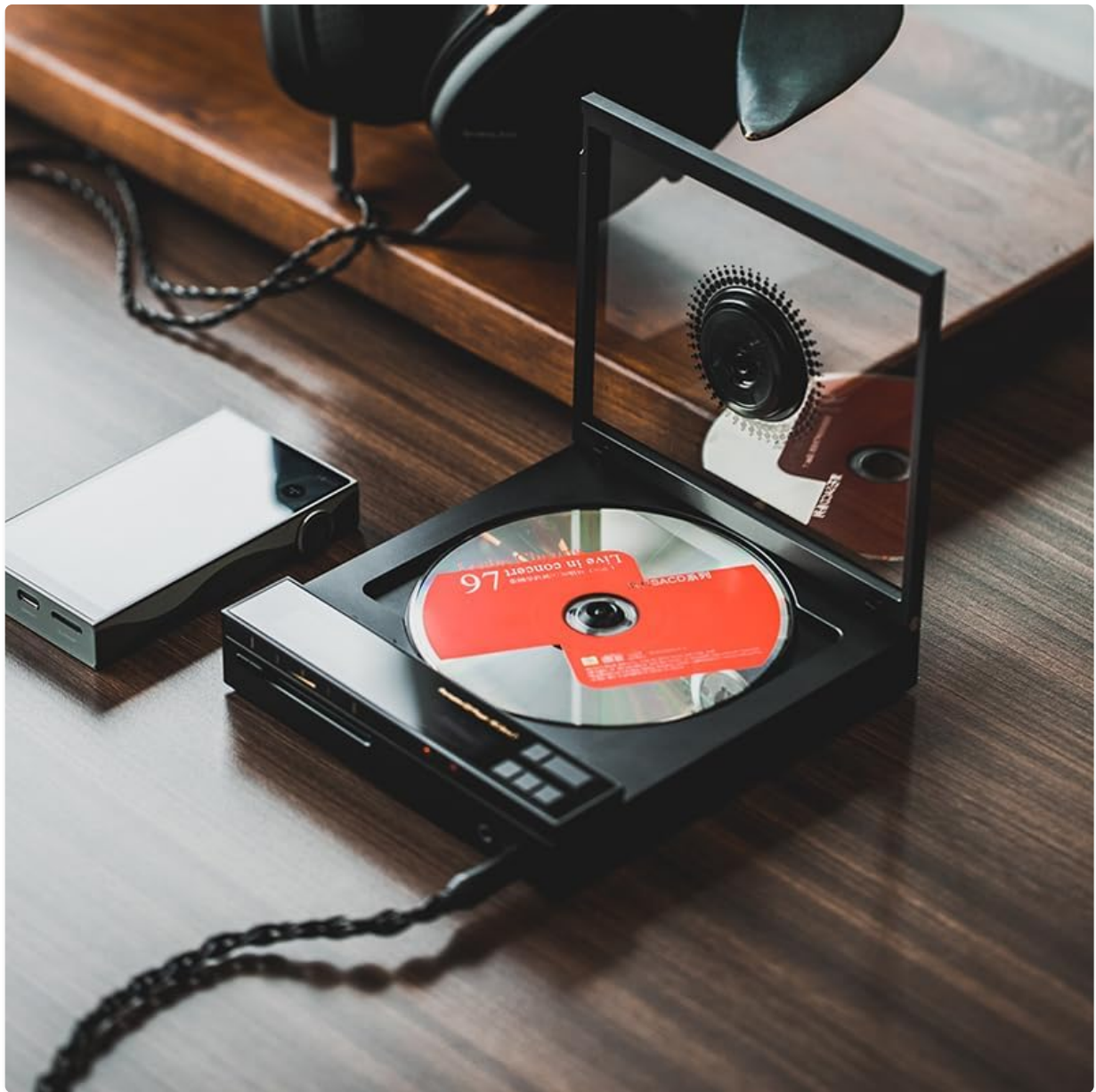
Image 5.1: The EC Zero T in operation, playing a CD with headphones connected.