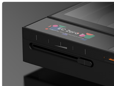
Image 3.2: Detailed view of the sliding potentiometer for volume control.