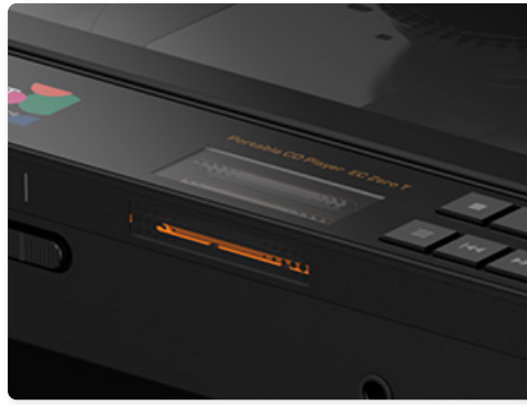
Image 3.3: Close-up of the transparent visual tubes, indicating real-time operation.