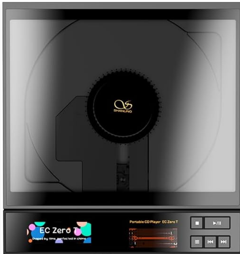
Image 1.1: Front view of the Shanling EC Zero T Portable CD Player, showcasing its screen and control buttons.