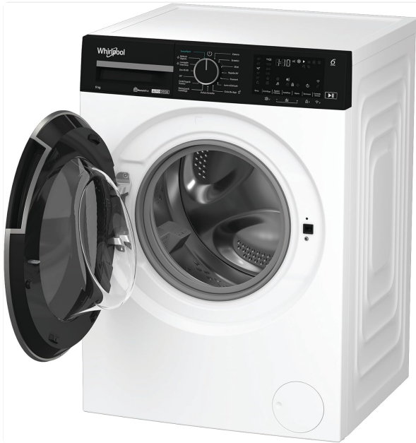
Figure 1: Front view of the Whirlpool WPM 97W ADS IT washing machine with the loading door open, showing the drum interior and control panel.