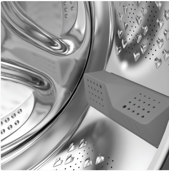
Figure 3: Detailed view of the washing machine's stainless steel drum interior, showing the paddles and water jets.