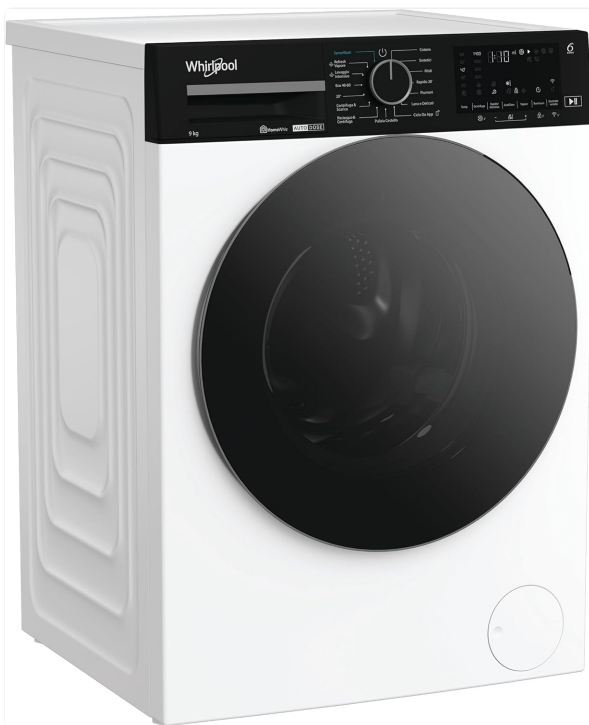
Figure 4: Front view of the Whirlpool WPM 97W ADS IT washing machine with the loading door closed, displaying its sleek design.