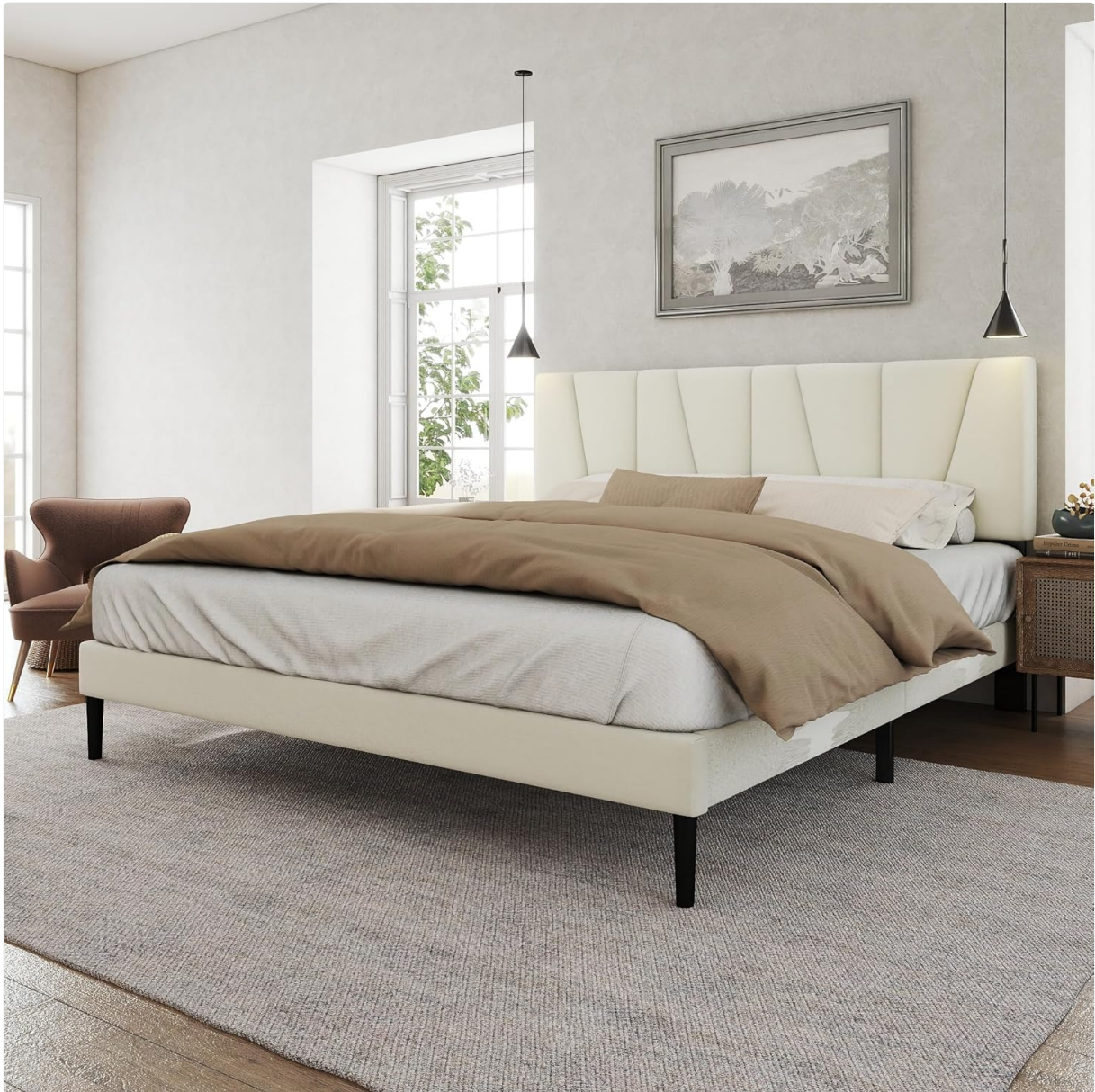
Figure 2.1: Overview of HAOARA Queen Size Bed Frame components and dimensions. The bed measures approximately 83.07 inches in length, 61.42 inches in width, and 41.34 inches in height. It has a weight capacity of 800 lbs and is designed for assembly in approximately 30 minutes.