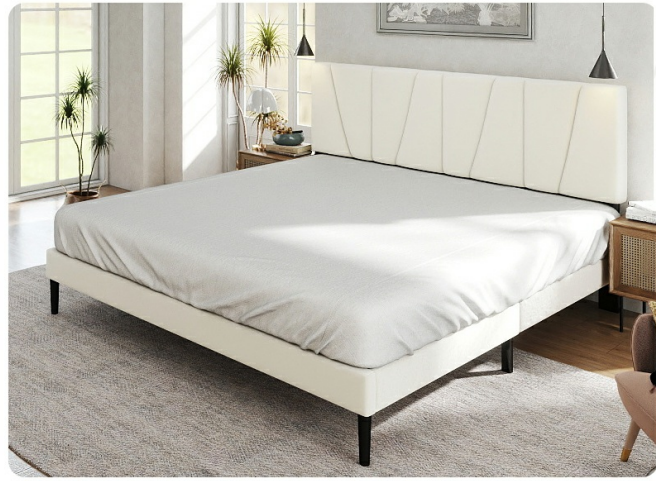
Figure 4.1: Mattress recommendations. A mattress alone should be 7-13 inches in height. If using a mattress with a box spring, the total height should also be 7-13 inches.

Mattress+Box Spring, 7"-13" Total Height