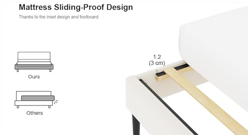
Figure 4.2: Illustration of the mattress sliding-proof design, showing how the inset frame and footboard secure the mattress.

The bed frame features an inset design and a footboard that helps prevent the mattress from sliding, ensuring it stays securely in place during use.