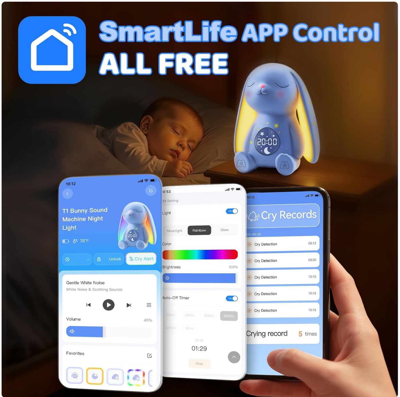
Image: A smartphone screen showing the Mewaii app, which allows remote control of the sound machine's settings, with a sleeping baby and the sound machine in the background.