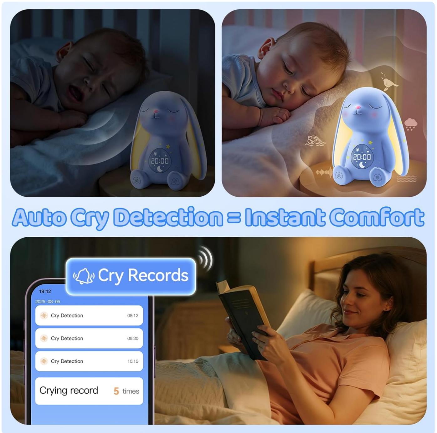
Image: A visual explanation of the cry detection system, showing a baby sleeping, the sound machine responding to a cry, and the corresponding cry alerts on a smartphone app.

alerts to your phone via the MeWaii App, providing a cry record log.