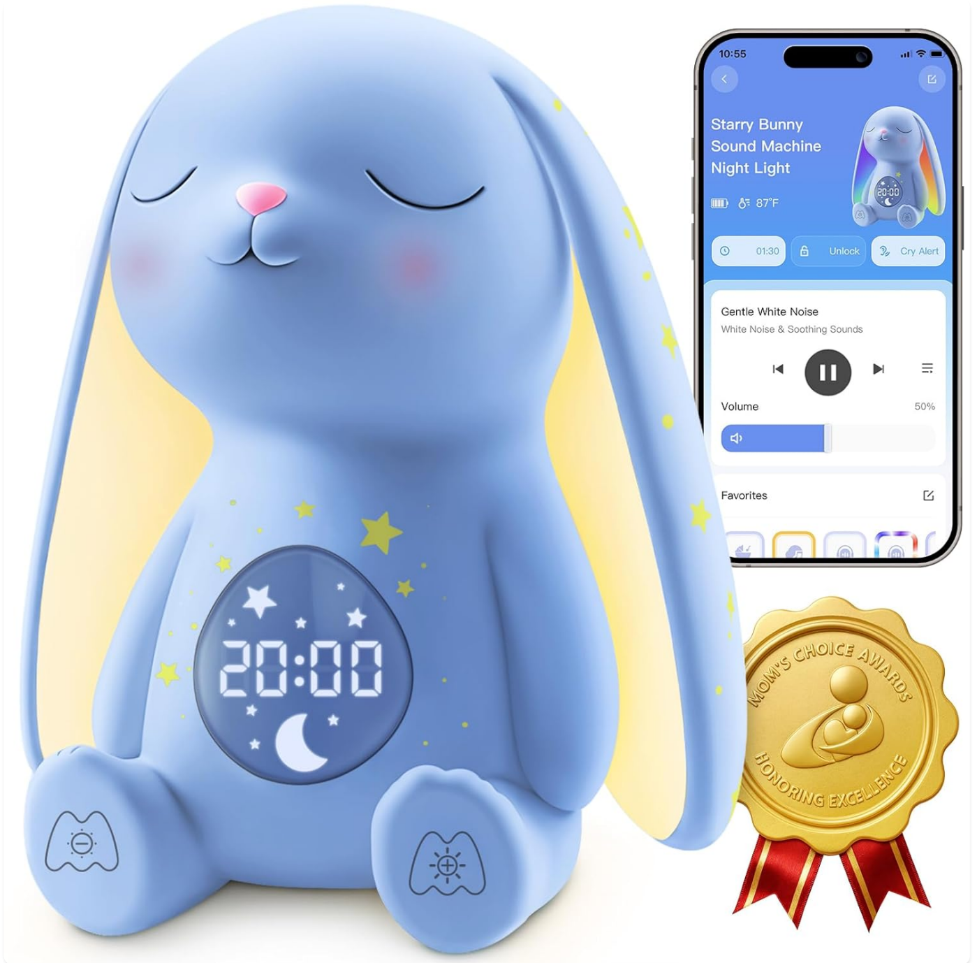
Image: The Mewaii White Noise Sound Machine, a blue bunny-shaped device, shown with its digital clock and glowing ears, alongside a smartphone displaying its control application.