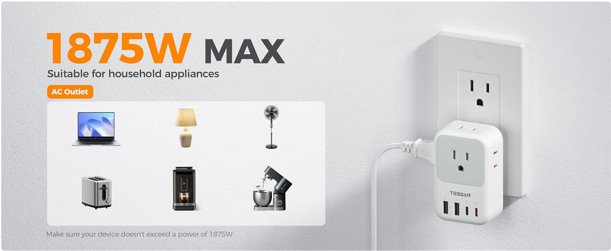
Image: The TESSAN USB Charger Block illustrating its capability to charge a variety of USB devices, including phones, tablets, smartwatches, and headphones, using both USB-C and USB-A ports.

Your browser does not support the video tag.