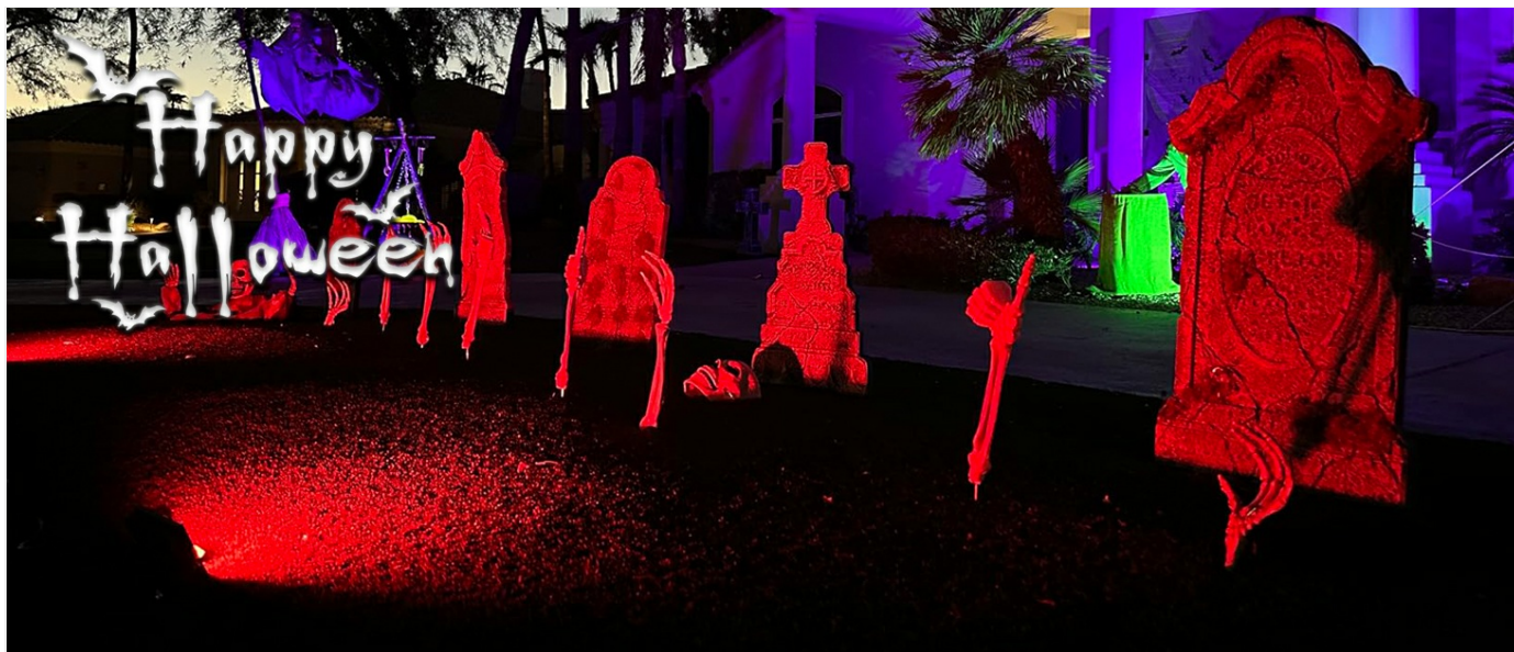
Image: Onforu LED Flood Lights providing vibrant illumination in an outdoor setting, showcasing their color-changing capabilities.

Thank you for choosing the Onforu I25BL LED Flood Light. This manual provides essential information for the safe and efficient use of your new lighting product. Please read these instructions carefully before installation and operation, and retain them for future reference.