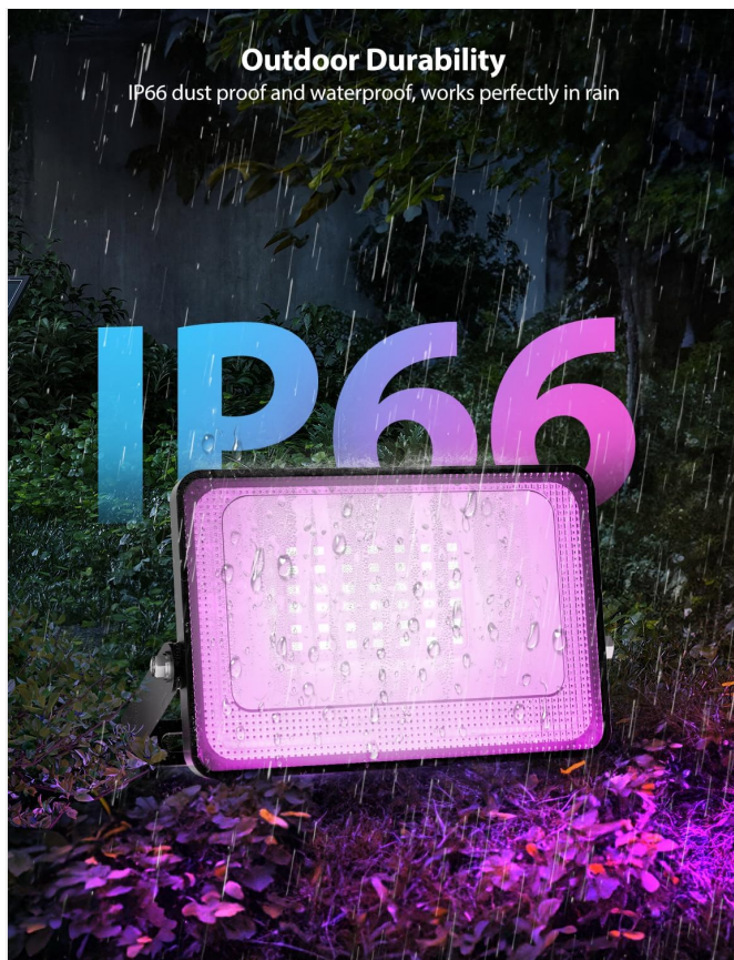
Image: The flood light with its adjustable bracket, demonstrating how it can be positioned for various lighting angles.