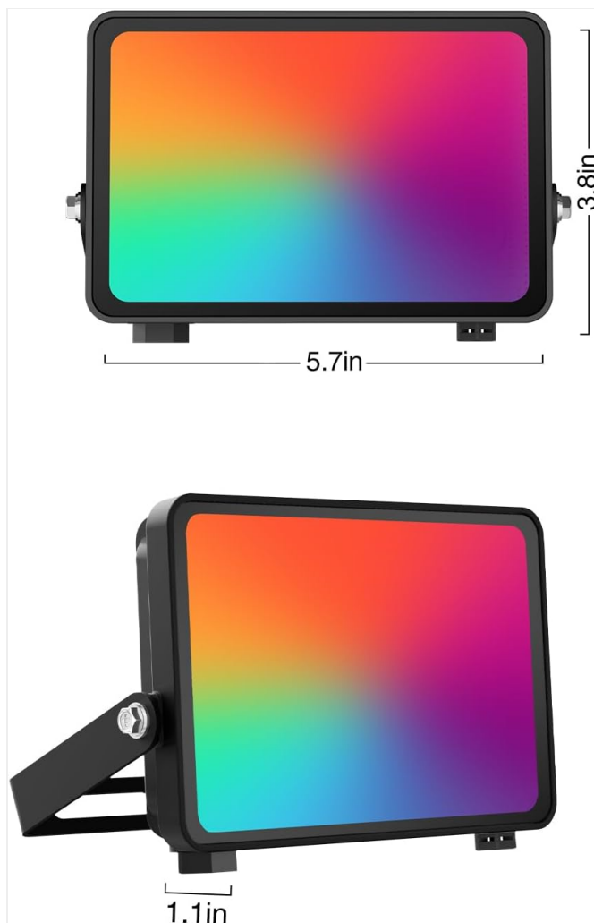
Image: Technical diagram illustrating the length, width, and height of the flood light in inches.