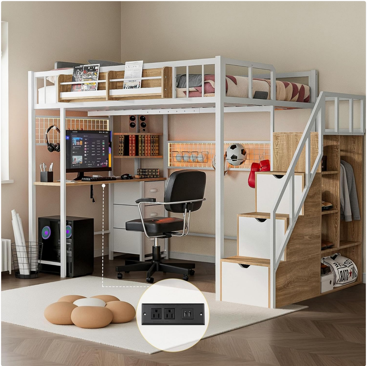
Figure 2.1: Overall view of the Kikihouse Full Size Loft Bed, showcasing the integrated desk, storage stairs, and bed frame.