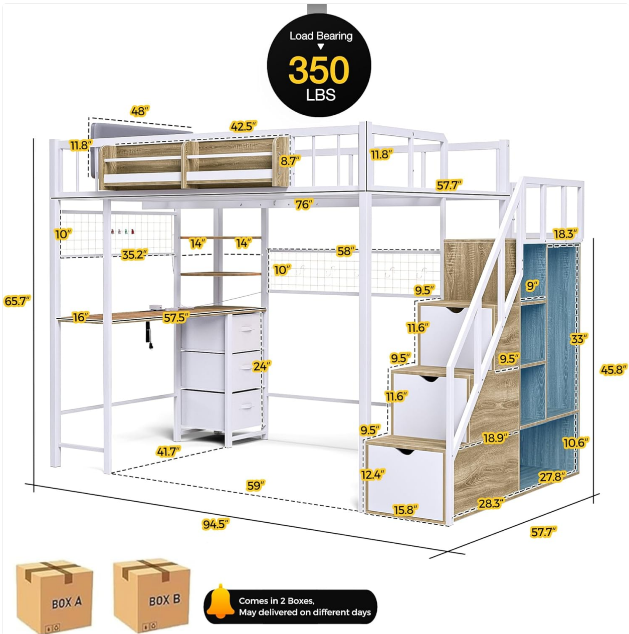
Figure 2.2: Detailed dimensions of the loft bed (95"L x 56"W x 66"H) and its 350 lbs weight capacity.