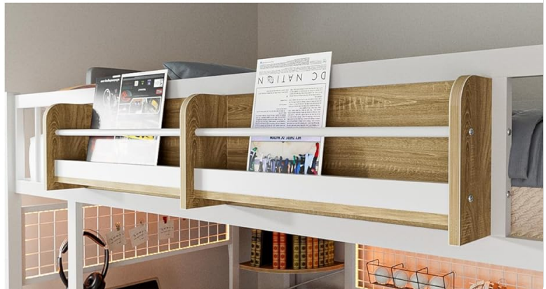
Figure 4.5: Details of the inclined stair for safer climbing, metal mesh panels for customization, and the bedside shelf.

Keeps essentials within reach for added convenience