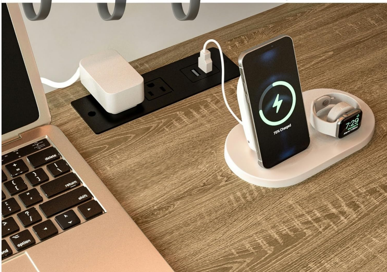
Figure 4.2: Close-up of the built-in charging station, providing convenient power access for electronic devices.