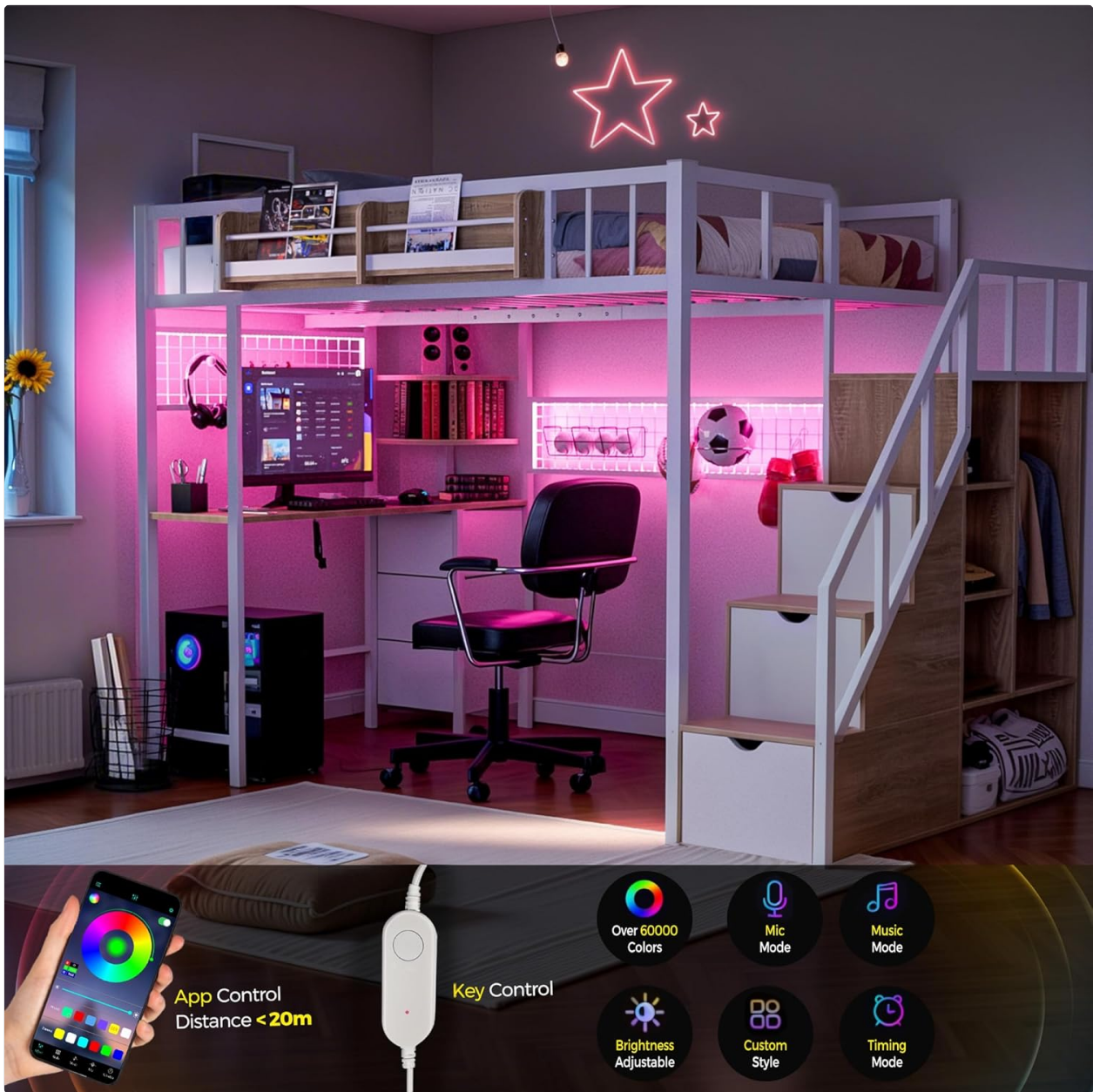
Figure 4.3: The LED lighting system in operation, showing various color options and control methods.