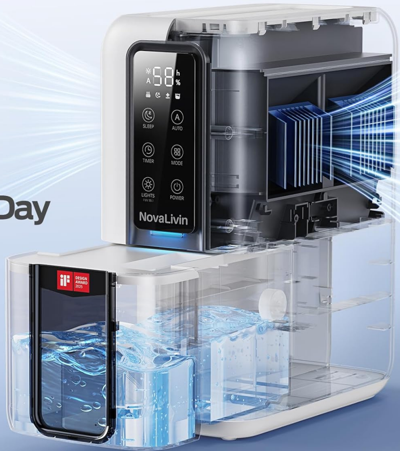
Figure 3: Dual semiconductor technology enables efficient moisture removal into the 68 oz water tank.