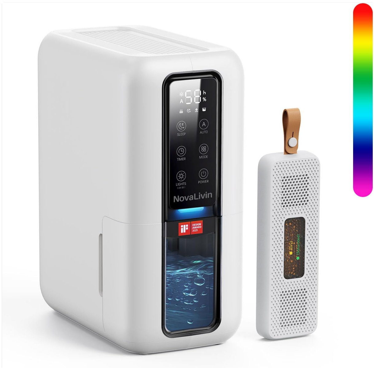
Figure 1: NovaLivin DH-CS19 Dehumidifier and included moisture absorber box.