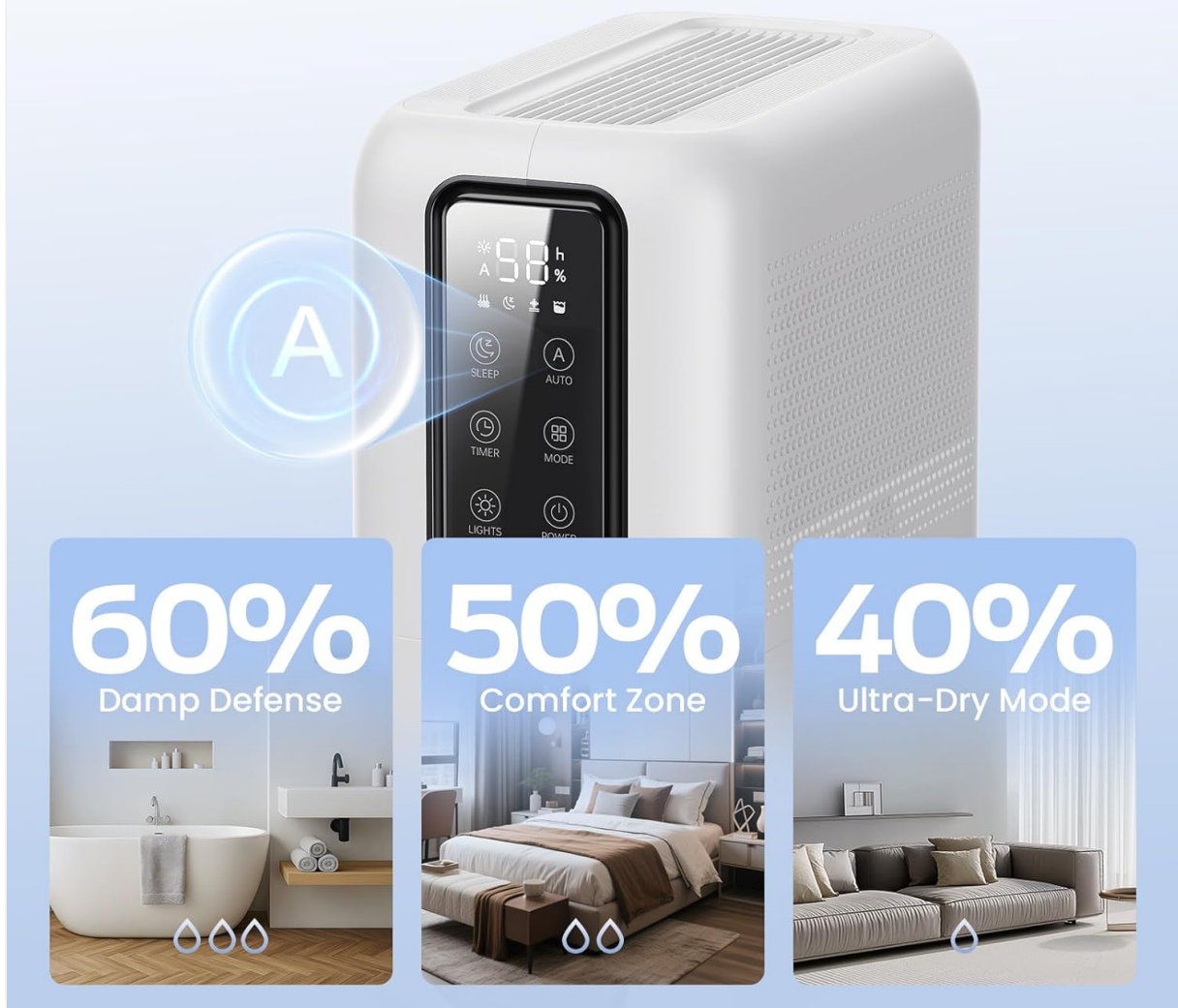
Figure 5: Smart humidity control settings on the dehumidifier's display.