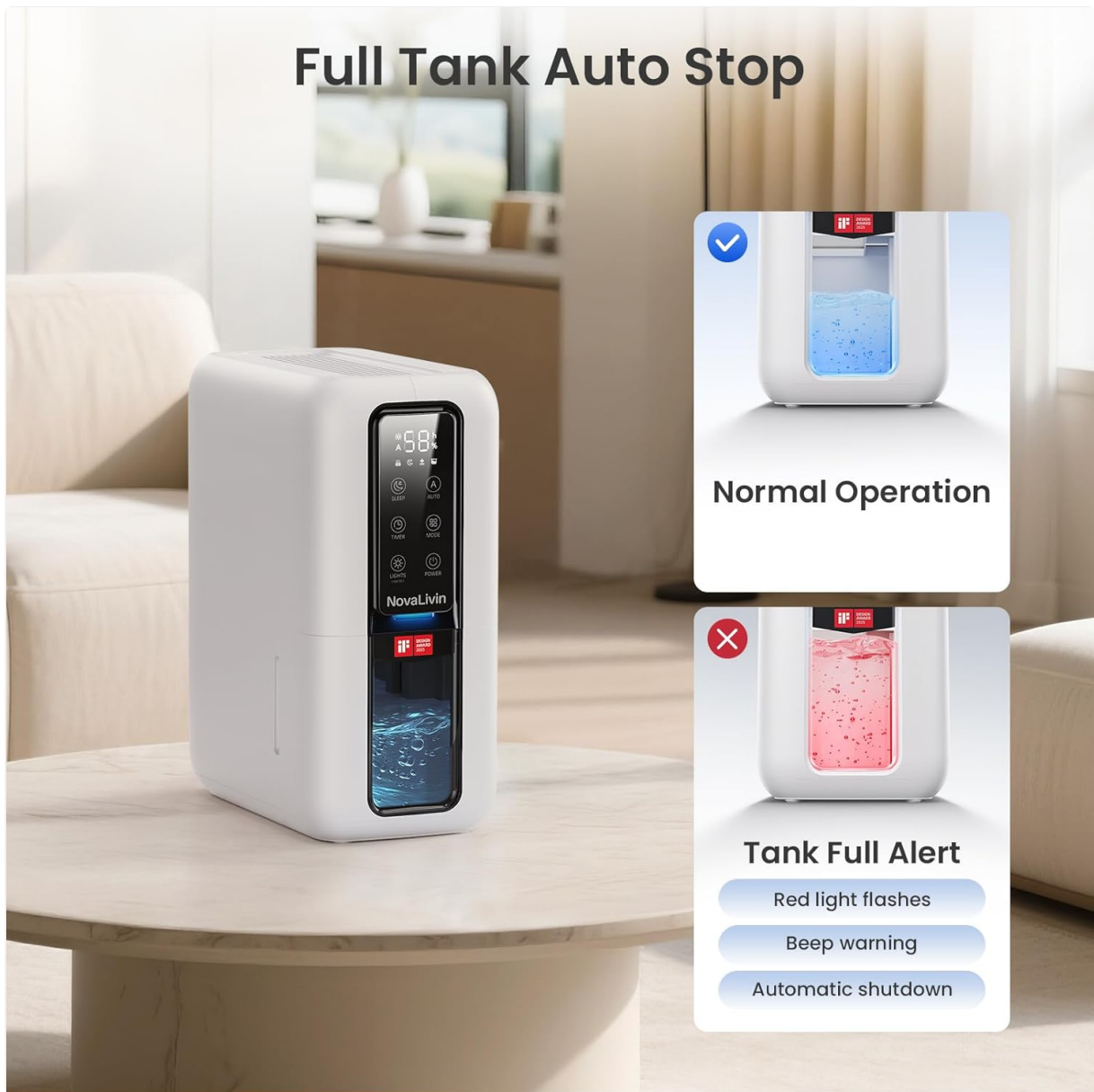
Figure 7: The dehumidifier's auto-shutoff feature prevents overflow when the tank is full.