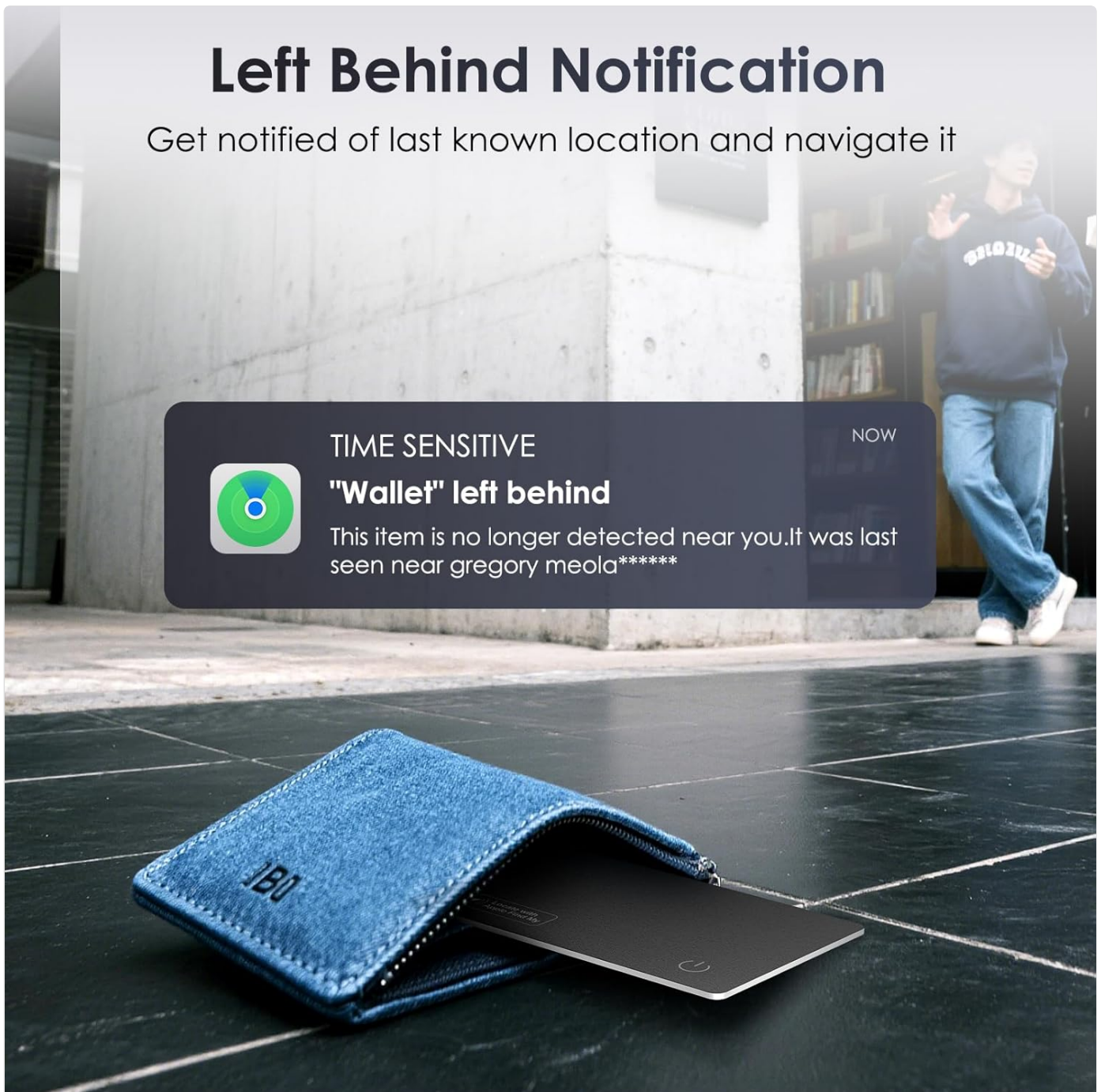
Figure 5: Left Behind Alert notification.

Get notified of last known location and navigate it