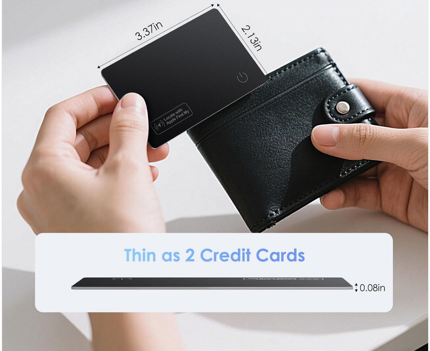
Figure 2: Ultra-slim design of the KINDEEP Wallet Tracker Card.

This image highlights the compact dimensions of the KINDEEP Wallet Tracker Card, showing it next to a black wallet. Annotations indicate its length (3.37in), width (2.13in), and thickness (0.08in), emphasizing that it is as thin as two credit cards, making it ideal for slim wallets.