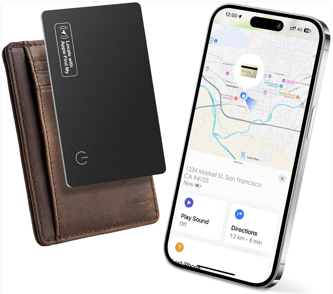
Figure 1: KINDEEP Wallet Tracker Card and its use with the Apple Find My app.

This image shows the slim KINDEEP Wallet Tracker Card positioned above a brown leather wallet, alongside an iPhone displaying the Apple Find My application. The app screen shows a map with the tracker's location, options to "Play Sound" and get "Directions," illustrating the primary function of the device.