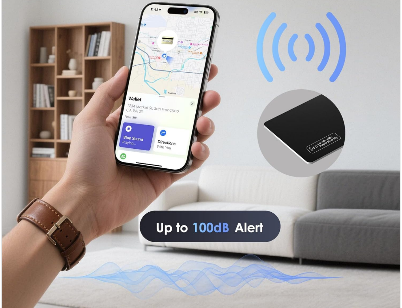
Figure 4: Using the "Play Sound" feature.

Tap "Play Sounds" with Bluetooth range for quick tracking