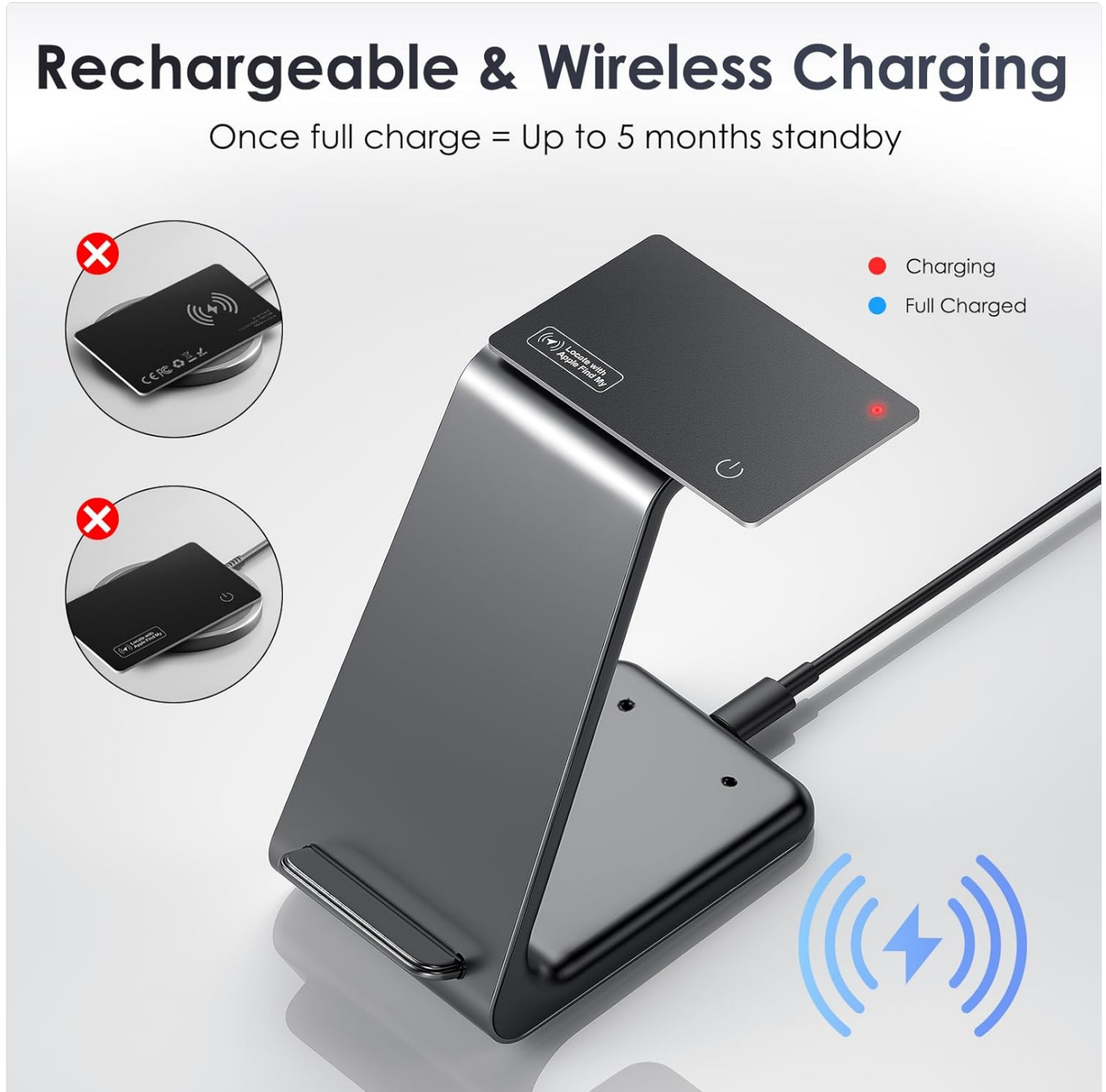
Figure 6: Wireless charging of the tracker card.

This image demonstrates the wireless charging capability of the KINDEEP Wallet Tracker Card. The card is placed on a wireless charging stand, with visual cues indicating correct and incorrect placement. Red and blue dots illustrate the charging (red) and fully charged (blue) states, respectively.