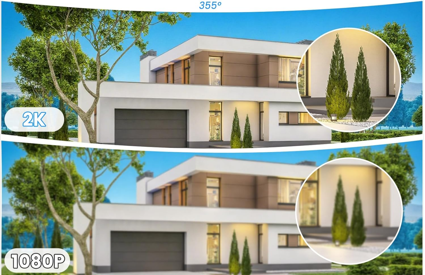
Image: Comparison of 2K and 1080p video quality, highlighting the superior clarity of 2K, along with the camera's 355° pan and 90° tilt range.