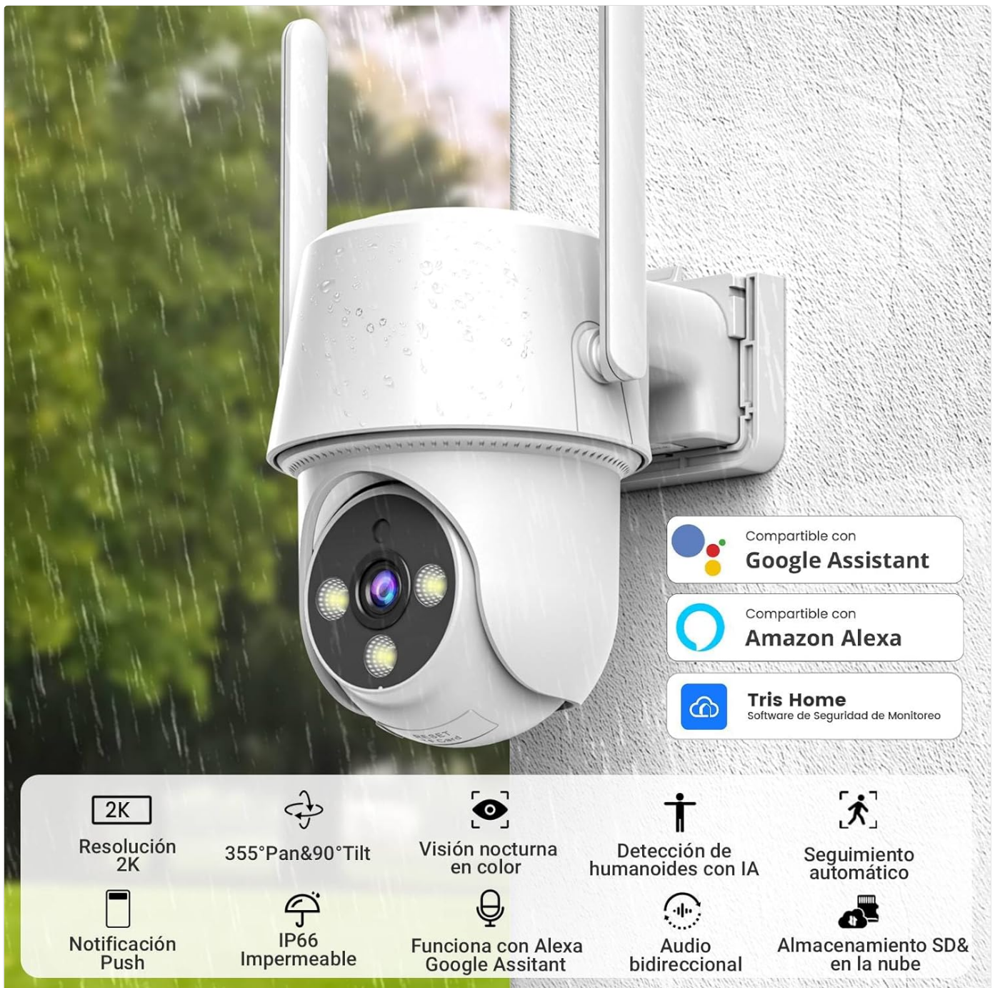
Image: The E T EASYTAO EC01 camera with icons indicating 2K resolution, 355° pan & 90° tilt, night vision, AI human detection, motion tracking, push notifications, IP66 waterproofing, Alexa/Google Assistant compatibility, two-way audio, and SD/cloud storage.