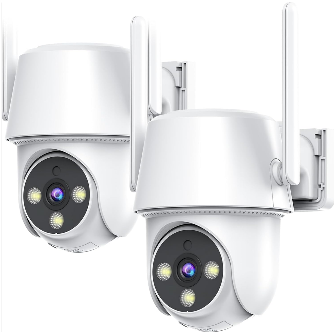
Image: E T EASYTAO EC01 3MP 2K Outdoor Security Camera, showing its compact design and dual antennas.