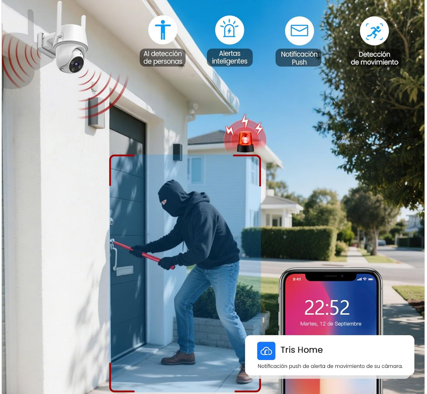
Image: Scene depicting a person triggering motion detection, with a smartphone displaying a push notification from the Tris Home app.