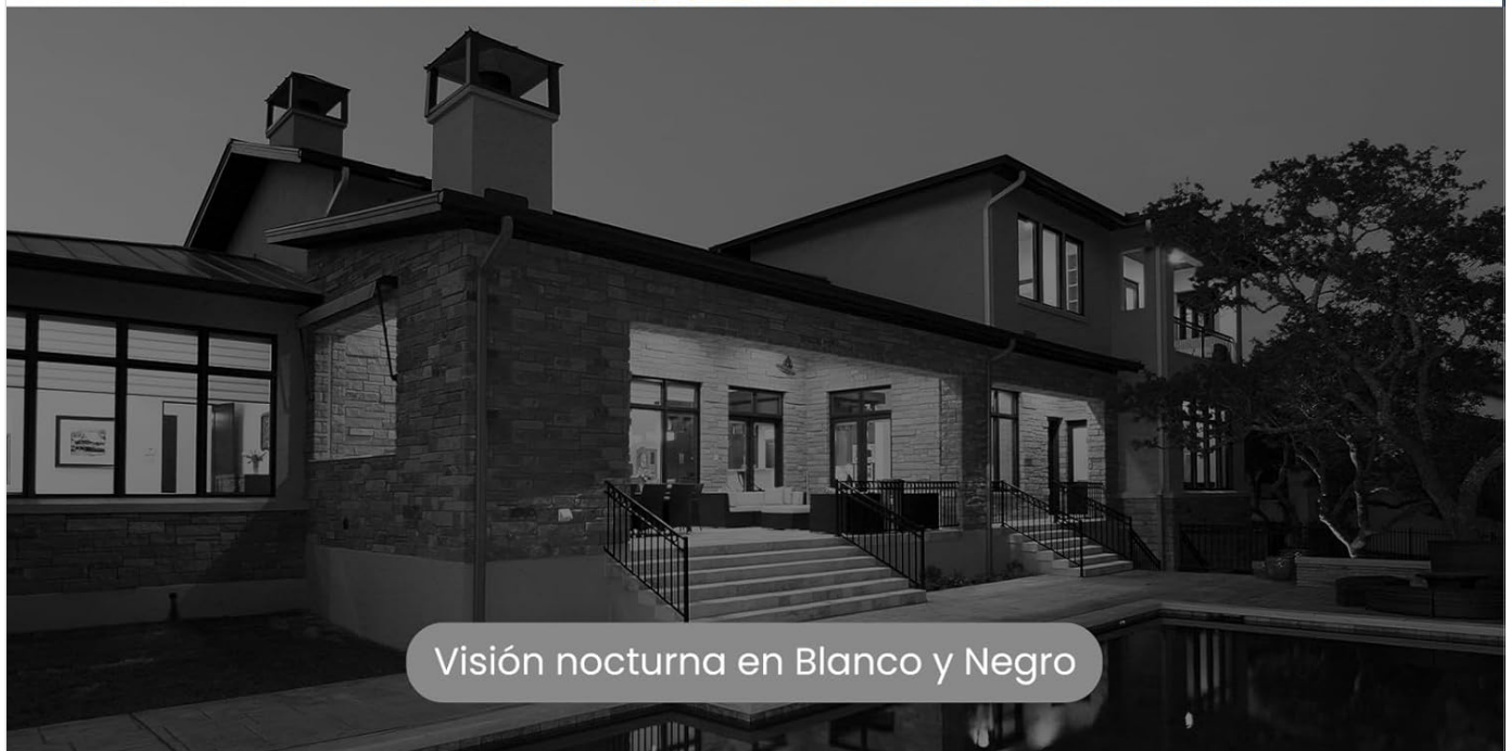
Image: Side-by-side view demonstrating the difference between full-color night vision and traditional black and white infrared night vision.