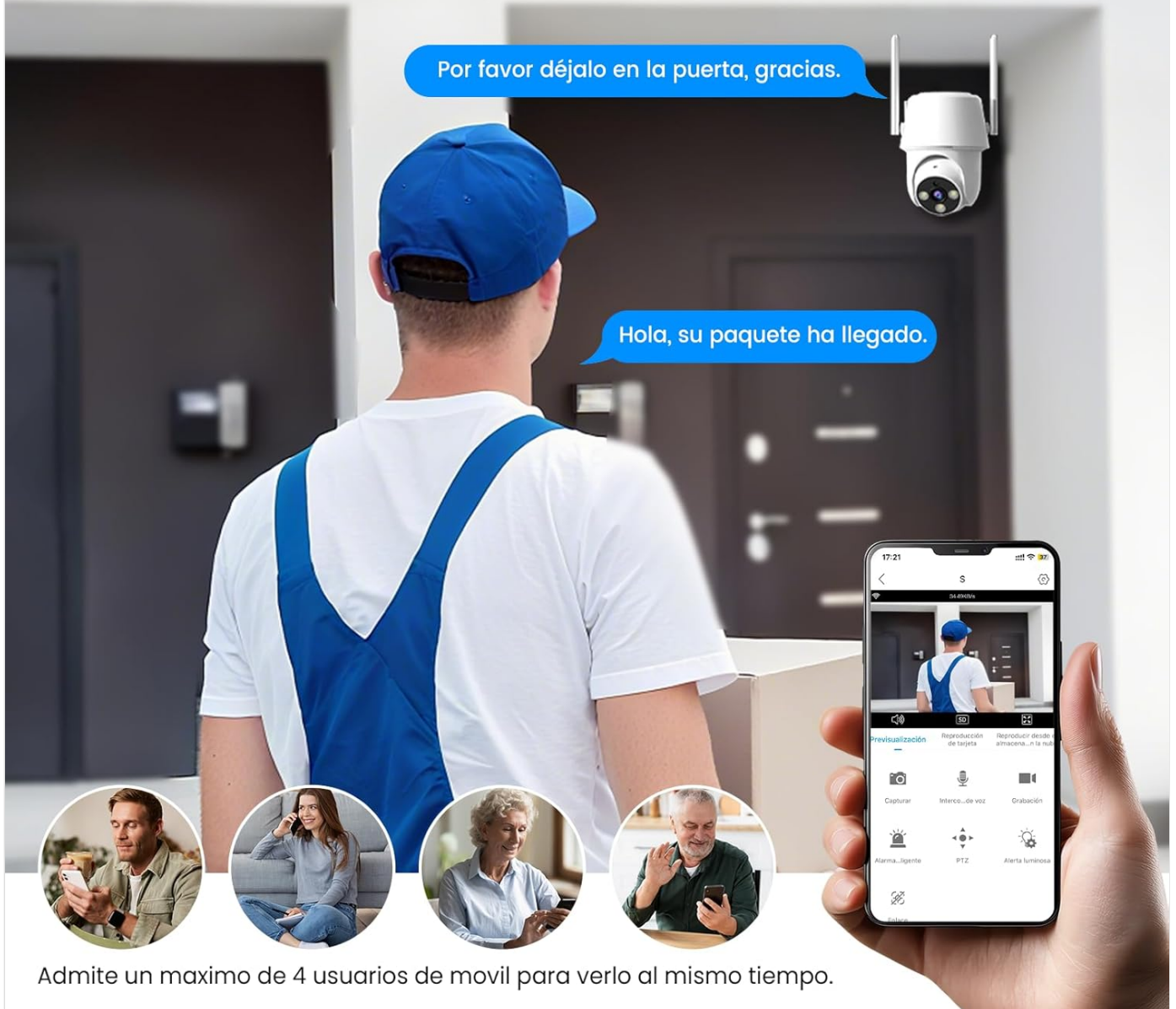
Image: Illustration of a user communicating with a delivery person via the camera's two-way audio feature, showing the app interface.