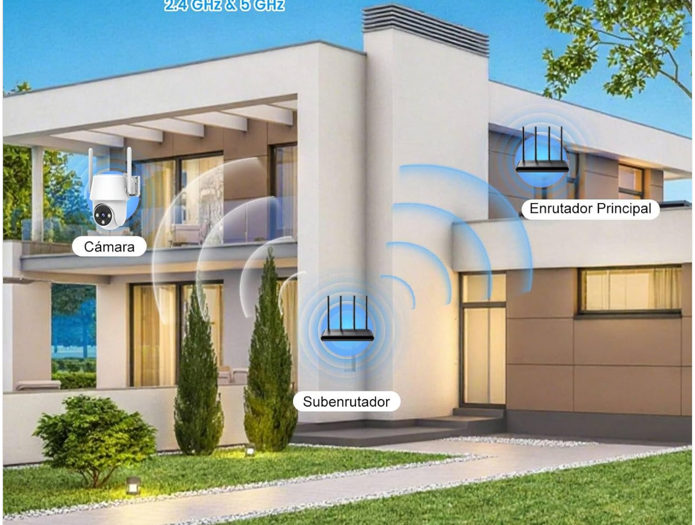
Image: Illustration of the camera's dual-band 2.4GHz and 5GHz Wi-Fi capabilities, showing connectivity to a home network.