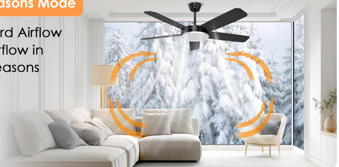
Figure 5: Reversible air circulation feature for optimal comfort in all seasons.