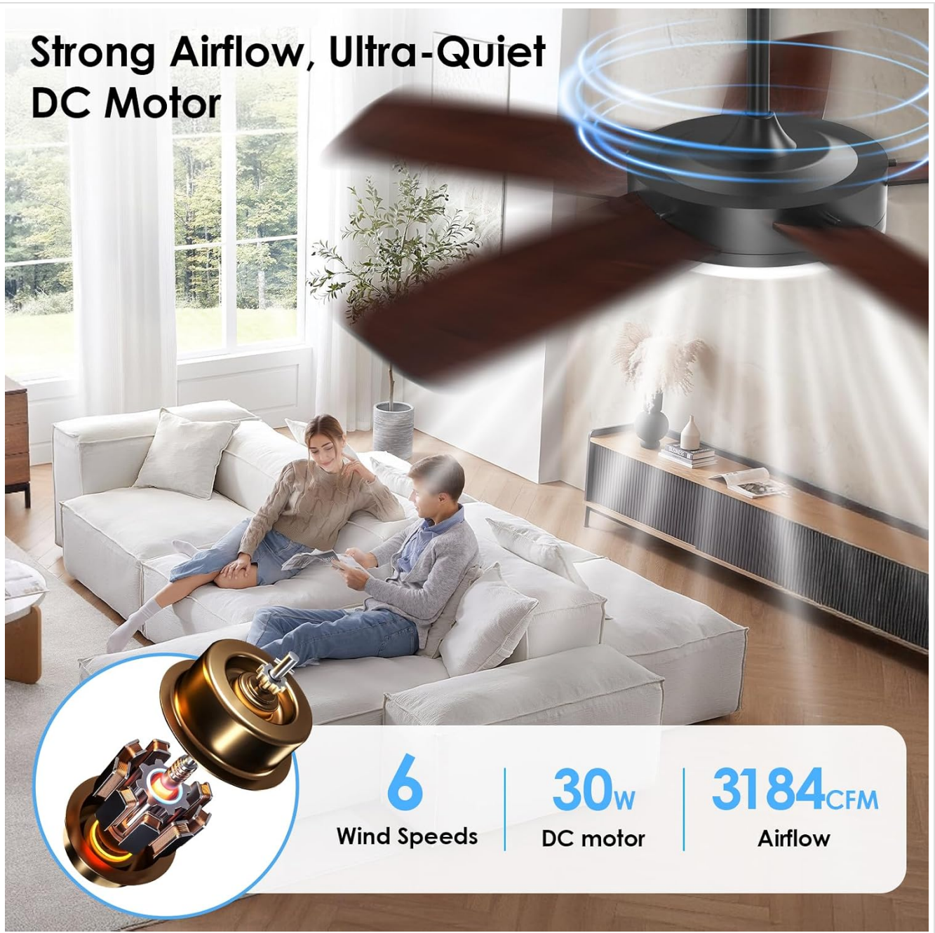
Figure 3: Illustration of the fan's 6-speed powerful cooling, highlighting the DC motor and high airflow.