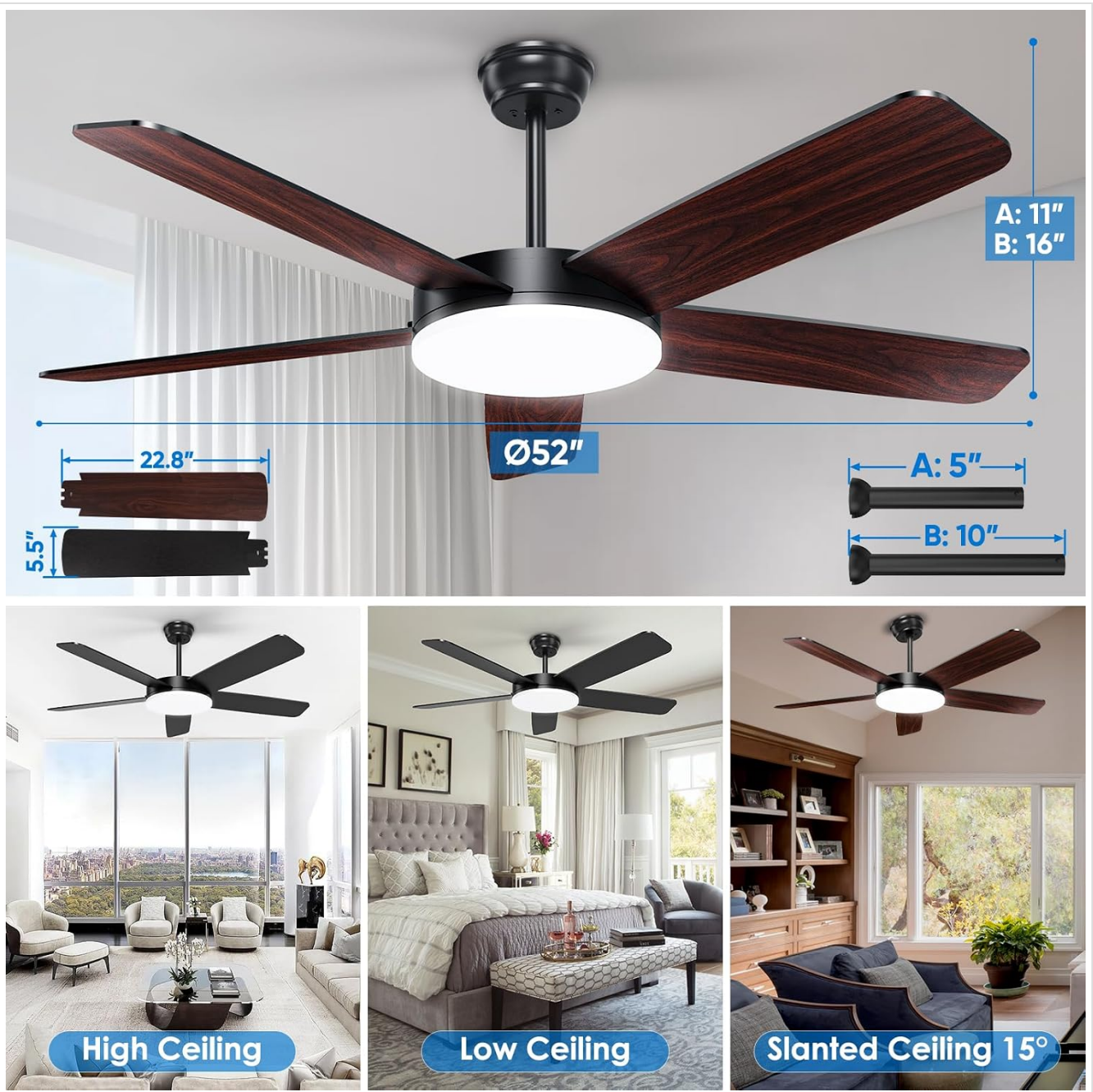
Figure 1: Overall view of the ropelux 52-inch ceiling fan, illustrating its dimensions and suitability for various ceiling heights (high, low, and slanted up to 15 degrees).