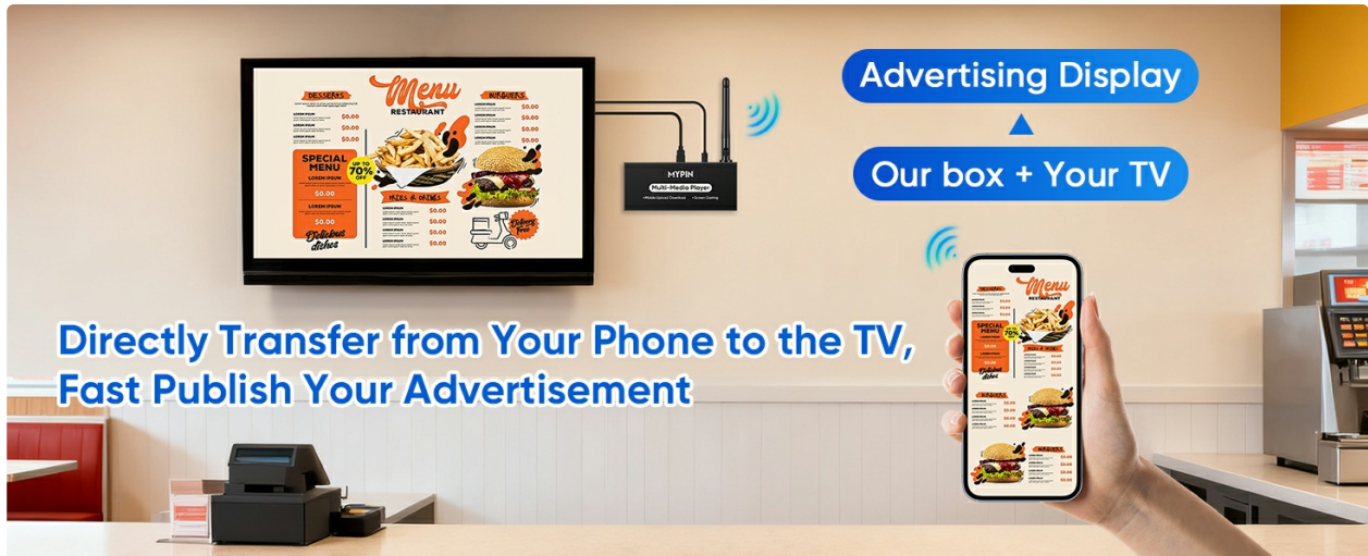
Image: The MYPIN HA0362 Media Player displaying a menu with options for video, music, and photo playback, highlighting automatic and loop play features.

The MYPIN HA0362 supports playing media directly from USB drives or Micro SD cards. Insert your storage device into the corresponding port on the player. Use the remote control to navigate to the 'Files' or 'Video/Photo/Music' section on the home screen to browse and play your content.