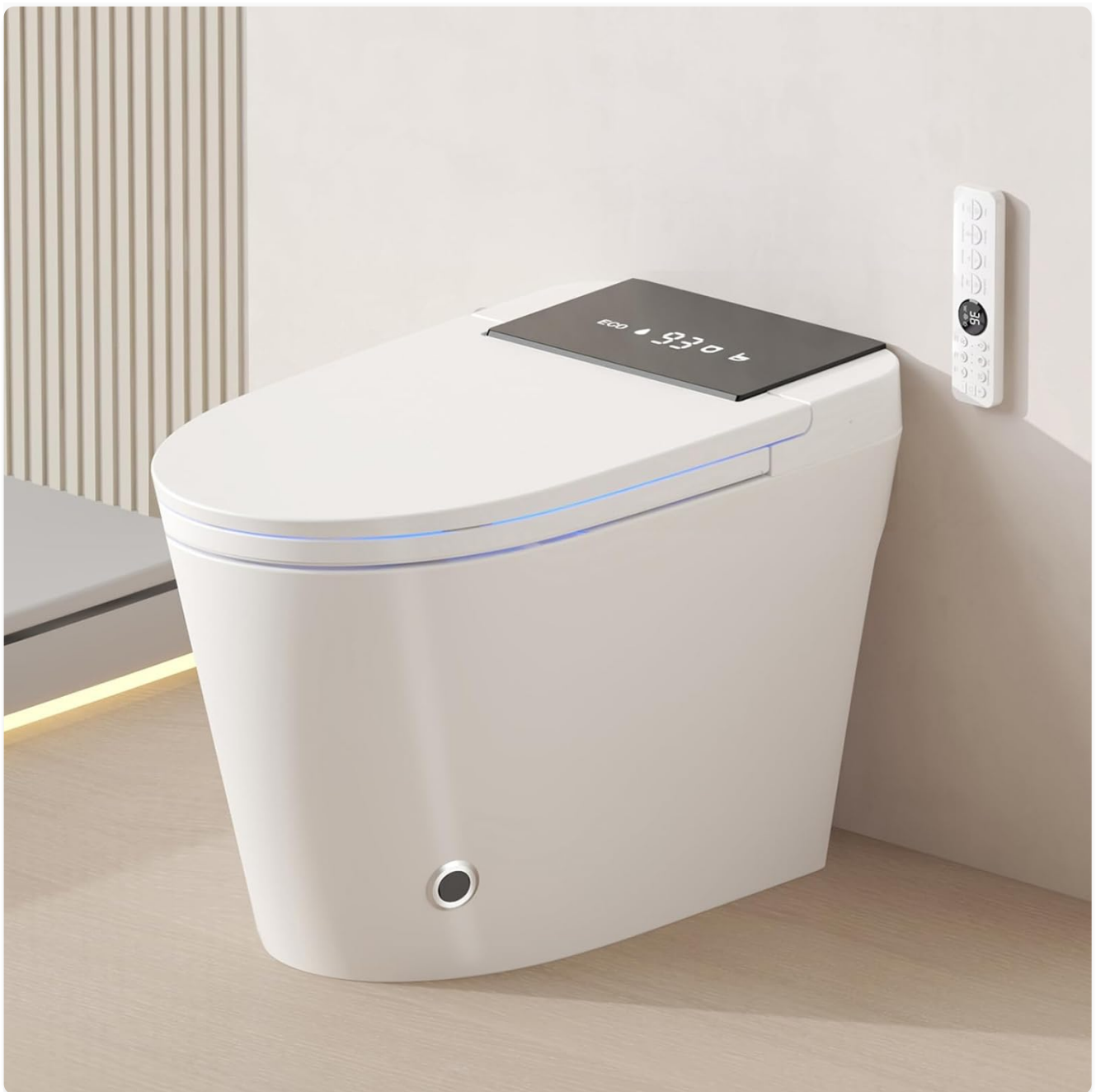
Figure 1: Loniko ST945B●Auto Smart Toilet. This image displays the sleek, modern design of the smart toilet with its integrated LED display and remote control.