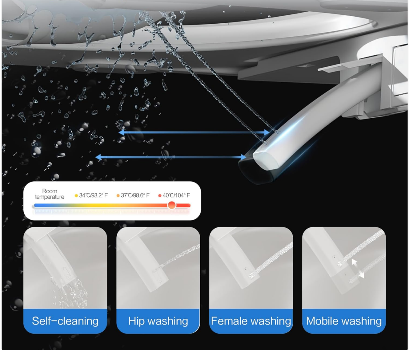
Figure 5: Multiple Wash Modes. This image illustrates the various bidet functions, including self-cleaning, hip washing, female washing, and mobile washing, along with adjustable water temperature settings.

Comprehensive protection of private health