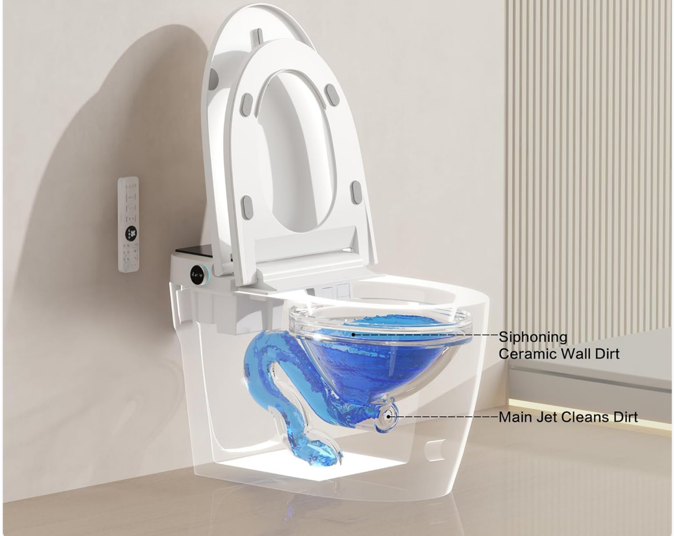
Figure 3: Powerful and Efficient Flush. This diagram illustrates the siphonic flushing mechanism, showing how the main jet cleans dirt and the siphoning action removes ceramic wall dirt for a thorough clean.