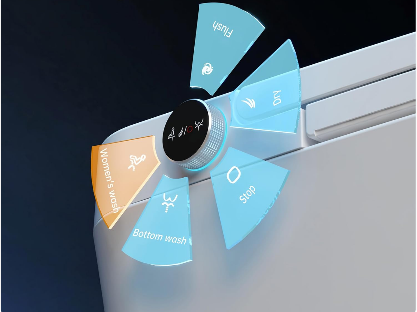
Figure 8: One-Touch Knob. This image illustrates the one-touch knob, which allows for easy rotation to select functions like women's wash, bottom wash, flush, dry, and stop, simplifying operation.