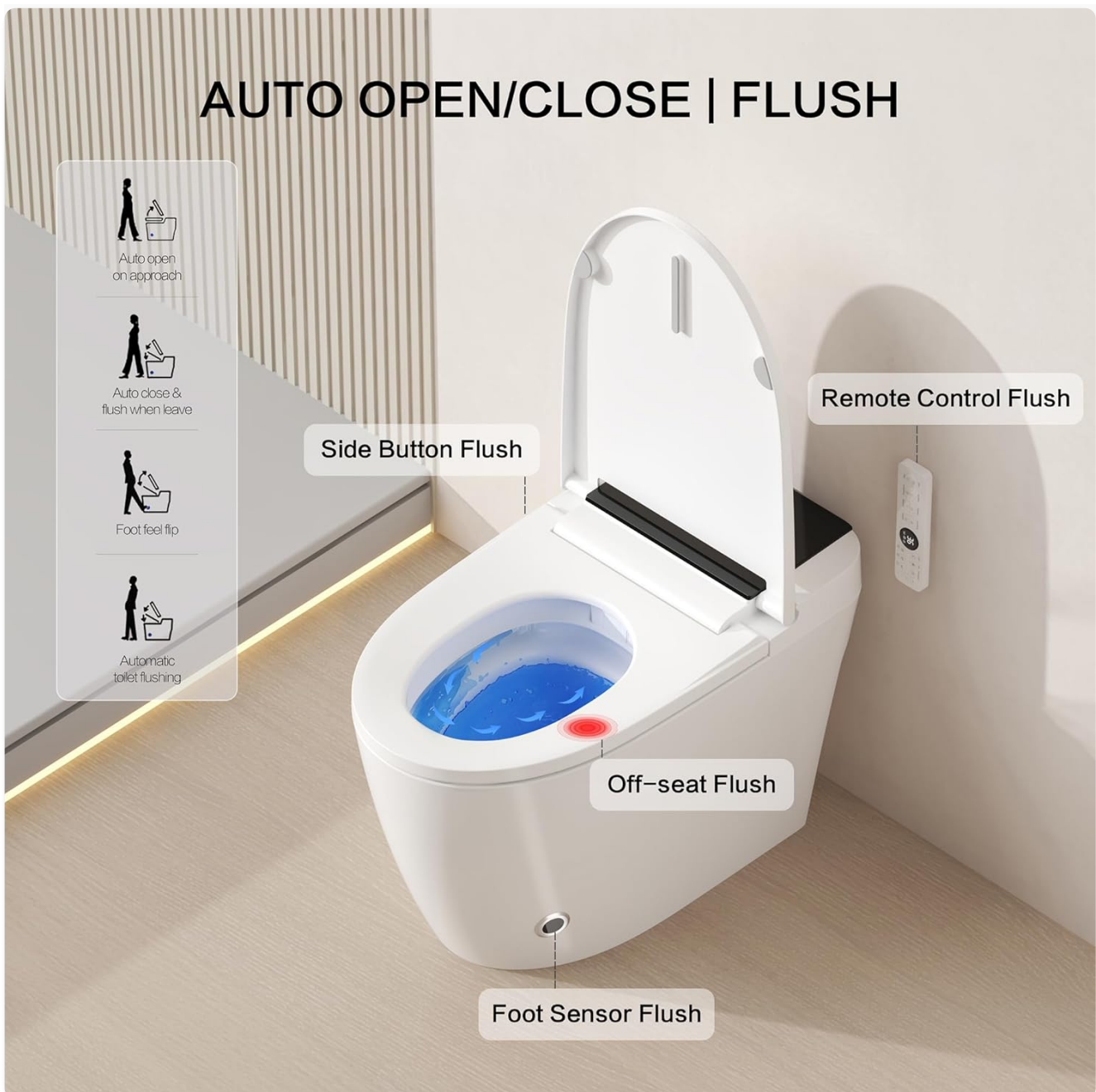
Figure 4: Auto Open/Close and Flush. This image demonstrates the various automatic functions, including auto-open on approach, auto-close and flush upon leaving, foot sensor flush, and off-seat auto flushing.