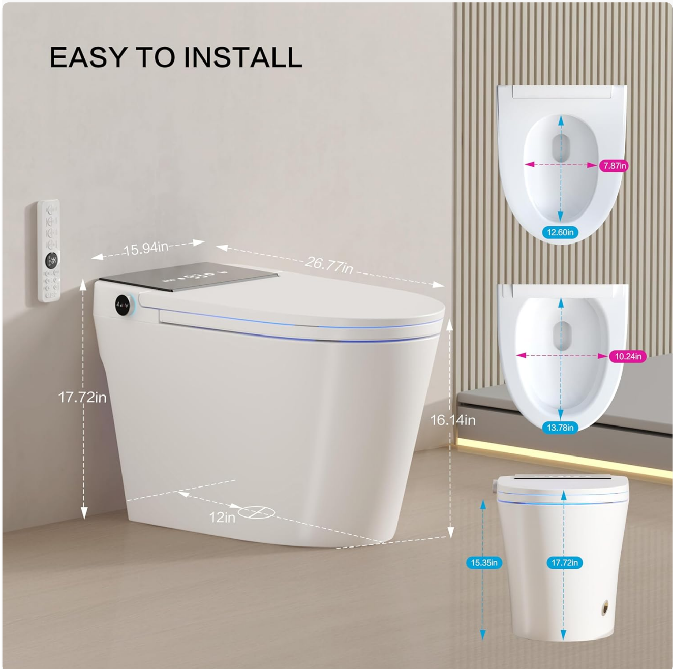
Figure 2: Easy Installation Diagram. This image illustrates the dimensions of the smart toilet and highlights its compatibility with standard 12-inch rough-in distances, along with a visual of included installation components.