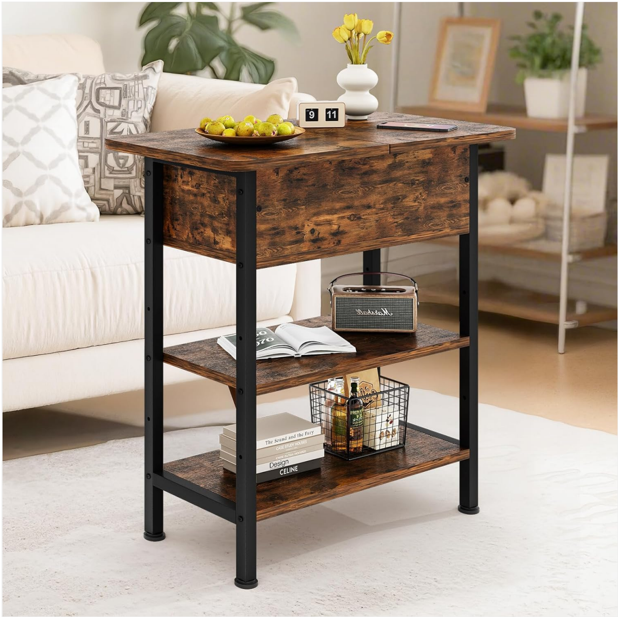
Image 4.2: Key features for assembly and use, including rounded corners, flip hinge mechanism, integrated USB and power outlets, and adjustable feet for stability.