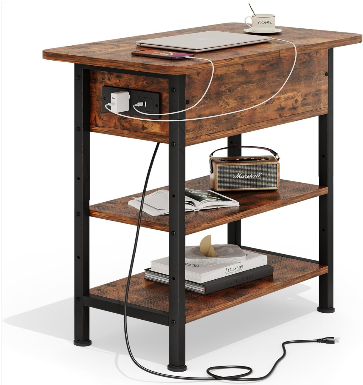
Image 1.1: The GRUSIGN End Table with Charging Station, showcasing its compact design and integrated power features.