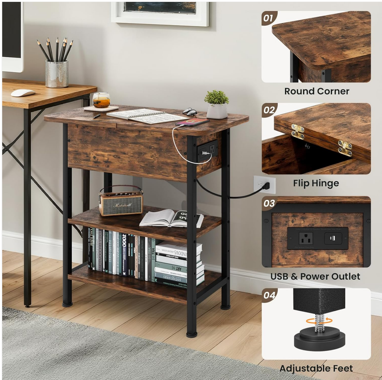
Image 5.1: A detailed view of the integrated charging station, highlighting the USB and AC power options.