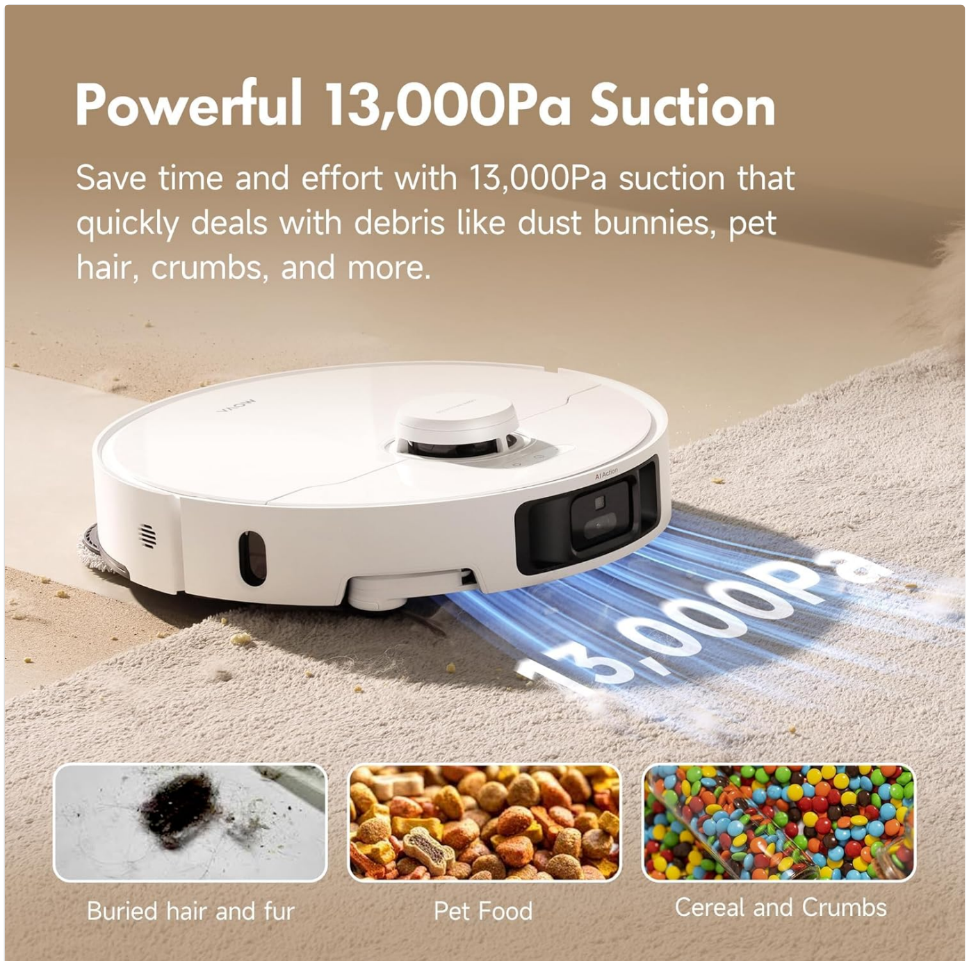
Figure 4: The Mova P10 Pro Ultra boasts a powerful 13,000Pa suction, capable of effectively cleaning various types of debris from floors.

Save time and effort with 13,000Pa suction that quickly deals with debris like dust bunnies, pet hair, crumbs, and more.