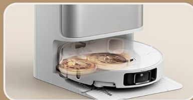
Hot air self-drying