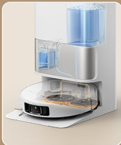
Hot water self-washing