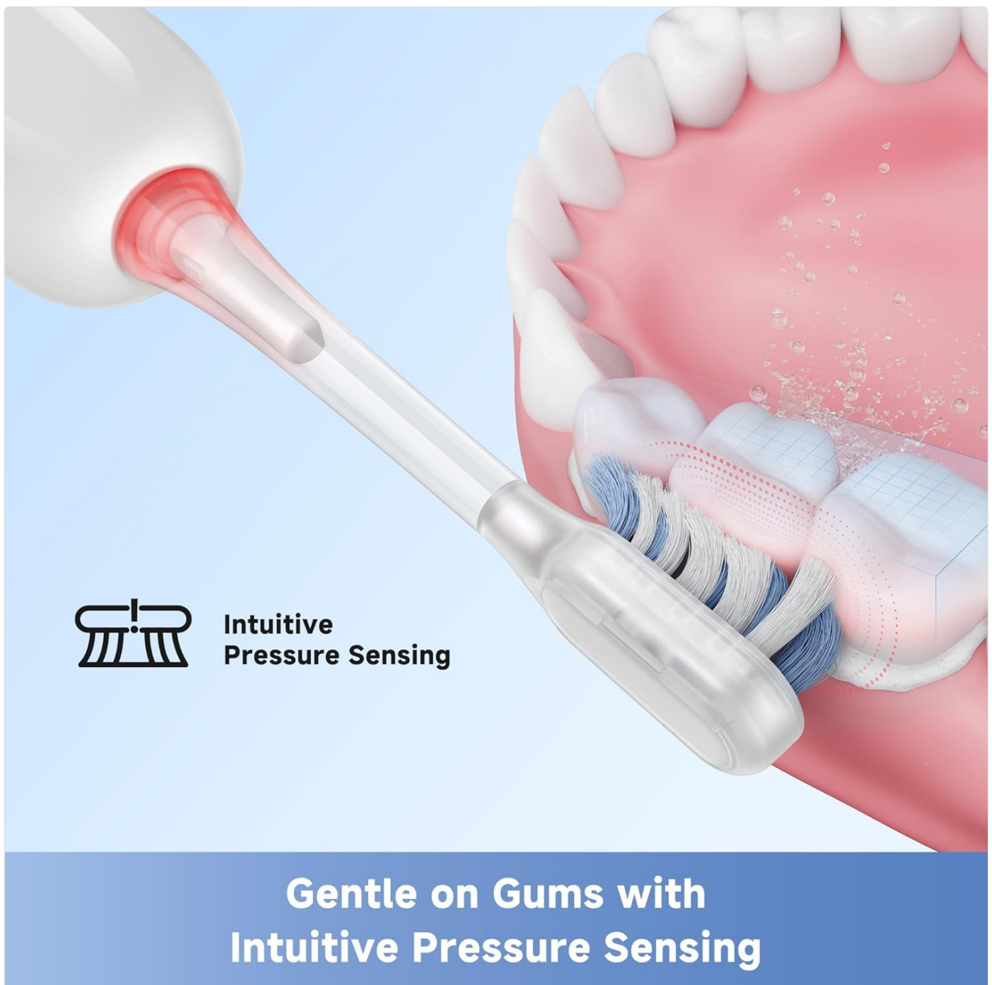
Figure 9: The intuitive pressure sensing feature safeguards your gums and teeth by signaling and reducing vibration when too much force is applied.