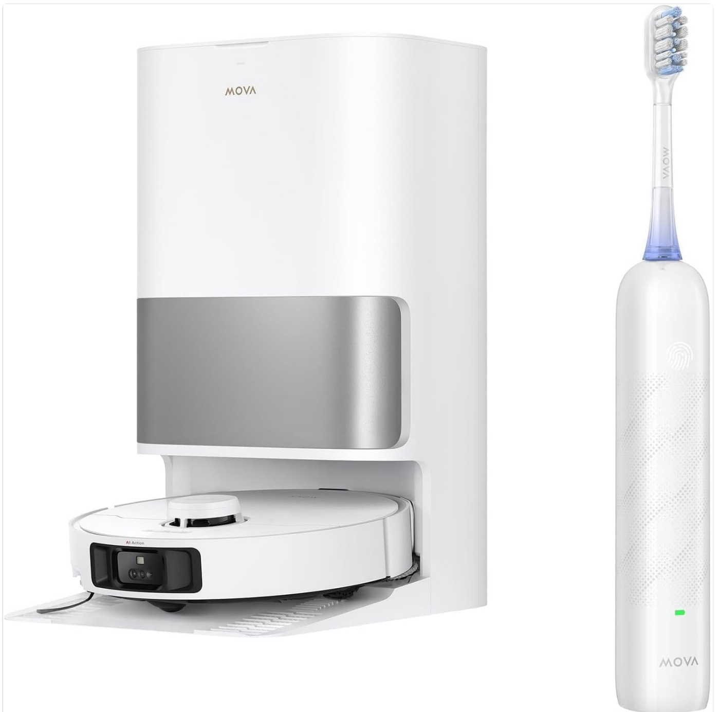
Figure 1: The Mova P10 Pro Ultra Robot Vacuum and Mop with its advanced docking station, accompanied by the Mova Fresh Electric Toothbrush.