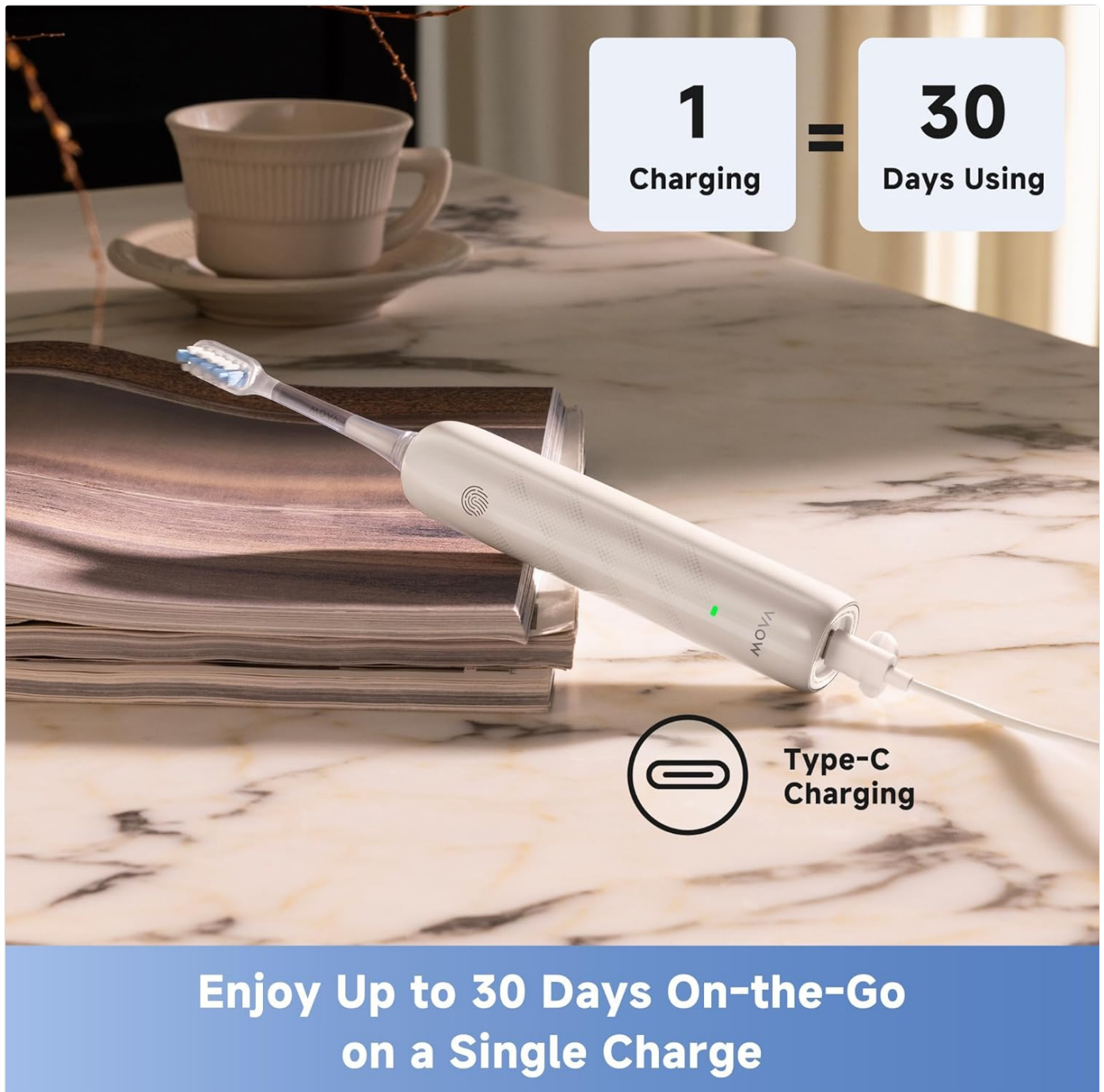
Figure 3: The Fresh Electric Toothbrush offers extended battery life, providing up to 30 days of use on a single charge via its convenient Type-C charging port.