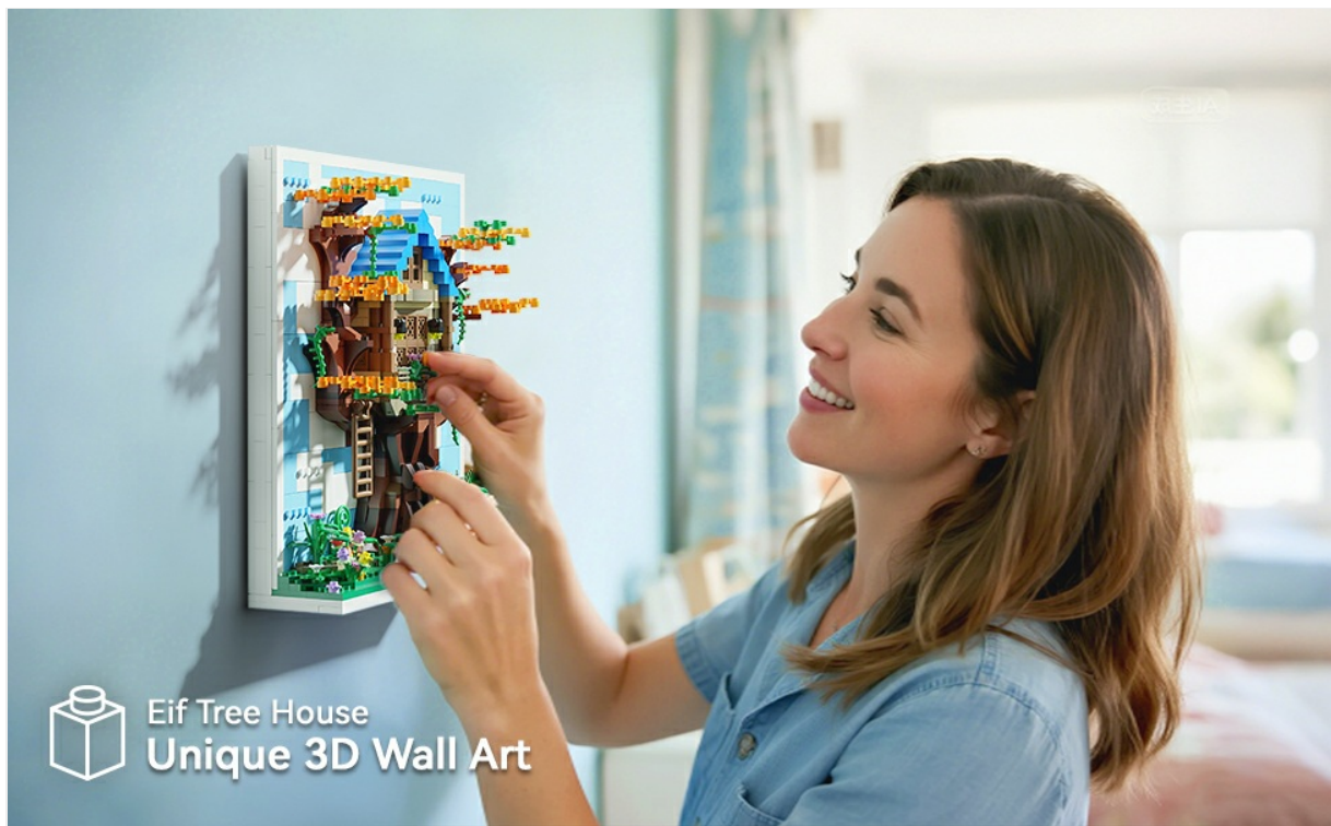
Image: A person carefully attaching the completed Eif Tree House model to a wall, demonstrating its use as 3D wall art.