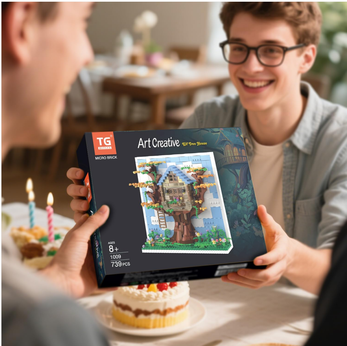
Image: The retail packaging for the TG BLOCKS Eif Tree House Building Set, showing the product name, piece count, and age recommendation.