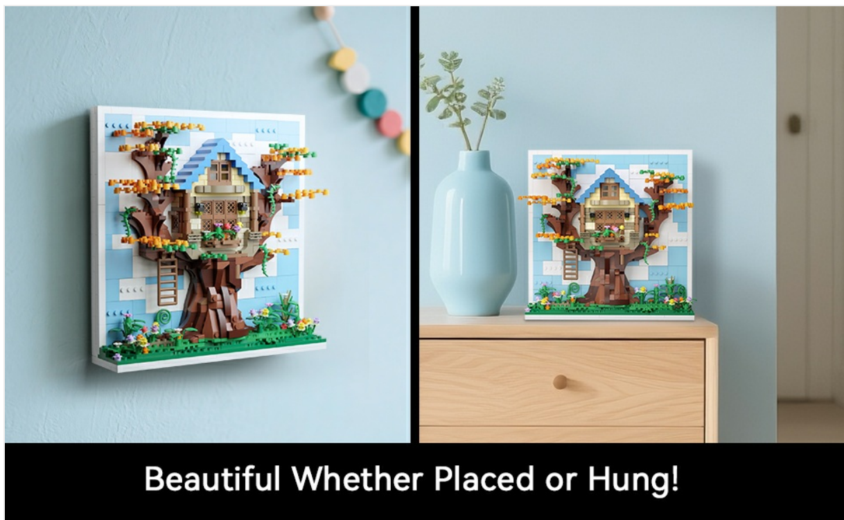
Image: The Eif Tree House model showcased in two display settings: mounted on a wall and placed freestanding on a shelf, illustrating versatile decoration options.