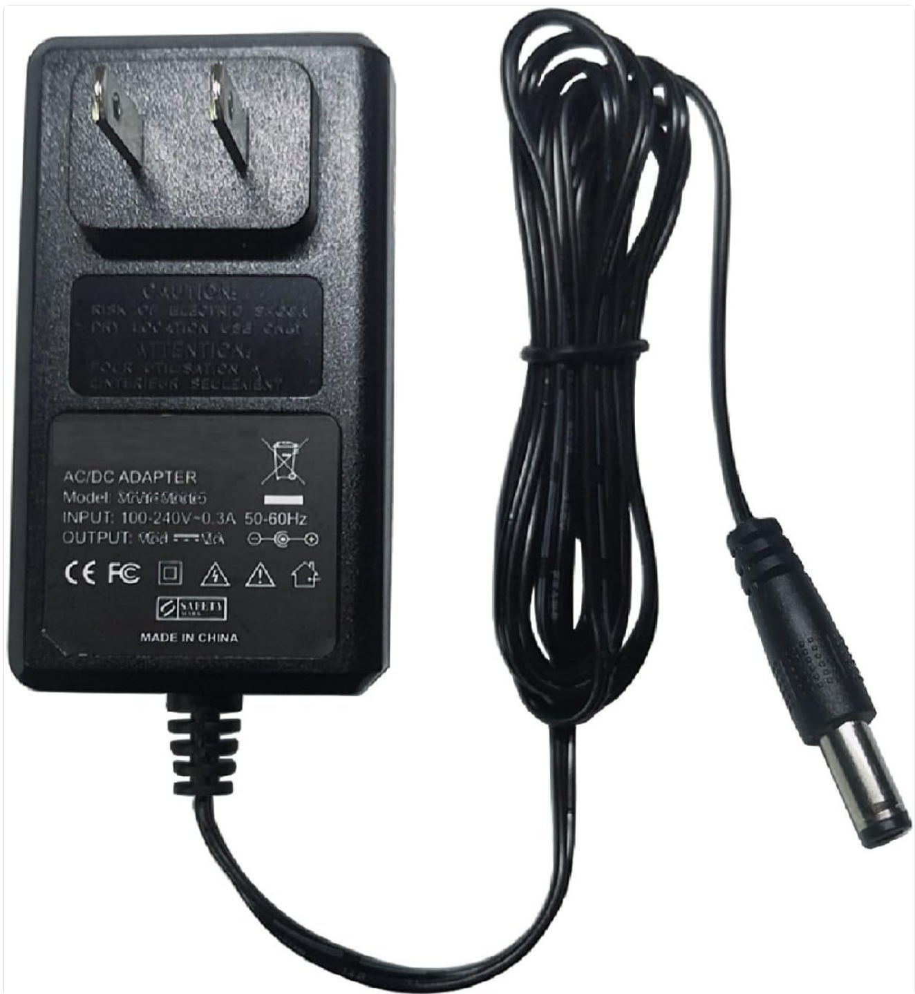
Figure 1: The eeTao 42V Replacement Power Adapter, showing the main unit and DC output cable.