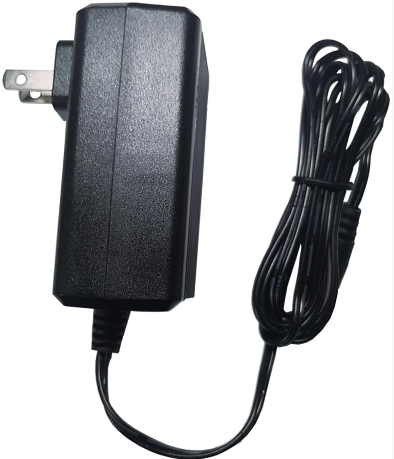
Figure 5: A side view of the eeTao power adapter with its neatly coiled cable, emphasizing proper storage and cable management.