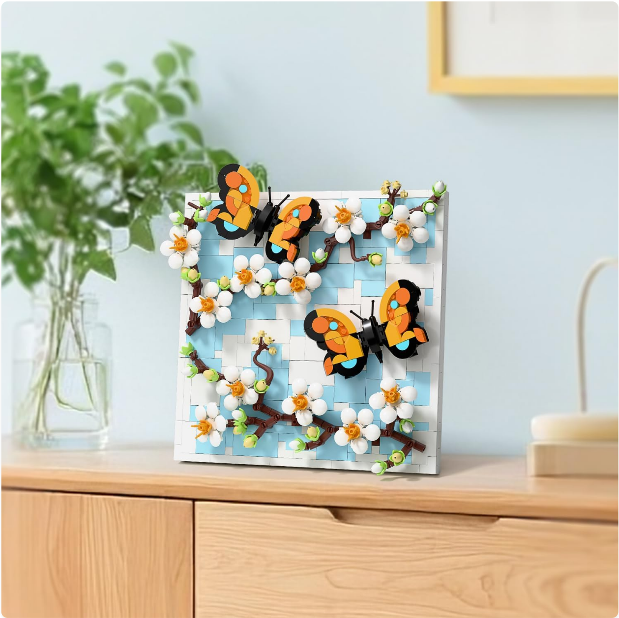
Image 5.1: The Natural World Building Set displayed as a table decoration.