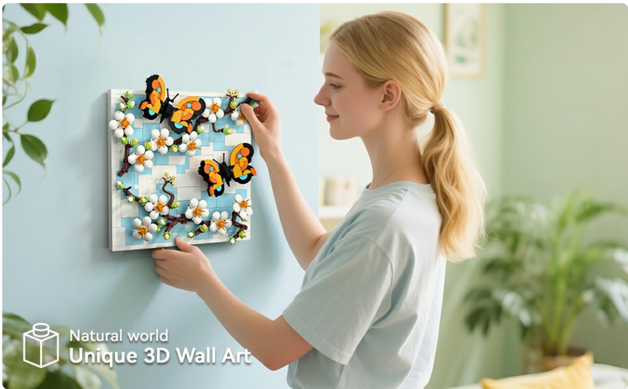
Image 5.3: The versatility of the set, suitable for both wall mounting and table display.