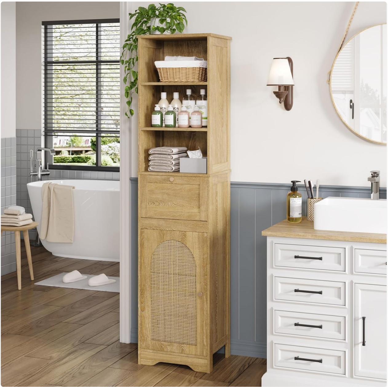
Image 1.1: The Befrases 67"H Tall Bathroom Storage Cabinet in a bathroom setting, showcasing its design and storage capabilities.