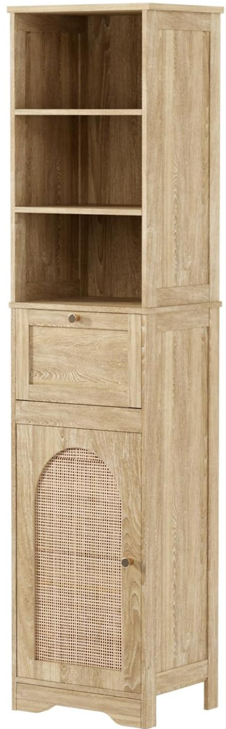
Image 6.1: Close-up of the natural handmade rattan, emphasizing its texture and breathable quality.