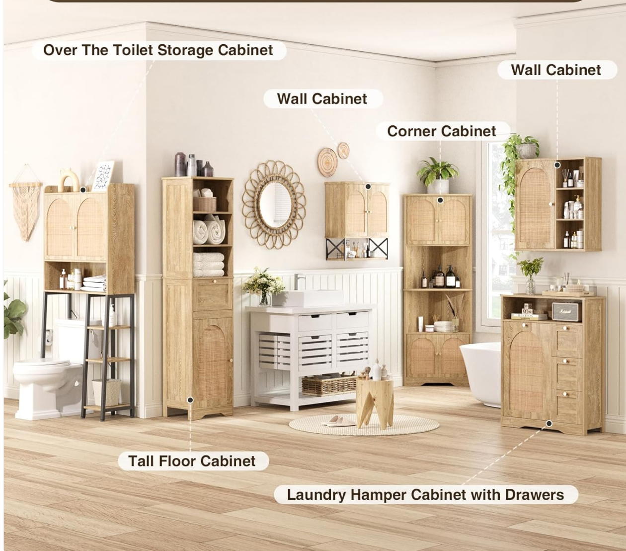
Image 5.2: Shows the cabinet as part of a larger storage set, demonstrating its versatility in various room types.