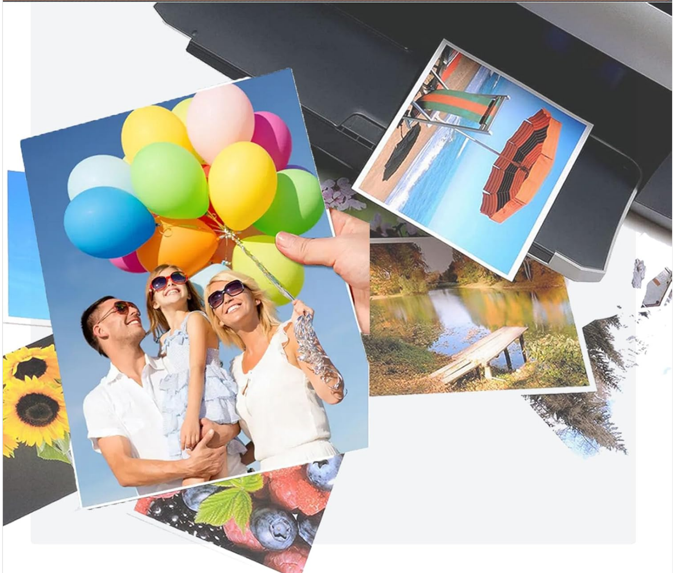
Image: A graphic titled "Premium Performance" displaying several high-quality printed photographs, suggesting excellent color reproduction and clarity.