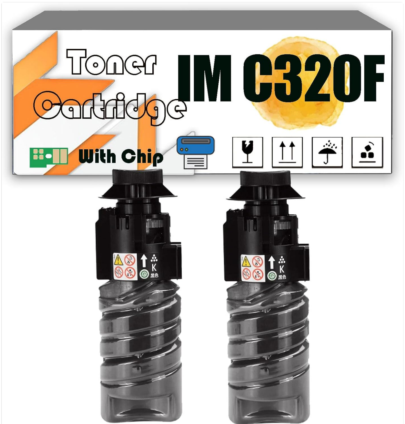
Image: Two WMSNUH IM C320F black toner cartridges. The image highlights the "Toner Cartridge IM C320F" branding and indicates compatibility with a chip. Various handling symbols are also visible on the packaging.