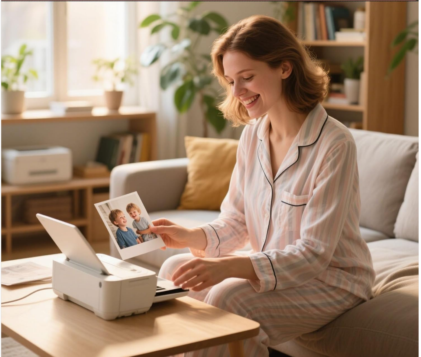
Image: A graphic titled "Instant Printout" showing a person smiling while holding a freshly printed photograph, with a printer and laptop visible in the background.