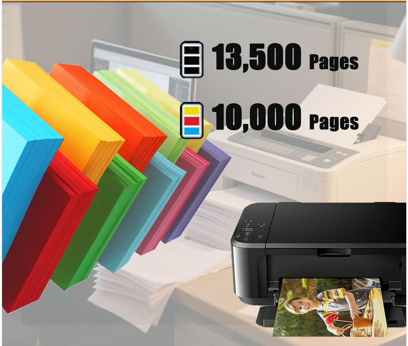
Image: A graphic titled "High Volume Printing" showing stacks of colorful paper and a printer. It indicates a yield of 13,500 pages for black and 10,000 pages for color.