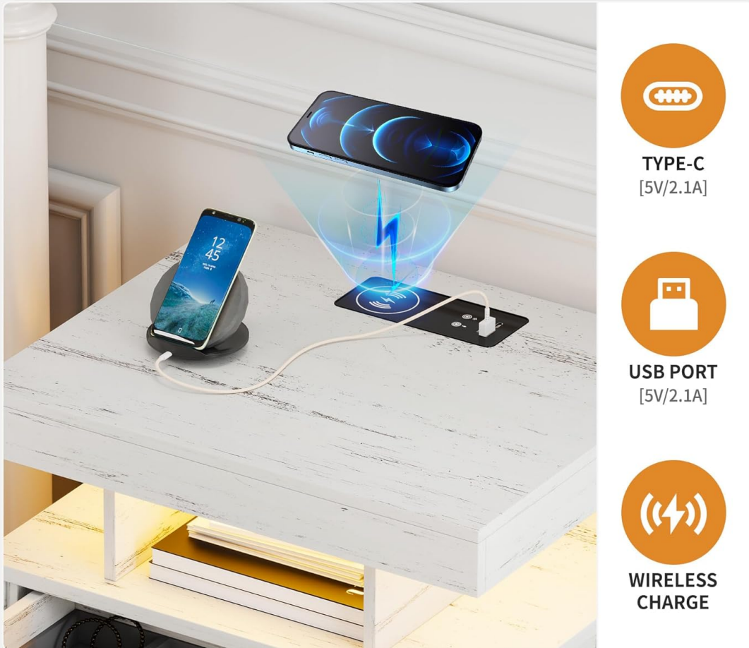
Image: Detailed view of the nightstand's 3-in-1 charging station, showing the wireless charging area, USB, and Type-C ports.

Your browser does not support the video tag.