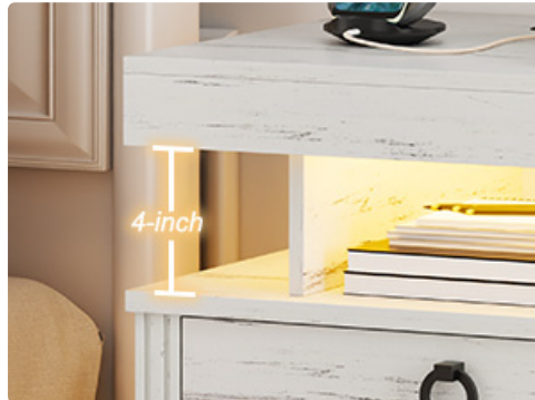
Image: View of the nightstand's open storage compartment and drawers, highlighting the internal structure.