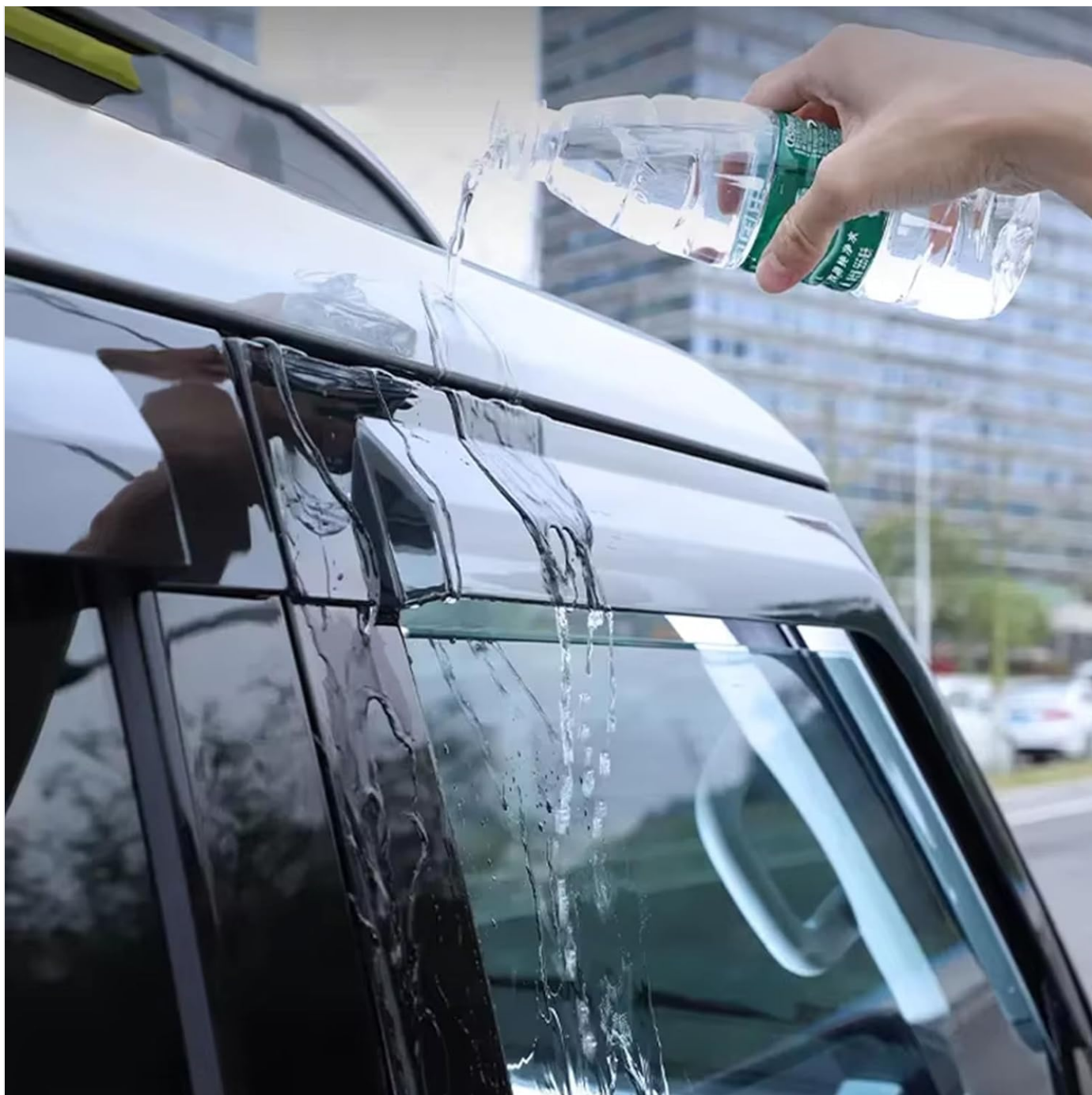
Image: Demonstrates how the visor deflects water, keeping the interior dry.