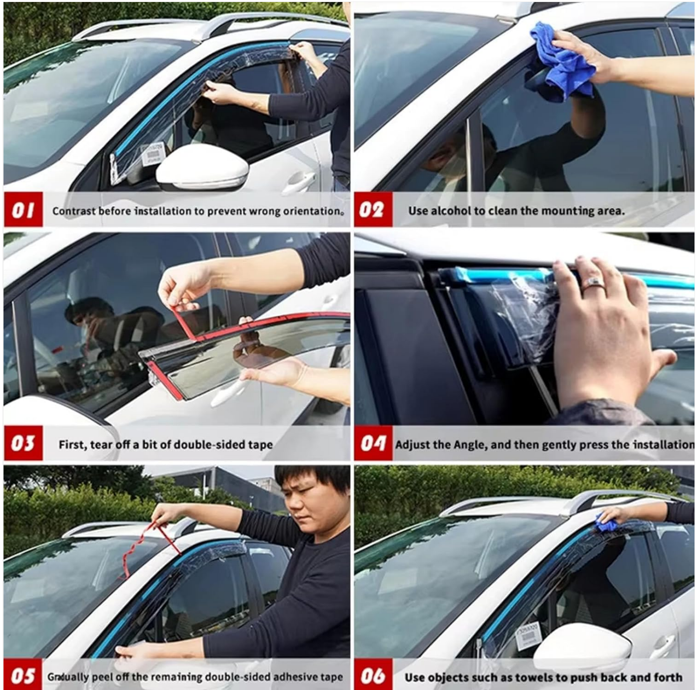
Image: Visual guide for the installation process, from cleaning to final adhesion.