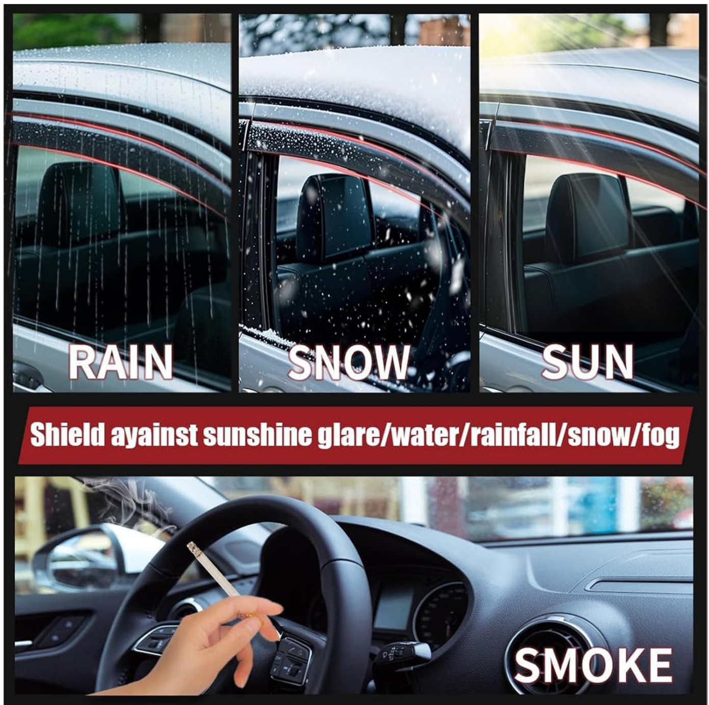
Image: Demonstrates the visor's ability to shield against rain, snow, sun glare, and allow for smoke ventilation.