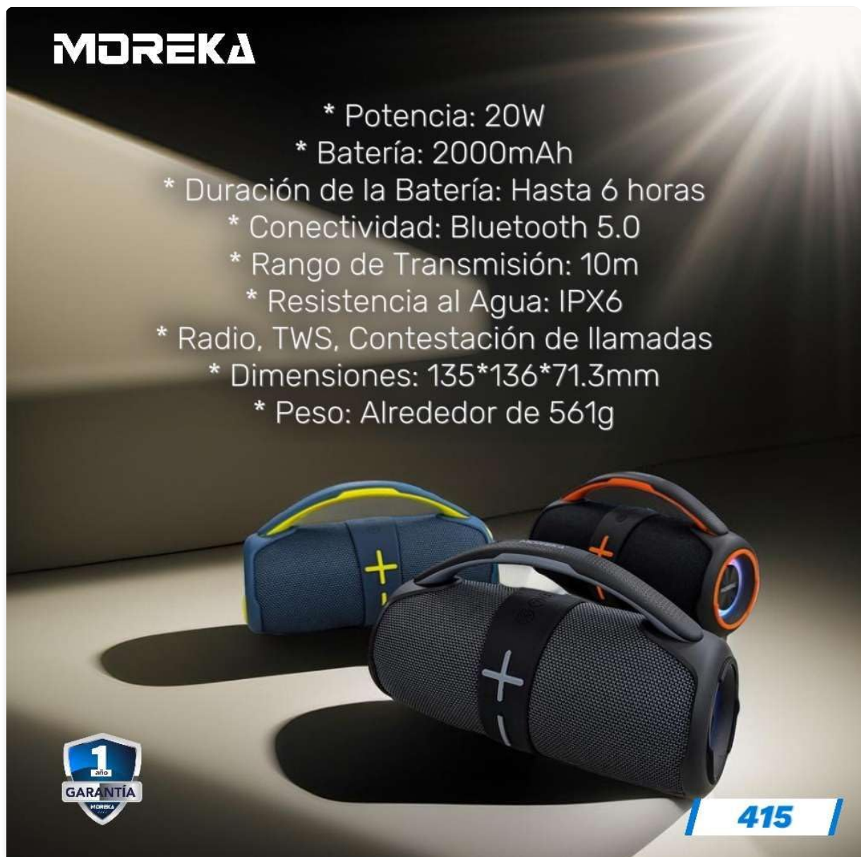
Image: A visual representation of the MOREKA Bocina 415 speaker highlighting its technical specifications and features.