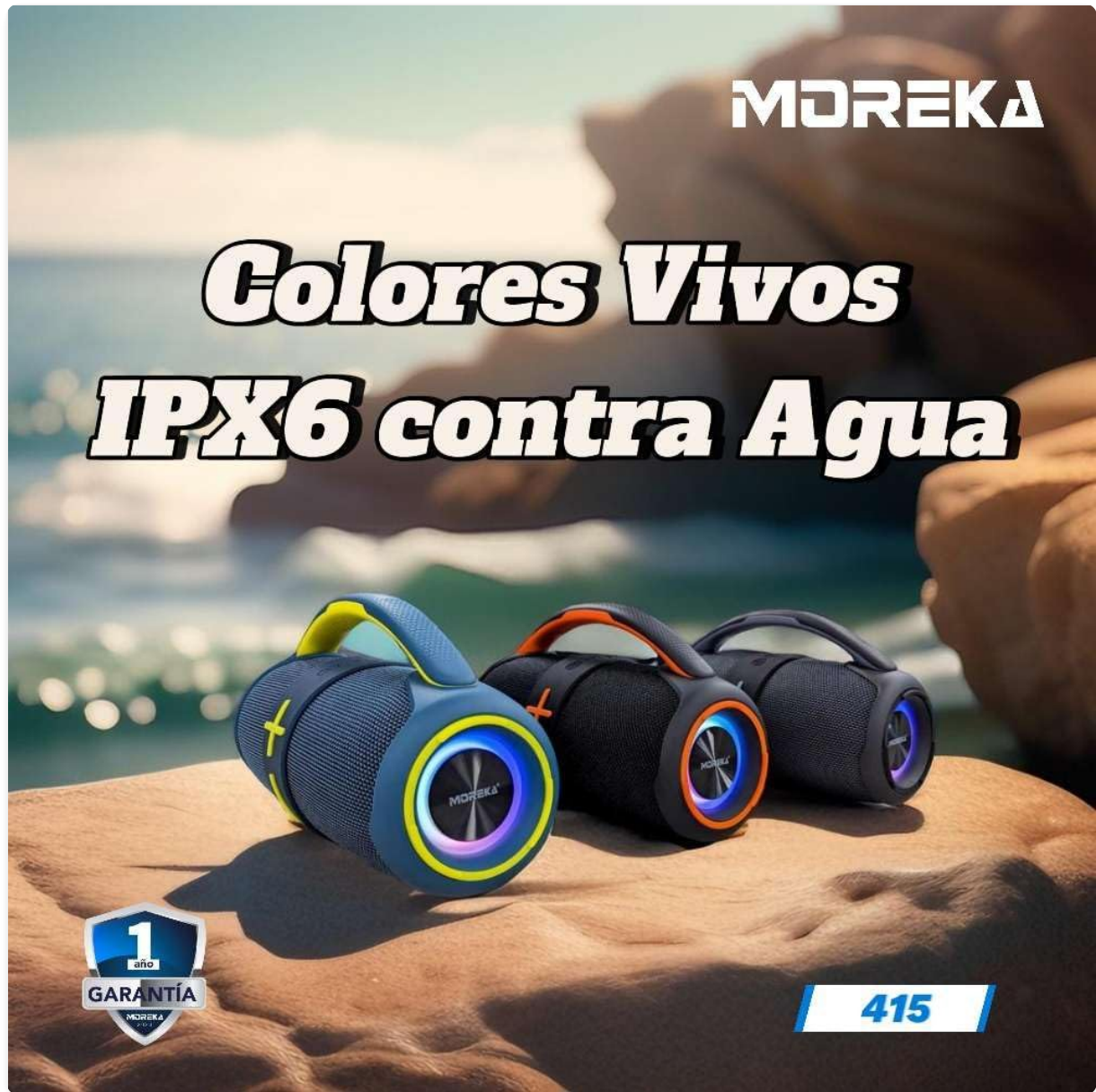
Image: The MOREKA Bocina 415 speaker, featuring a badge indicating a 1-year warranty.

The MOREKA Bocina 415 speaker comes with a 1-year warranty from the date of purchase, as indicated by the "1 año Garantía" on product images. This warranty covers manufacturing defects. For warranty claims or technical support, please contact your retailer or the MOREKA customer service department through their official channels. Please retain your proof of purchase for warranty validation.