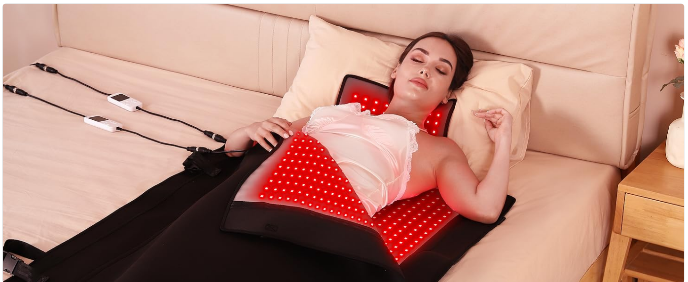
Figure 4: Benefits of Red Light Therapy