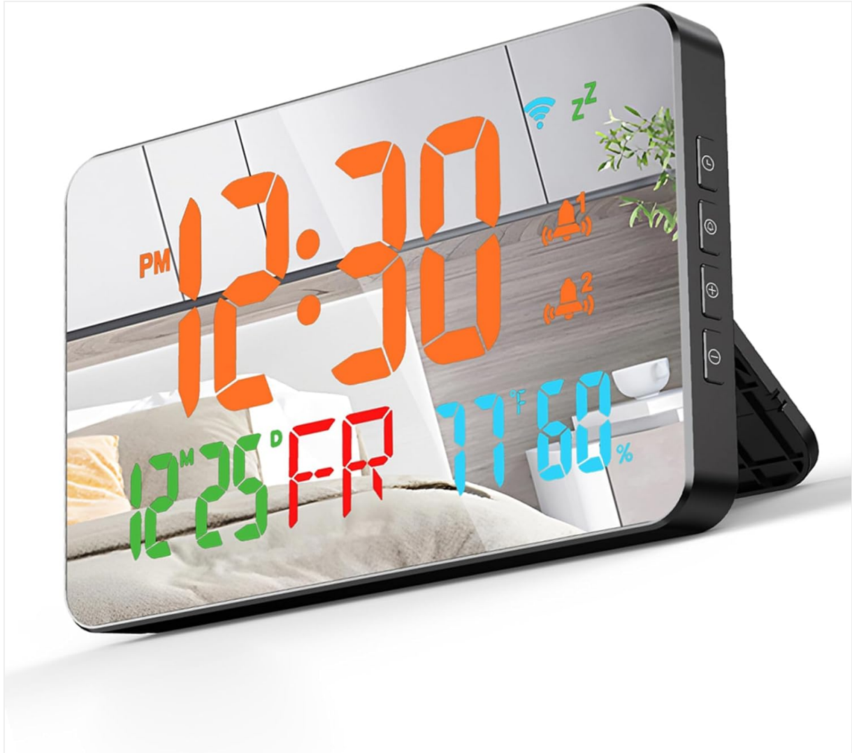
Image: The Walfront Digital Alarm Clock positioned on a surface, showcasing its display and the array of control buttons on its right side.

The clock can be placed on a desktop using its integrated stand or mounted on a wall. Ensure stable placement for optimal performance.