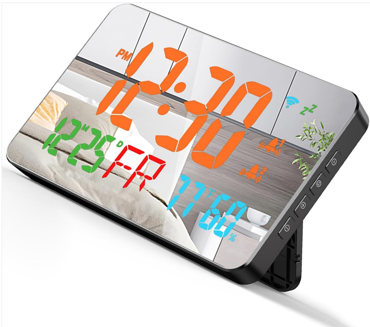
Image: A side view of the Walfront Digital Alarm Clock, highlighting the clear display and the accessible control buttons on the right side for various functions.