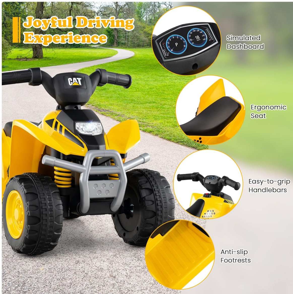
Image: The ATV's features designed for a joyful driving experience, such as the simulated dashboard, ergonomic seat, and easy-to-grip handlebars.