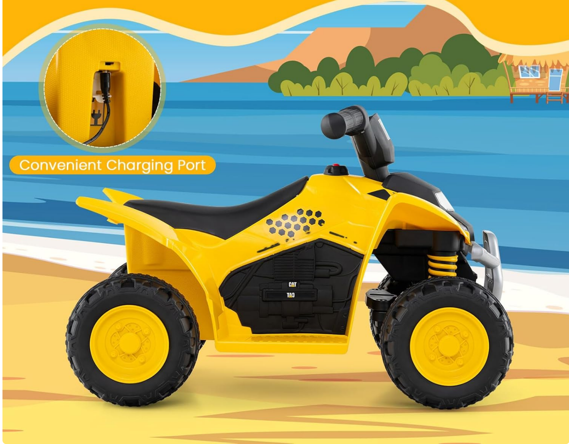
Image: The Costzon Kids ATV highlighting the convenient charging port and battery specifications.