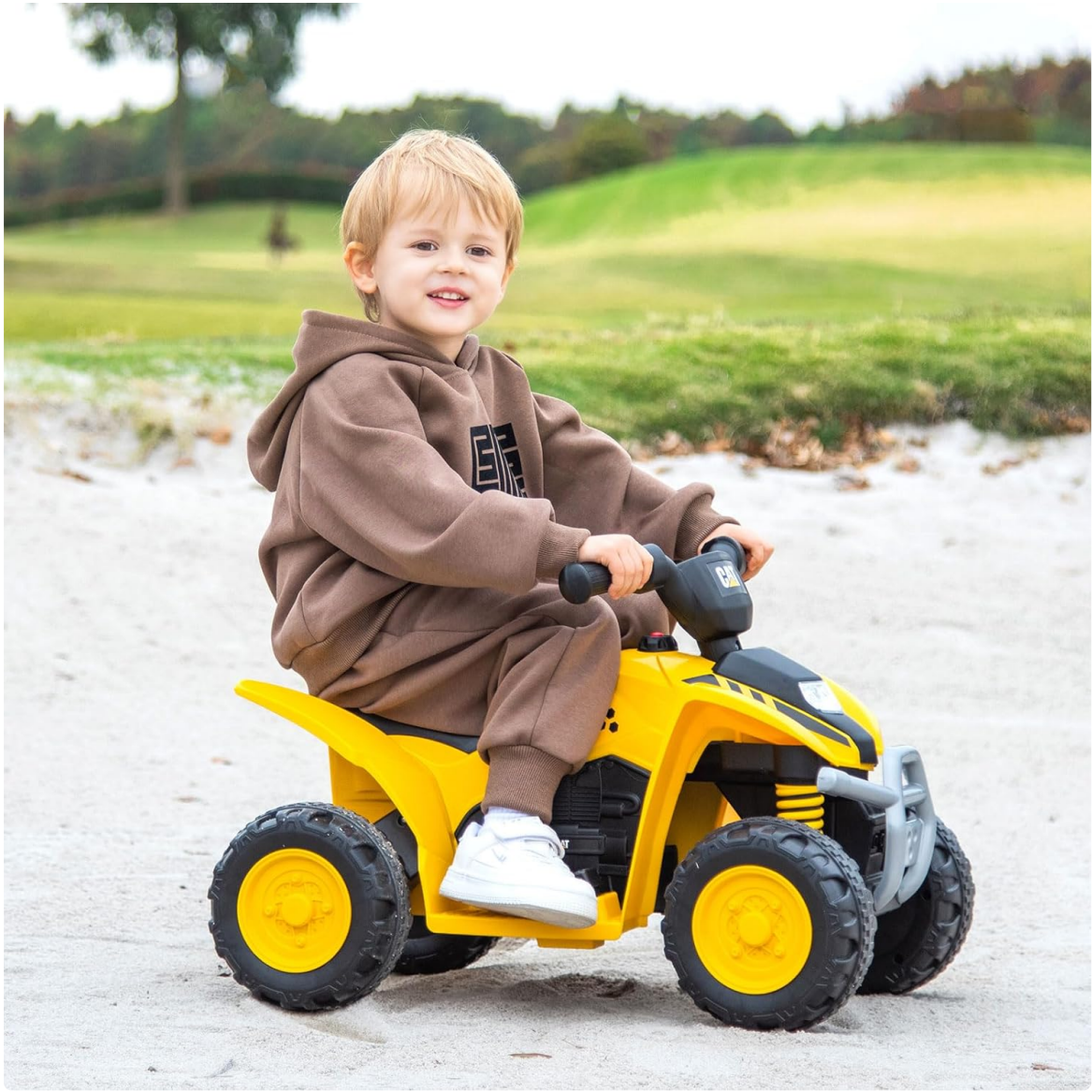
Image: The fully assembled Costzon Kids ATV in yellow, ready for use.