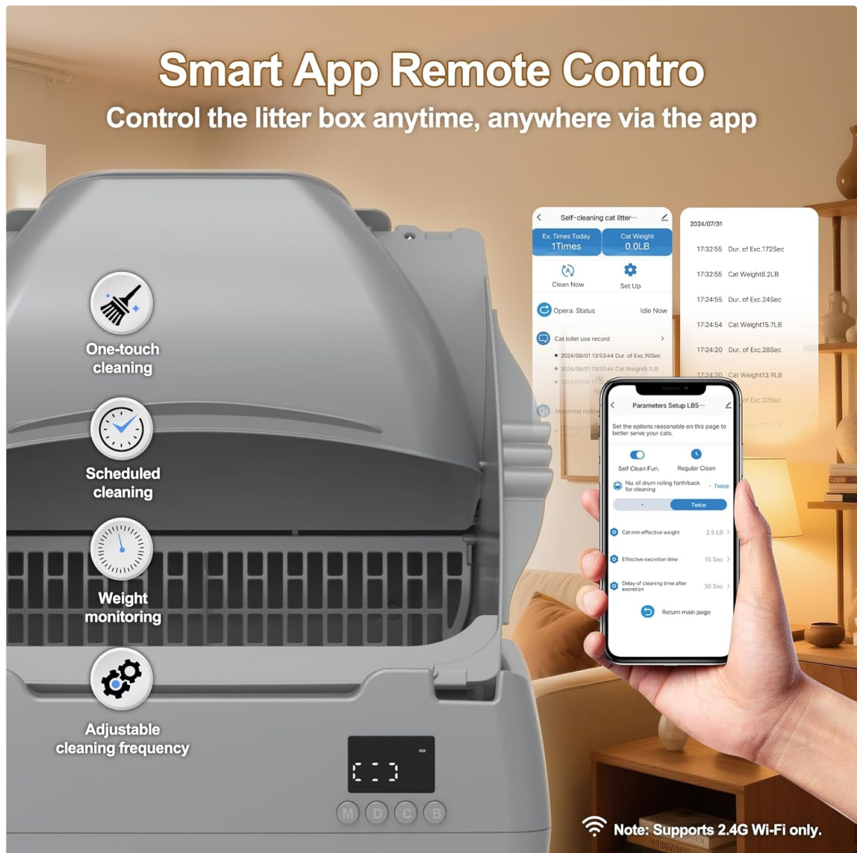
Image: A smartphone screen showing the 'Kitten Mew' app interface. The app provides options for one-touch cleaning, scheduled cleaning, cat weight monitoring, and adjusting cleaning frequency, demonstrating comprehensive remote control capabilities.