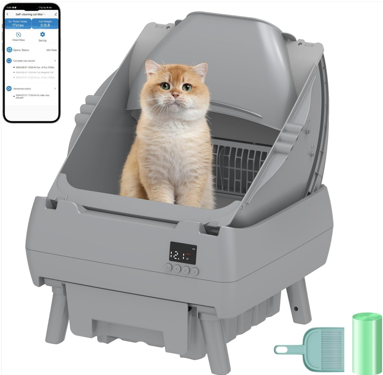
Image: The Cegimus Automatic Self-Cleaning Cat Litter Box in grey, featuring an open design and a digital display. A cat is shown sitting inside the litter box, and a smartphone screen displays the companion app's interface, highlighting its smart control capabilities.