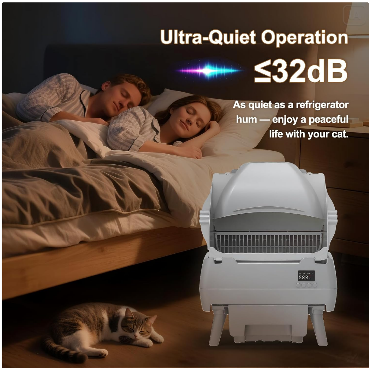
Image: A bedroom scene at night with a couple sleeping soundly. In the foreground, the Cegimus Automatic Self-Cleaning Cat Litter Box is shown operating quietly (indicated by '≤32dB'), with a cat resting nearby, emphasizing its ultra-quiet performance.