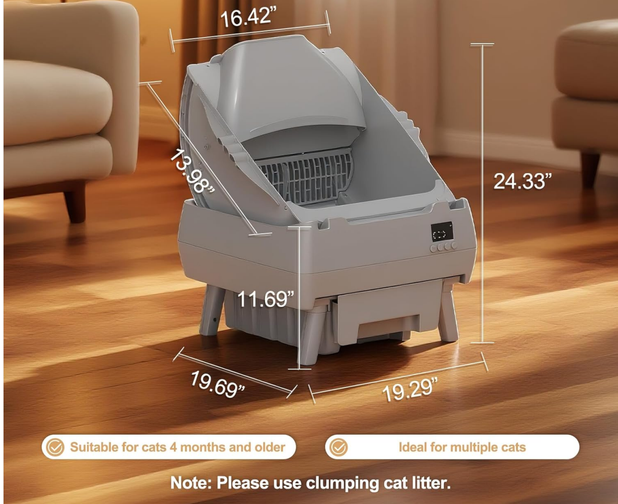
Image: A detailed diagram illustrating the dimensions of the Cegimus Automatic Self-Cleaning Cat Litter Box. Key measurements are provided, along with notes indicating its suitability for cats 4 months and older and its effectiveness for multi-cat households.